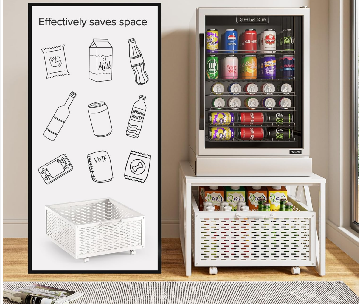
Image: The stand providing large capacity storage, effectively saving space with a removable basket that can be pulled out.