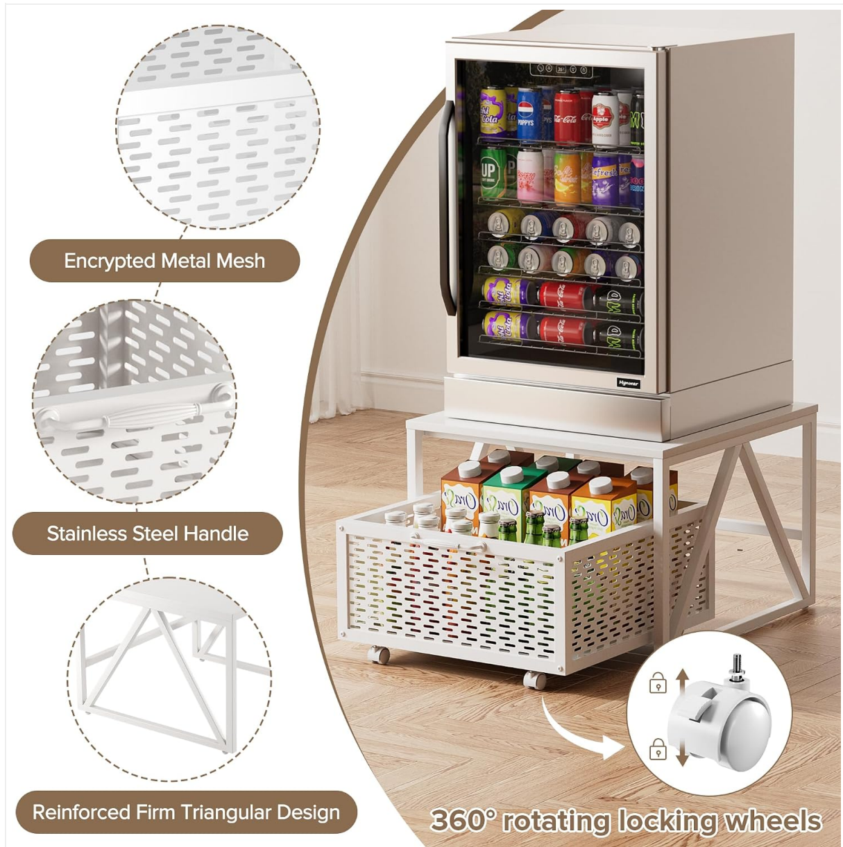
Image: Detailed view of the stand's features, including the mesh drawer, handle, triangular frame, and locking wheels.

Video: Official assembly guide for the Urban Deco Mini Fridge Stand, demonstrating step-by-step construction.