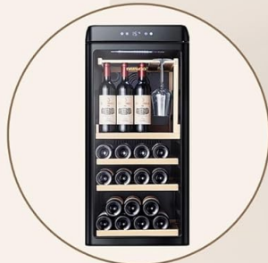
Freestanding Wine Cabinet