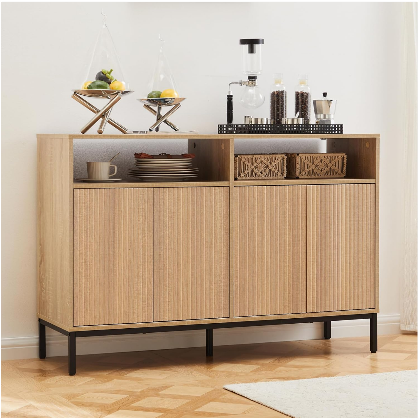
Image: Front view of the assembled Mericonia Farmhouse Buffet Sideboard Cabinet in a natural wood finish, showcasing its fluted doors and open top shelves, styled in a home environment.