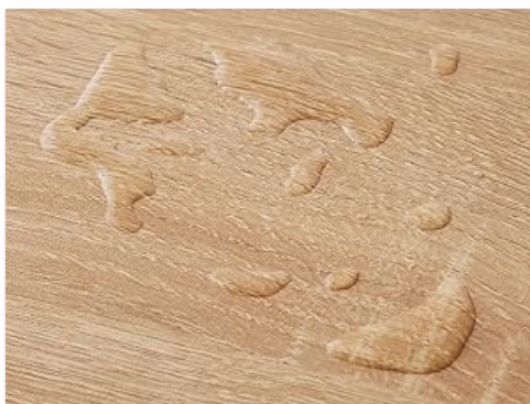
Image: Close-up of water droplets on the cabinet's wood surface, demonstrating its water-resistant properties. Prompt cleaning of spills is still recommended.