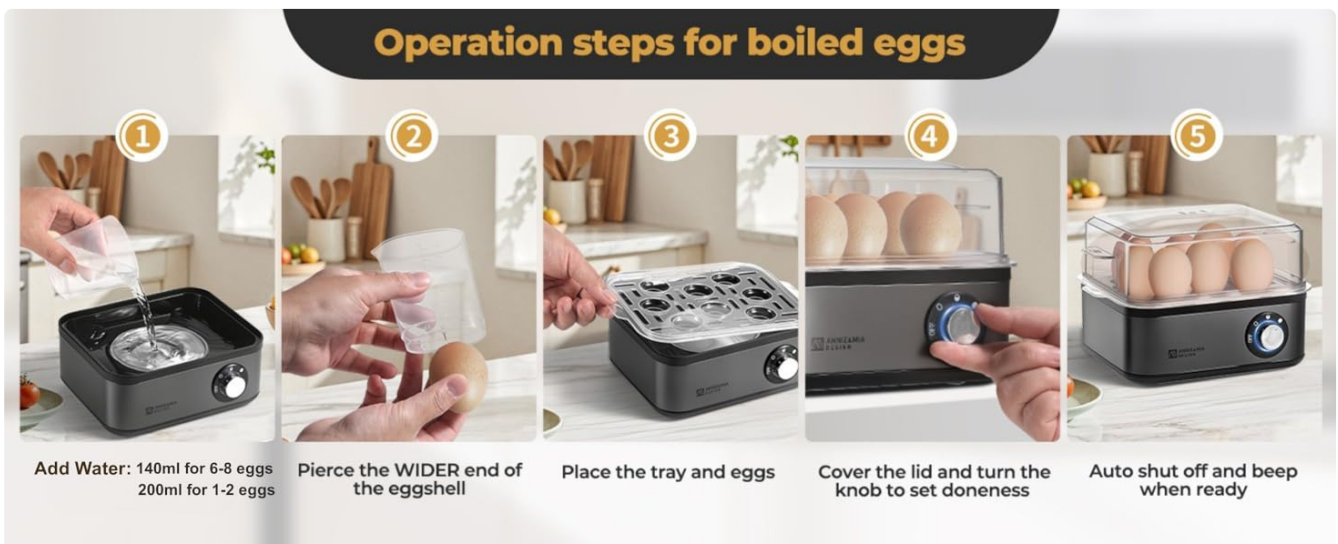
Image: Visual guide showing the steps for boiling eggs, including piercing, adding water, placing eggs, covering, and setting the knob.