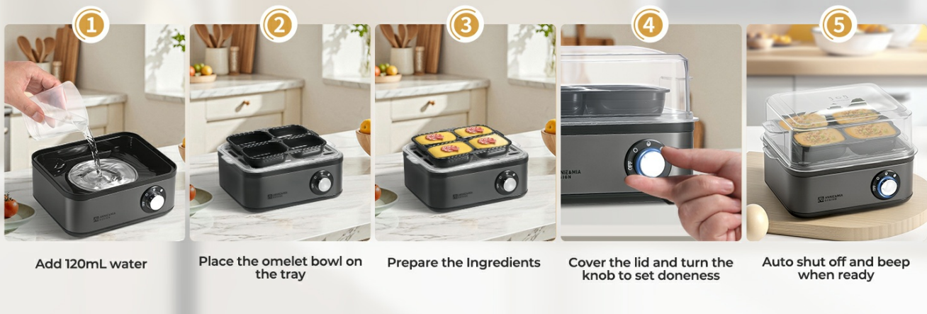
Image: Visual guide showing the steps for preparing poached eggs or omelets using the specialized tray.