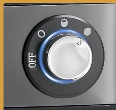
Image: Close-up of the egg cooker's knob control and examples of soft, medium, and hard-boiled eggs.

3 settings, auto shut-off – no guesswork, just perfect eggs!