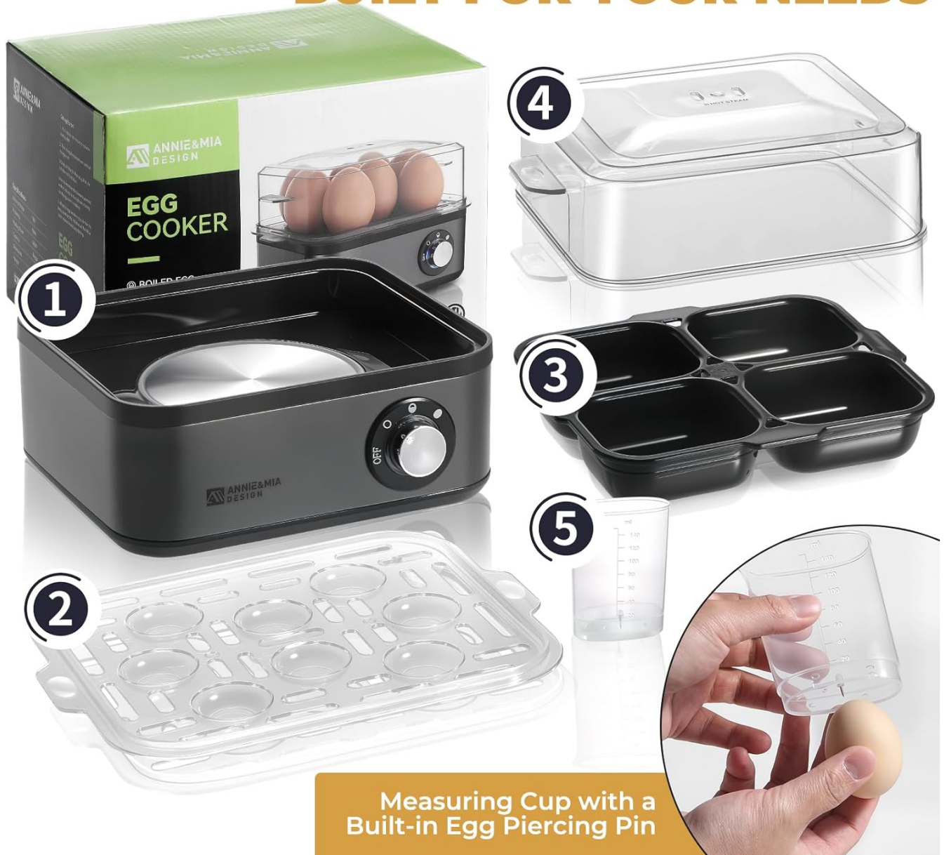
Image: All components of the egg cooker laid out, including the base, lid, egg tray, poaching tray, and measuring cup.