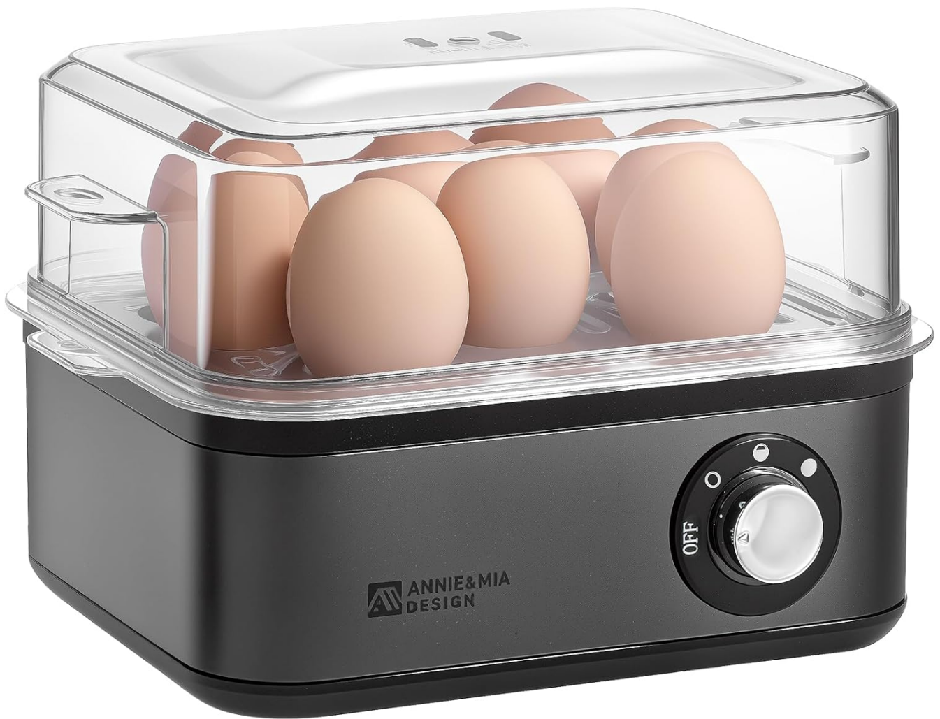
Image: The Annie & Mia Design Electric Egg Cooker in black, with eggs visible through its transparent lid.