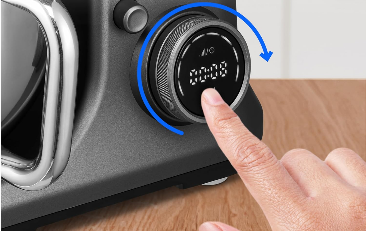
Figure 4: Close-up of the digital touch display and control knob.

Komfortable Bedienung und präzise Kontrolle aller Funktionen auf einen Blick