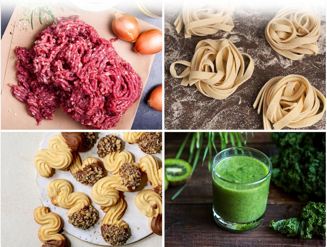
Figure 9: The kitchen machine can prepare various items, including smoothies.

Vom Fleischwolf und der Zubereitung von Würsten bis hin zu frischen Smoothies, Nudeln und Keksen.