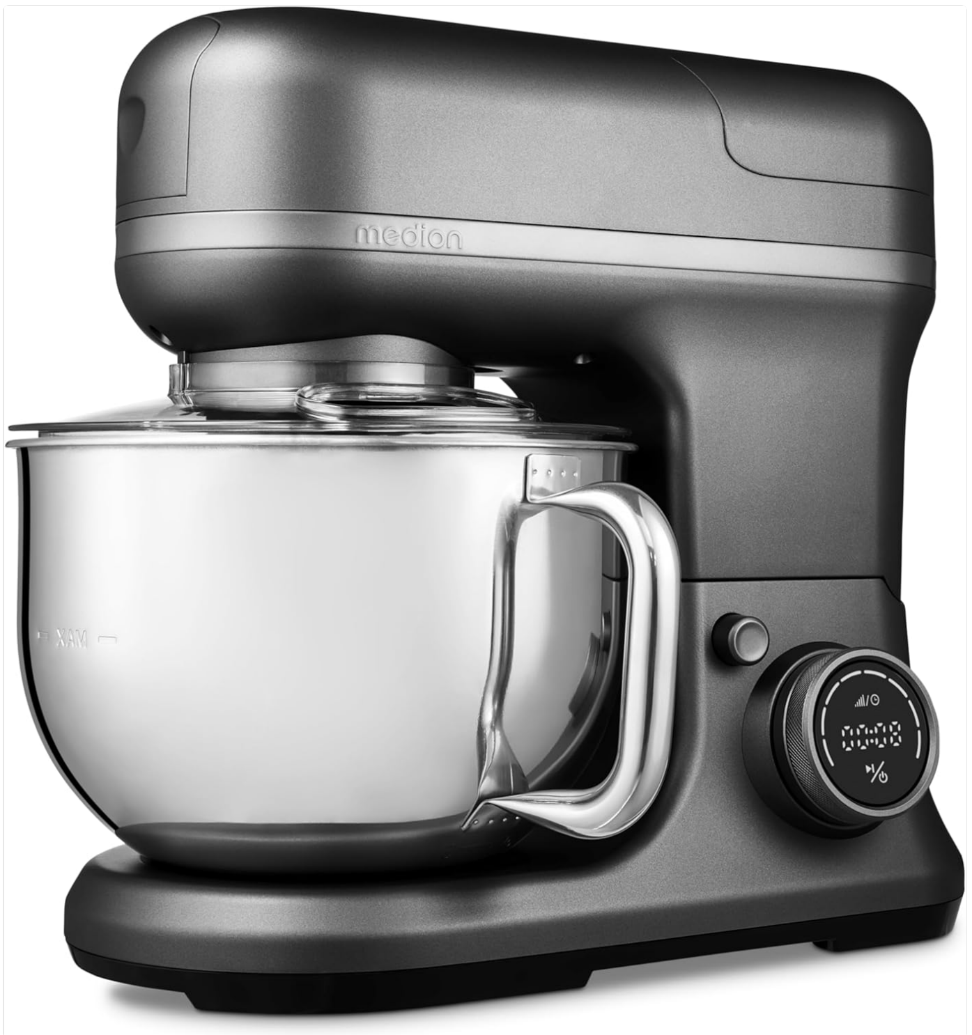
Figure 3: The main unit of the MEDION Kitchen Machine.