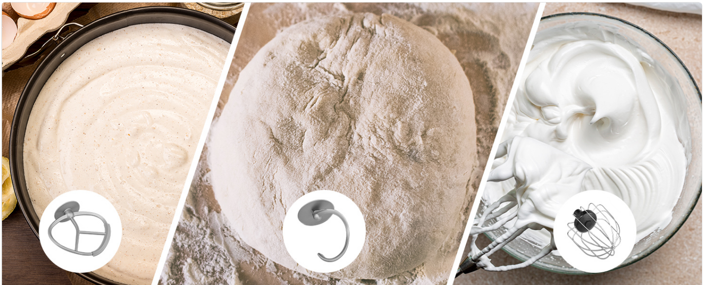
Figure 7: Examples of mixing tasks: cake batter, dough, and whipped cream.