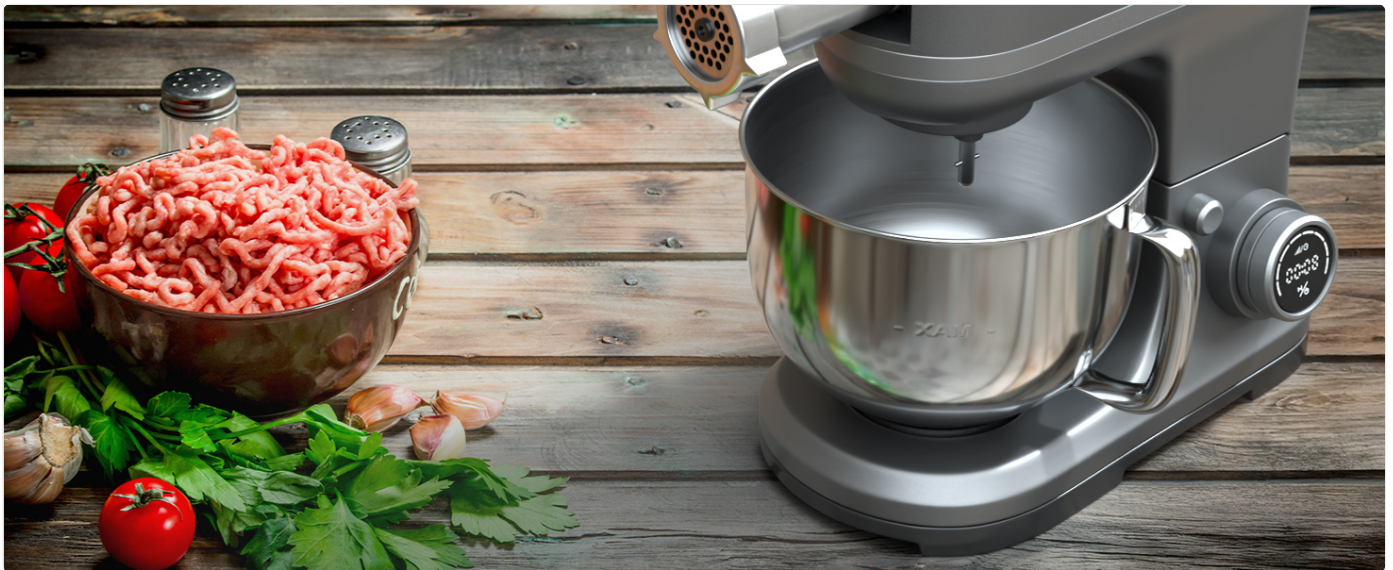
Figure 8: Meat grinding with the MEDION Kitchen Machine.