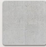
Solid Concrete (Need anchors)