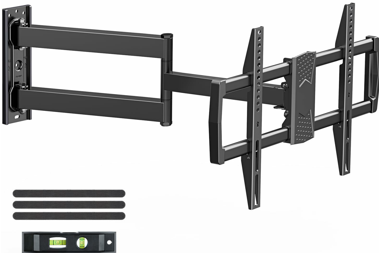
Figure 3: The mount extends up to 32 inches for versatile viewing and retracts to 3 inches to save space.