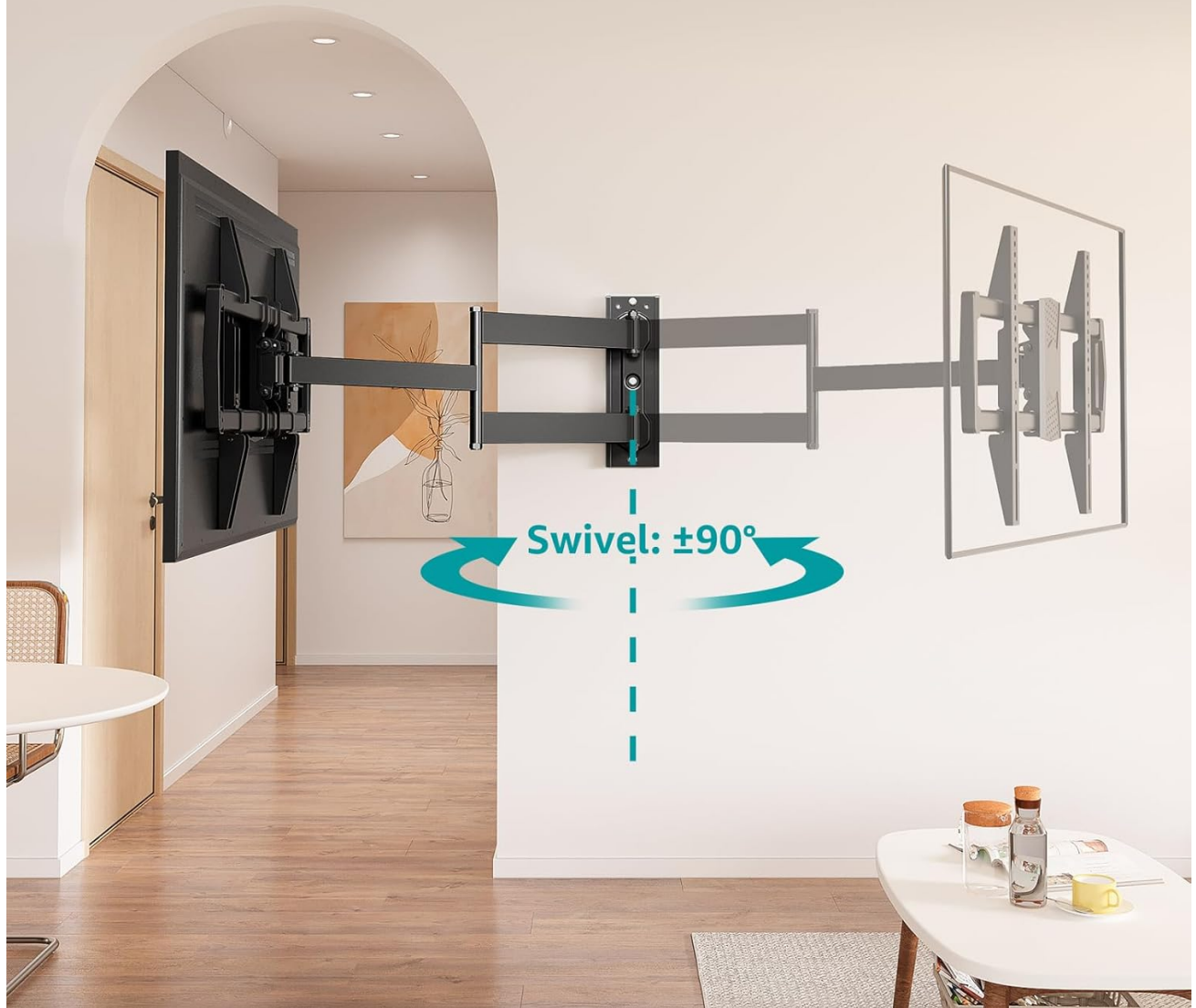
Figure 4: The mount offers a +/- 90 degree swivel for flexible viewing angles.