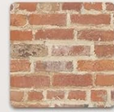
Brick Wall (Need anchors)