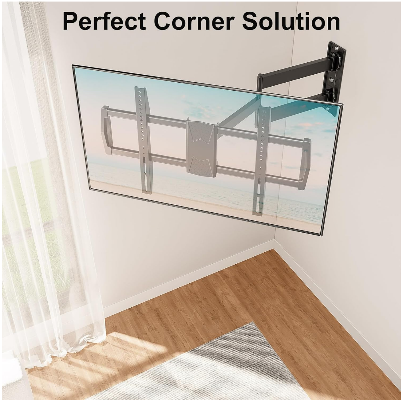
Figure 5: The long arm design provides a perfect solution for corner TV mounting.