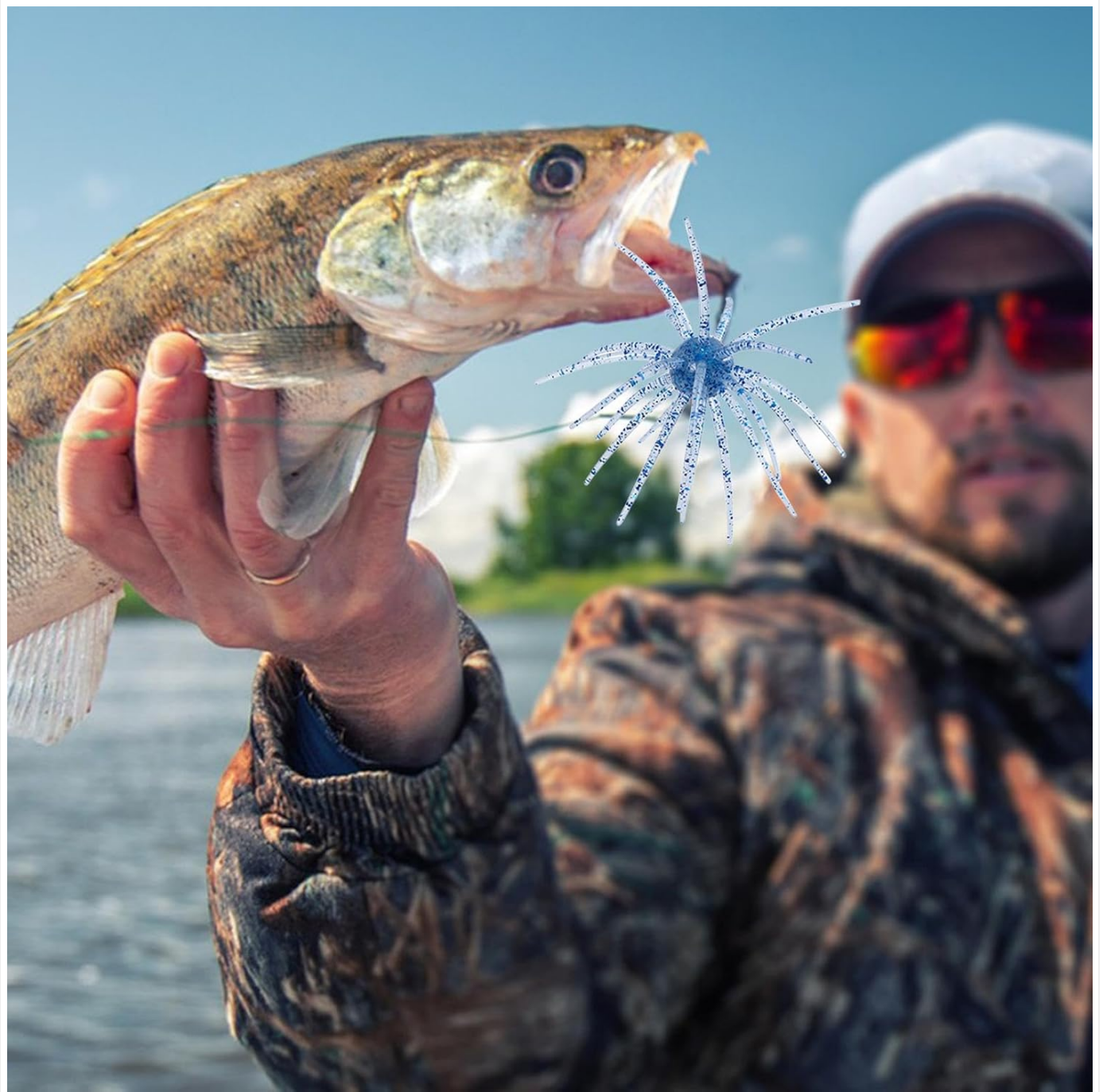
Figure 3: Example of a fish caught using the Soft Bait Sea Urchin Lure, demonstrating its effectiveness.