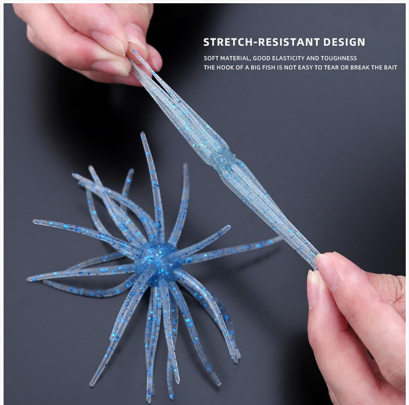
Figure 2: The lure's stretch-resistant PVC material, demonstrating its durability during rigging and use.