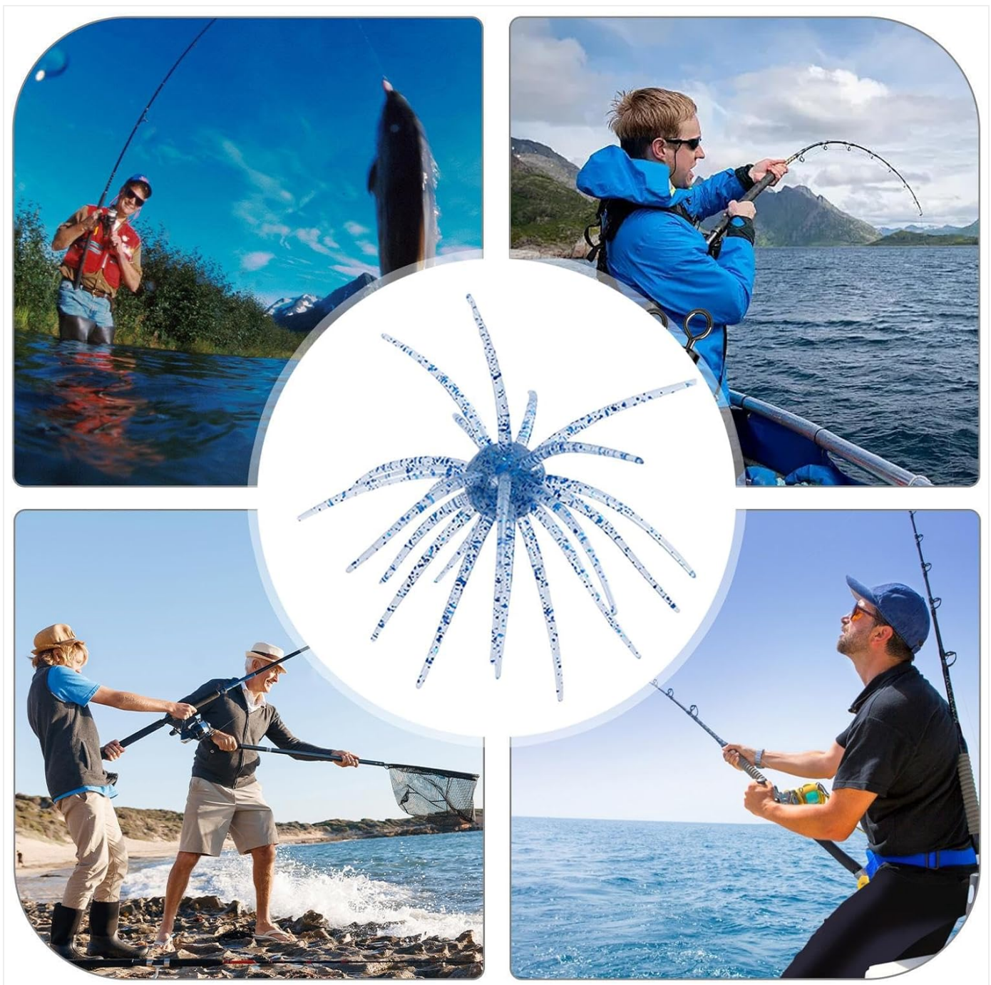
Figure 4: The lure being used in diverse fishing environments, from rivers to open water.