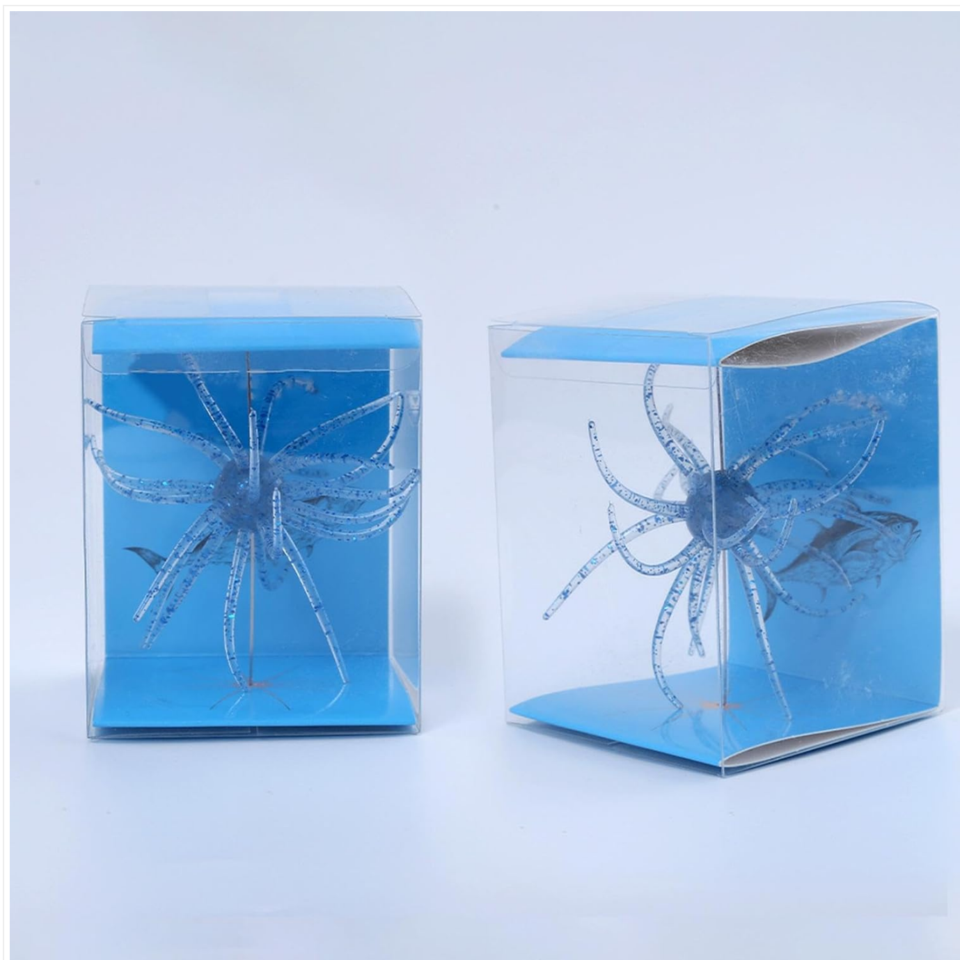
Figure 5: Storing the lures in their protective packaging helps maintain their shape and integrity.