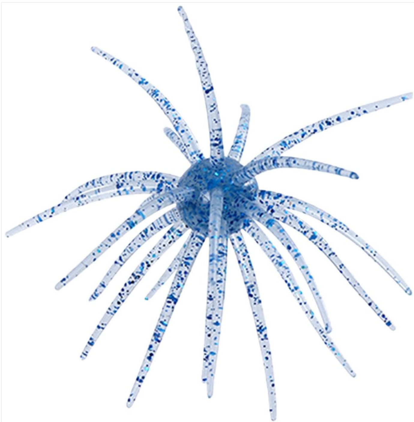
Figure 1: The Soft Bait Sea Urchin Lure, featuring its unique design with multiple tentacles and a central body.

The Soft Bait Sea Urchin Lure is crafted from high-quality, durable PVC material, designed to withstand multiple fish bites while maintaining its soft, flexible texture. Its realistic sea urchin appearance, complete with distinct whiskers, enhances underwater visibility and appeal to target species.