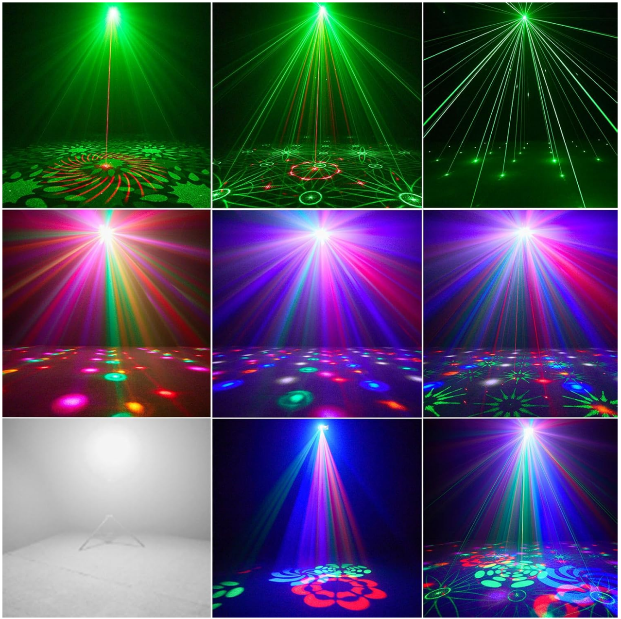
Image: Dynamic red and green laser patterns and starry effects projected onto a surface.