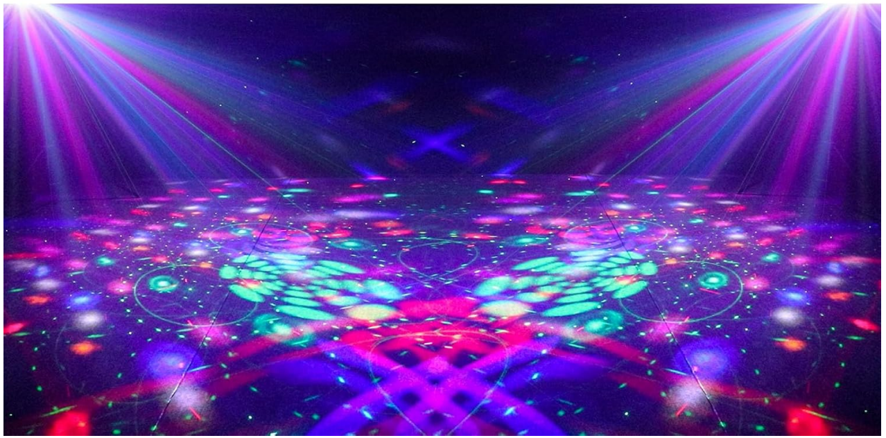
Image: Various colorful light effects, including patterns and beams, projected onto a surface.