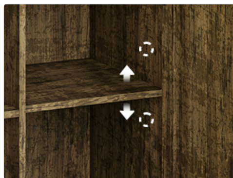
Image 4.2: Detail of the adjustable shelf pin system, illustrating how to change shelf height.