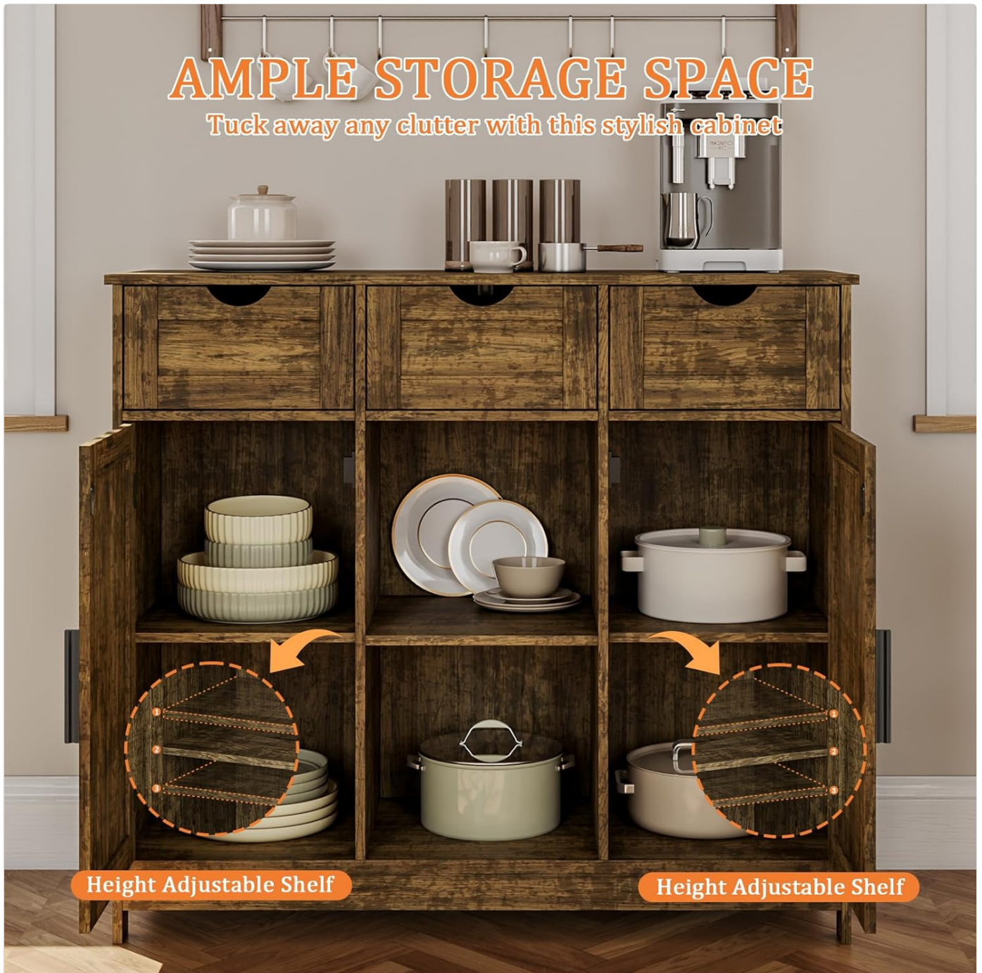
Image 4.1: The cabinet's interior, highlighting the adjustable shelf feature for flexible storage.

Tuck away any clutter with this stylish cabinet