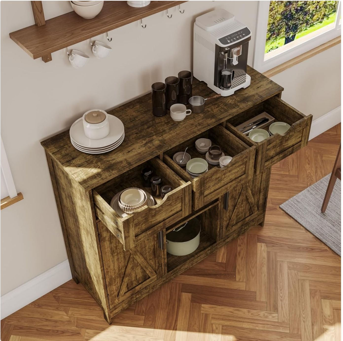
Image 4.3: The cabinet with drawers extended, demonstrating their capacity for organizing smaller items.