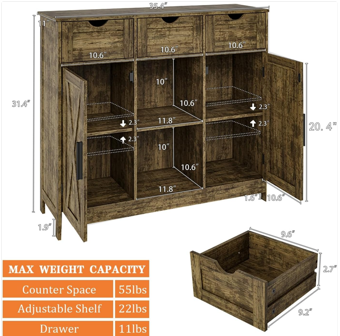
Image 2.1: Detailed dimensions and maximum weight capacities for the cabinet's counter space, adjustable shelves, and drawers.