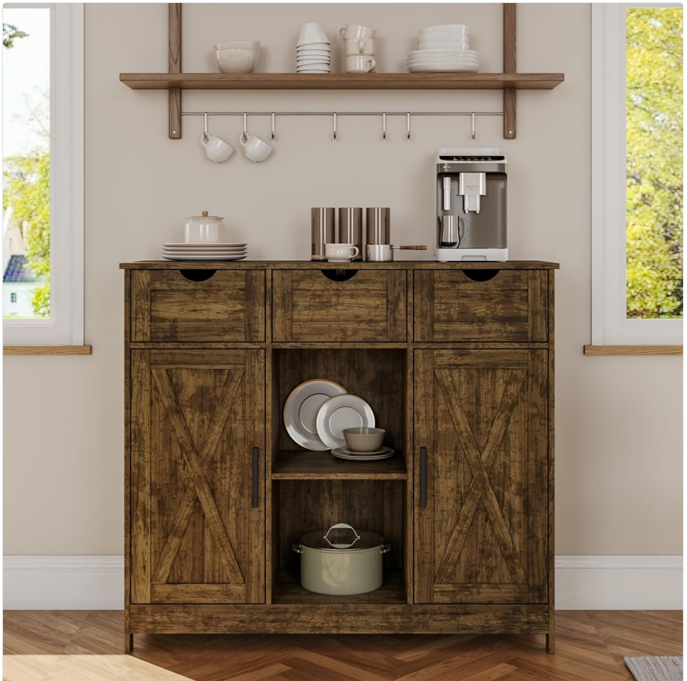
Image 1.1: The Viaozutis Retro Storage Cabinet, showcasing its design and potential placement in a home environment.