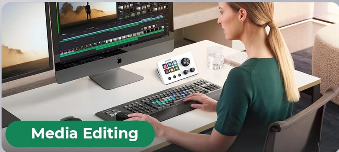
Figure 9: Wide Application of the Stream Controller SE.