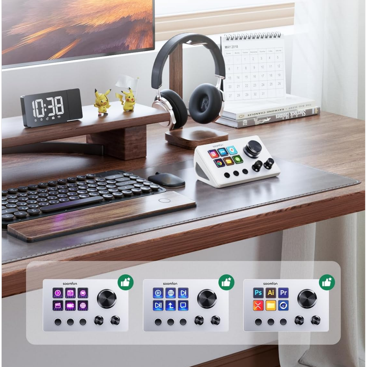
Figure 7: Customizable Key Icons.

Customize as many keyboard layouts as you like.