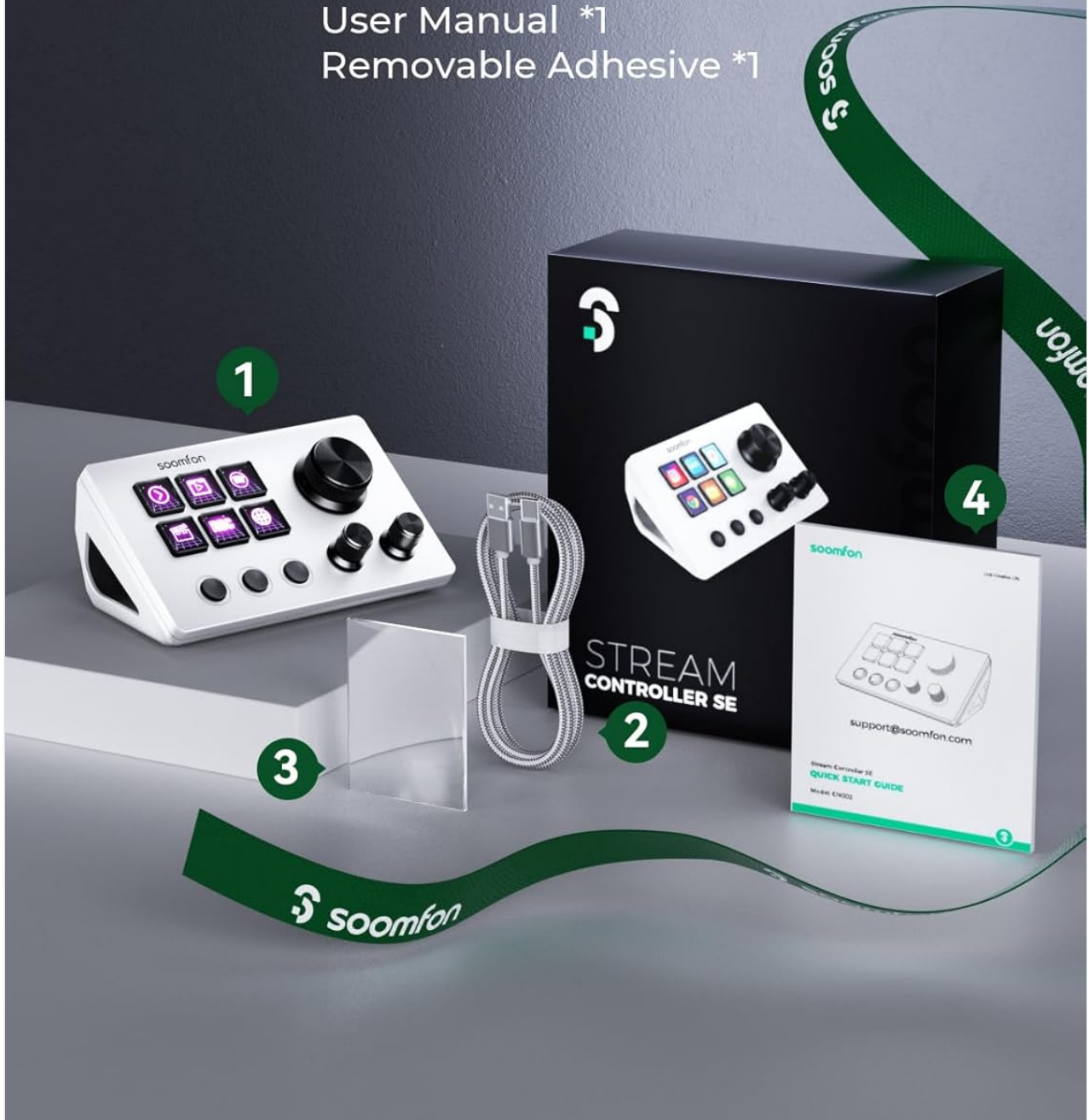
Figure 1: Package Contents of the Stream Controller SE.

Stream Controller SE *1 USB 2.0 Type-A to Type-C Cable *1 User Manual *1 Removable Adhesive *1