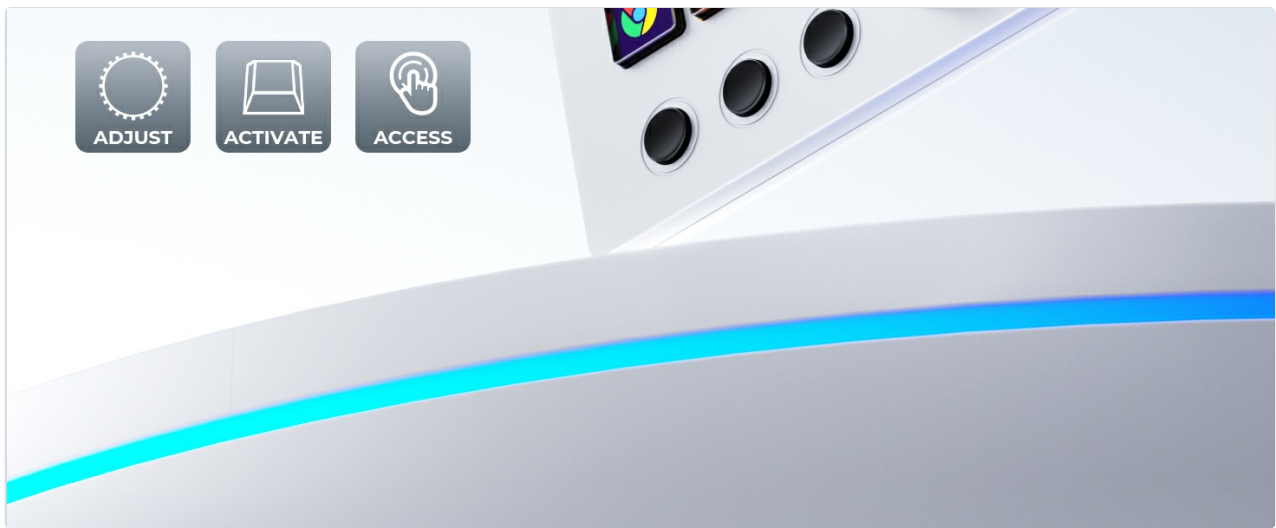
Figure 4: One-Touch Tactile Control and other design features.