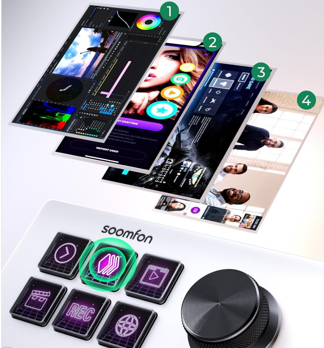
Figure 5: Multi-Step in One Tap functionality.

Assign multiple actions in one button, making it a powerful multitasking tool.