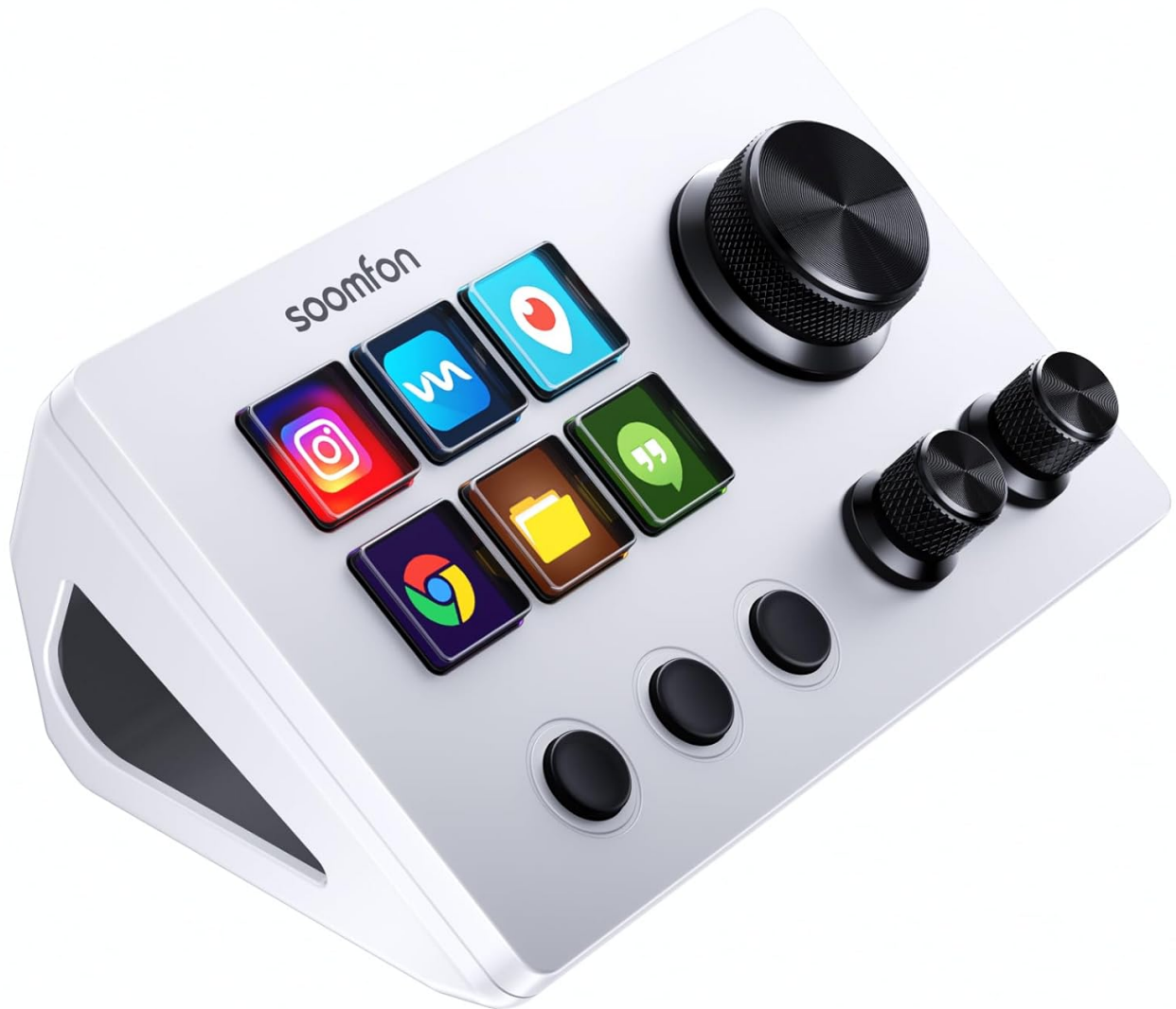
Figure 2: SOOMFON Stream Controller SE connected to a computer.

To fully utilize the features of your Stream Controller SE, you need to install the accompanying software. The software is compatible with Windows 10 (64-bit or higher) and MacOS Catalina (10.15 or higher). Please refer to the included User Manual for detailed instructions on where to download and how to install the software. Once installed, launch the application to begin customizing your control deck.