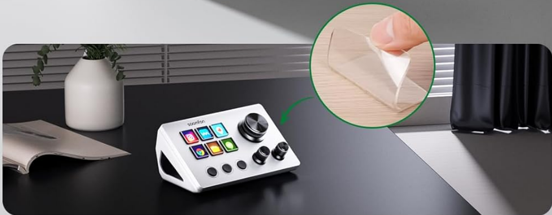
Figure 8: Removable Stand and Adhesive.