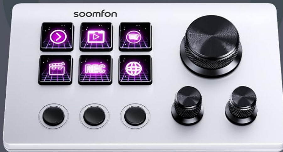
Figure 6: Extensive Plugins Marketplace.