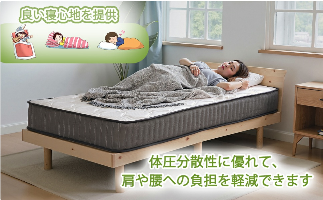
Image: A person sleeping peacefully on the mattress, demonstrating its comfort and support.

The VECELO mattress is designed to accommodate various sleeping positions, providing consistent support and comfort throughout the night. Its pocket coil system minimizes motion transfer, ensuring undisturbed sleep even with a partner.