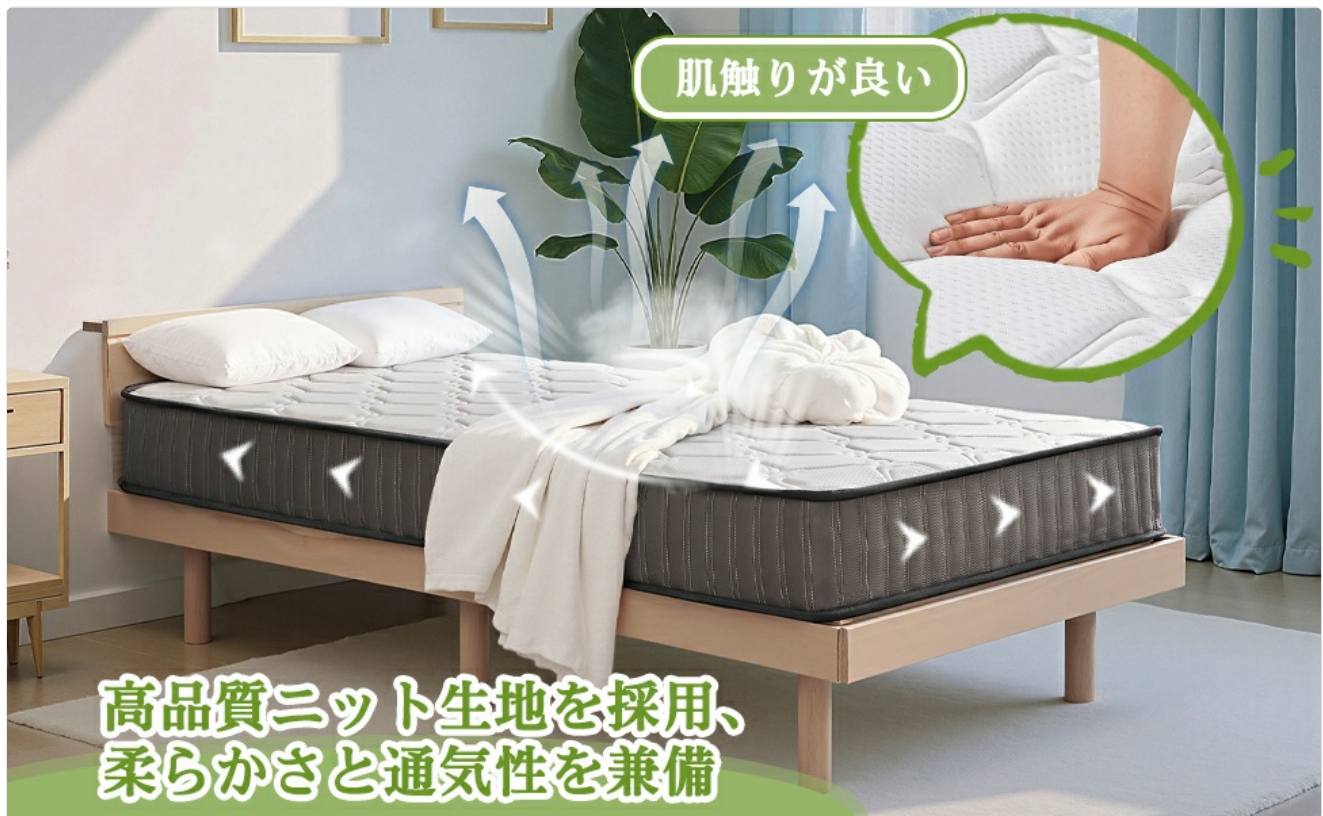
Image: A hand pressing on the mattress surface, illustrating the soft knit fabric and responsive feel.