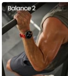
Amazfit Balance 2