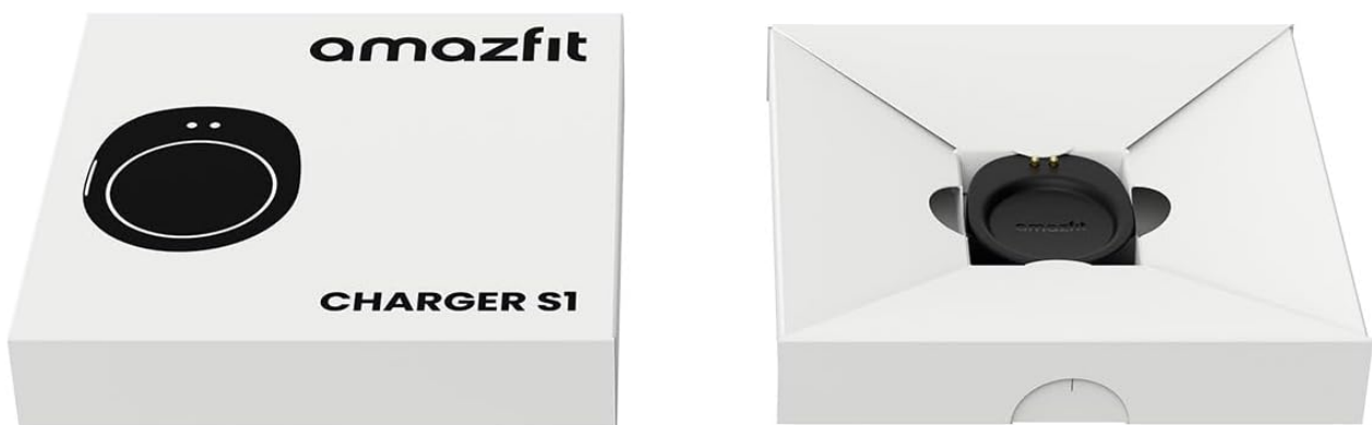
Image: Front view of the Amazfit Charging Base.