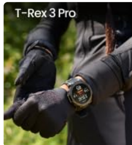
Amazfit T-Rex 3 Pro