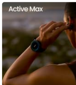
Amazfit Active Max