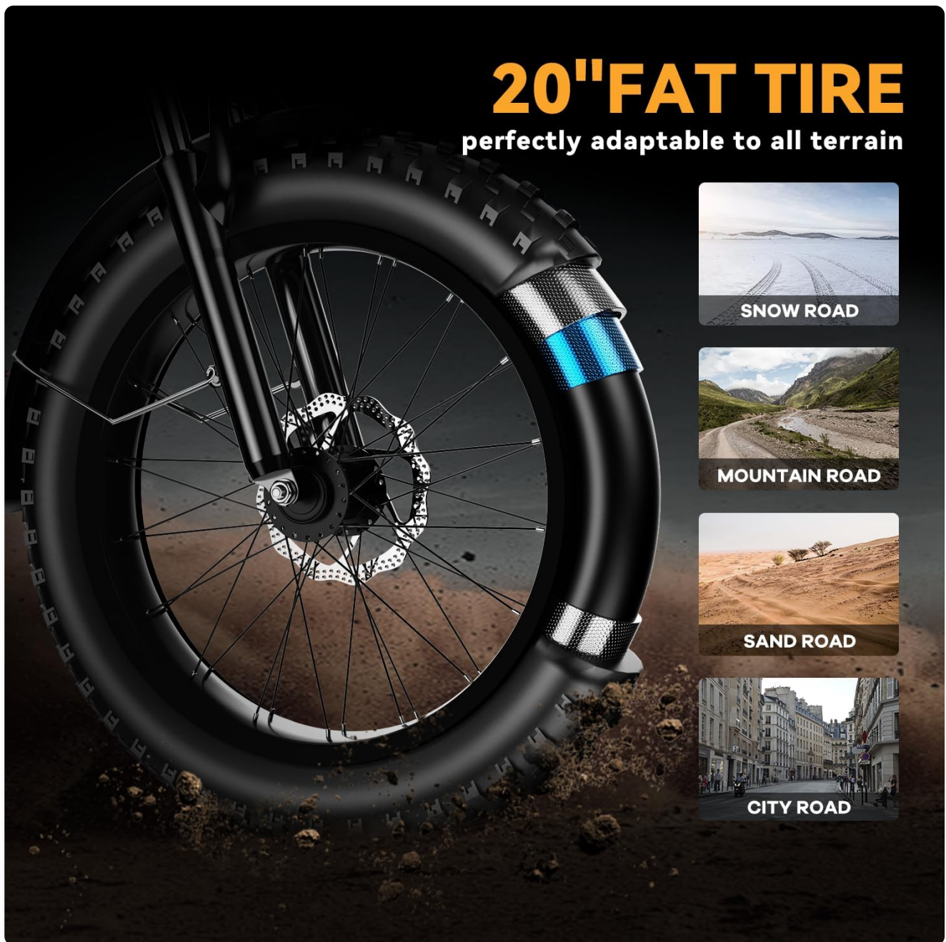
Figure 5: The 20-inch fat tires are perfectly adaptable to various terrains, including snow, mountain, sand, and city roads.