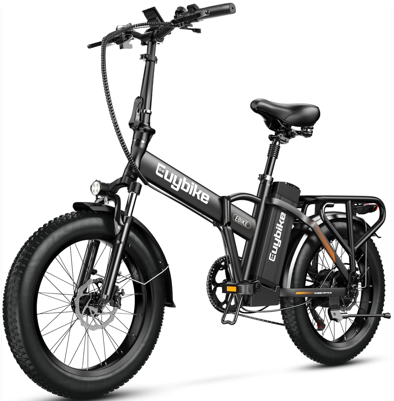
Figure 1: The bluebiko F6B-Black Classic 1000W Folding Electric Bike, showcasing its compact design and fat tires.