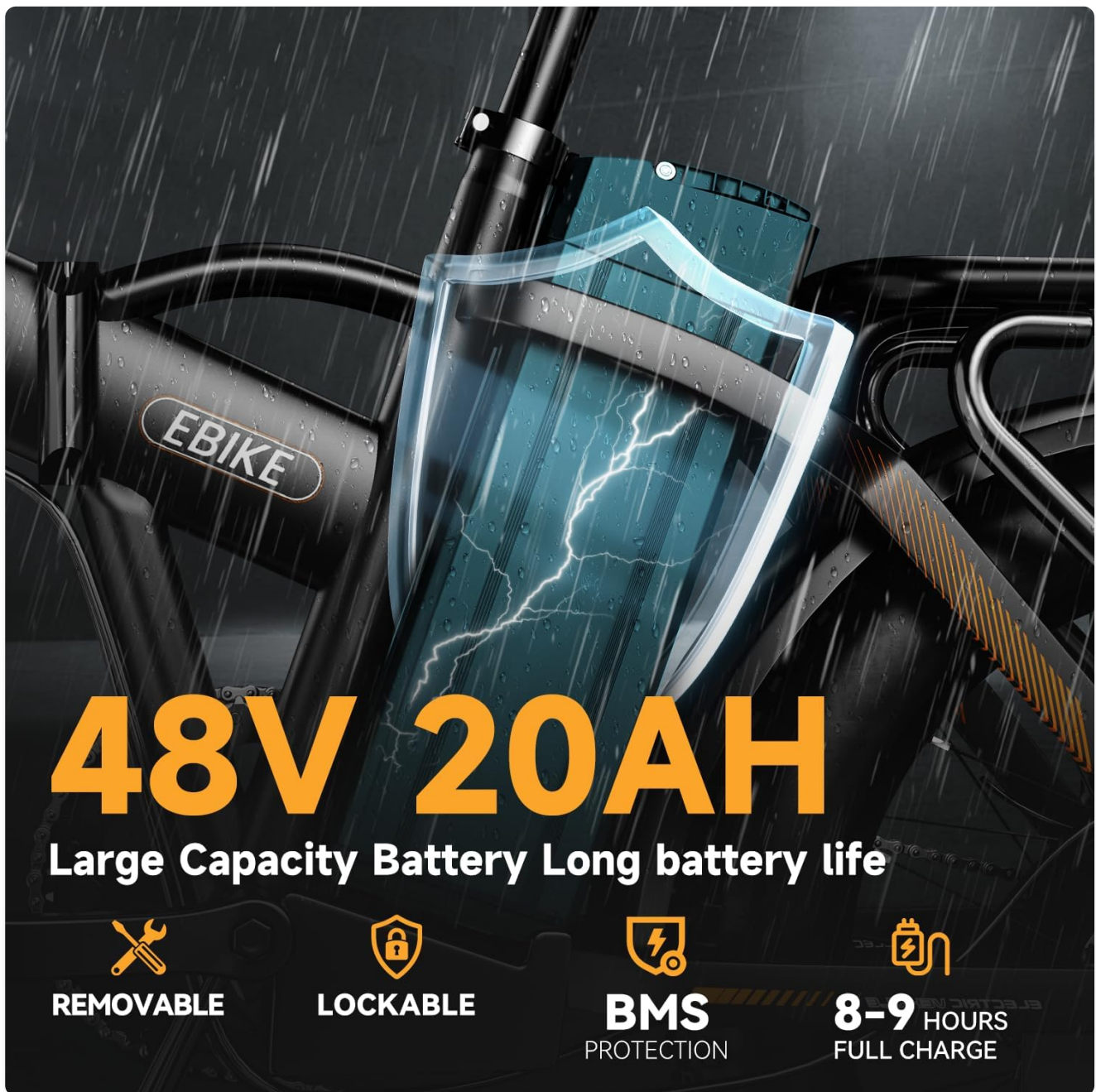
Figure 6: The 48V 20AH large capacity battery, highlighting its removable, lockable, and BMS protected features.