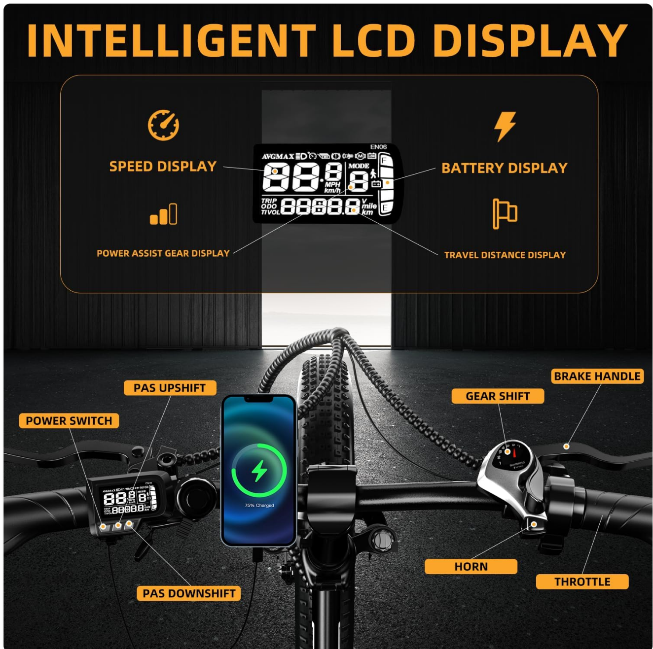
Figure 2: Overview of the intelligent LCD display and handlebar controls.

Carefully open the packaging and remove all components. Ensure all parts listed in the user manual are present. The package includes the main bike frame, front wheel, seat post with saddle, pedals, headlight, mudguard, and a toolkit.