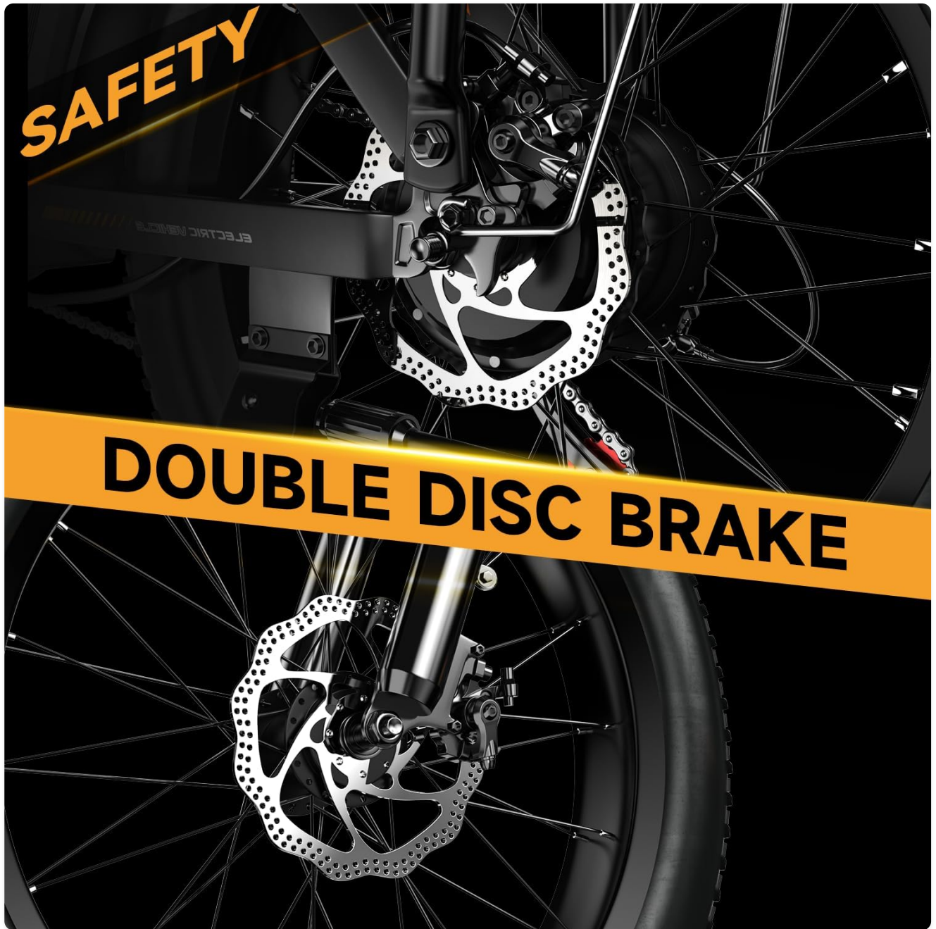
Figure 4: Illustration of the dual disc brake system, highlighting its robust design for effective stopping.