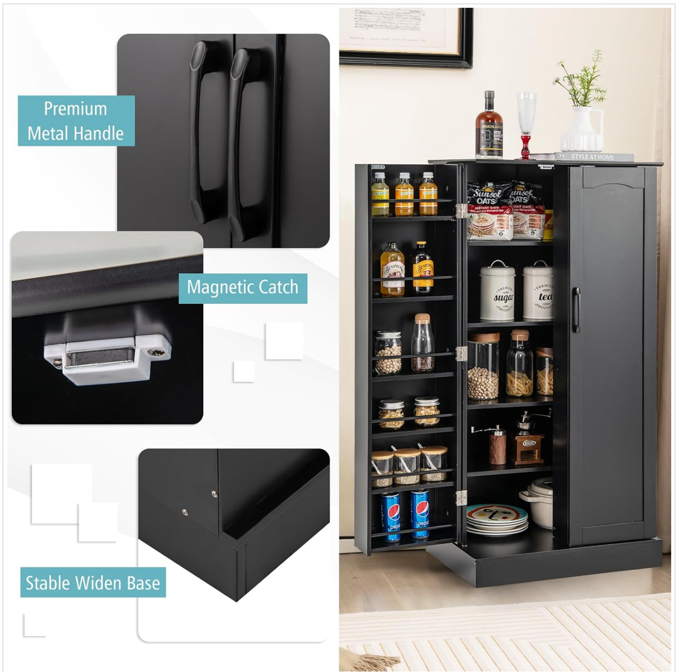
Image: Detailed close-up views of the cabinet's premium metal handles, the magnetic catch mechanism that secures the doors, and the stable widened base, illustrating key functional components.