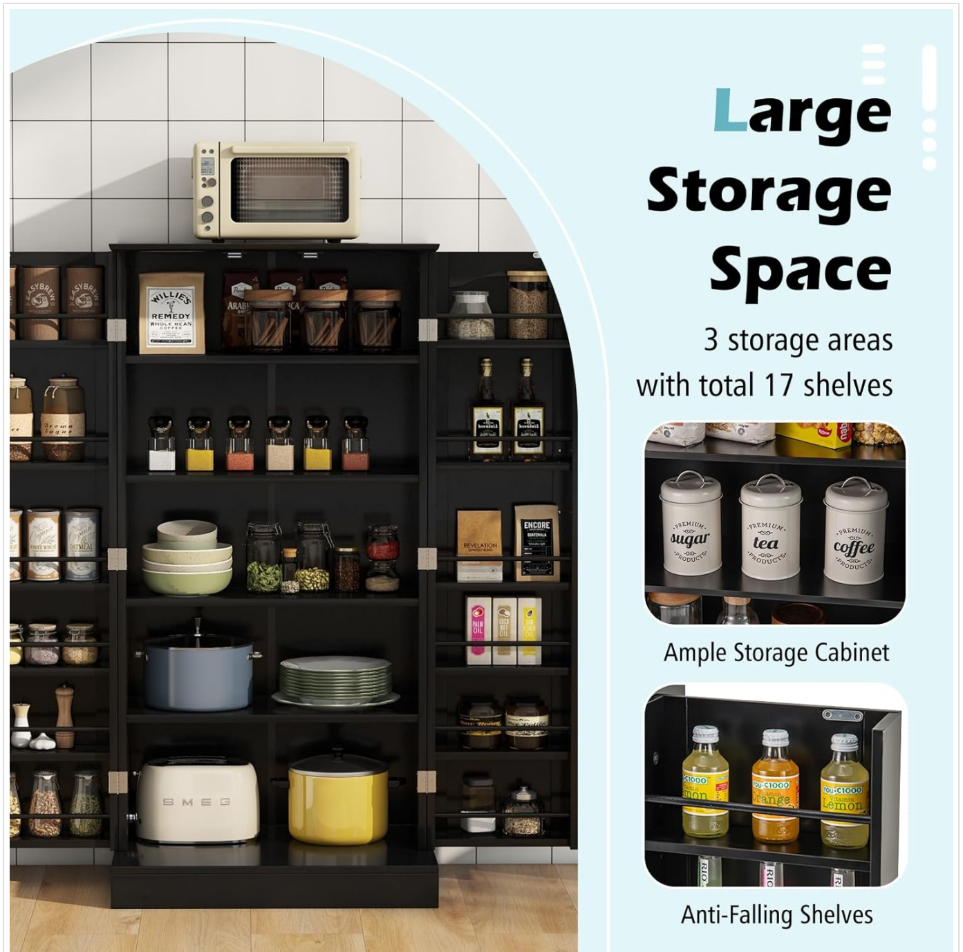
Image: A graphic titled 'Large Storage Space' showing the cabinet's interior with 3 distinct storage areas and a total of 17 shelves, emphasizing its ample capacity for various items.

This cabinet features a spacious top surface, 5 central shelves, and 12 side shelves, providing ample room for appliances, dishes, utensils, spices, and bottles. The design maximizes storage efficiency.