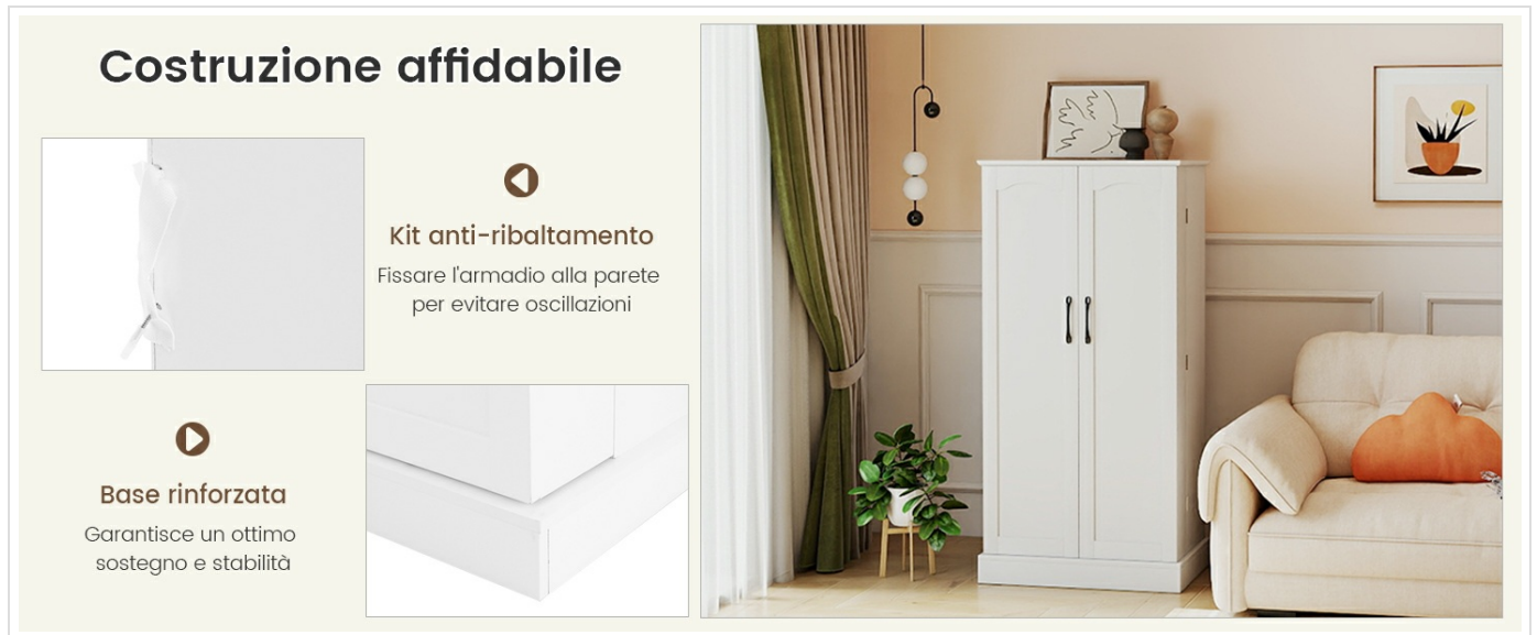
Image: A diagram illustrating the 'Costruzione affidabile' (Reliable Construction) of the cabinet, highlighting the anti-tip kit for wall attachment and the reinforced base for stability.