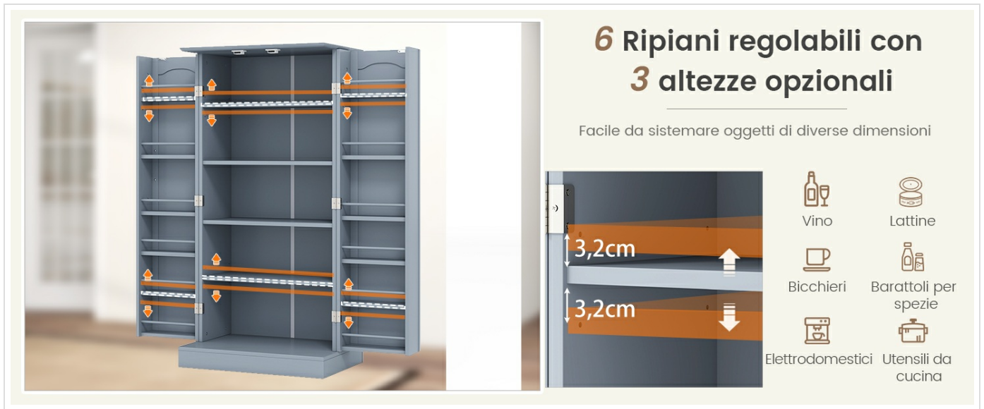
Image: A visual representation of the cabinet's '6 Ripiani regolabili con 3 altezze opzionali' (6 adjustable shelves with 3 optional heights), demonstrating how shelves can be repositioned to fit various items like wine bottles, cans, glasses, and small appliances.