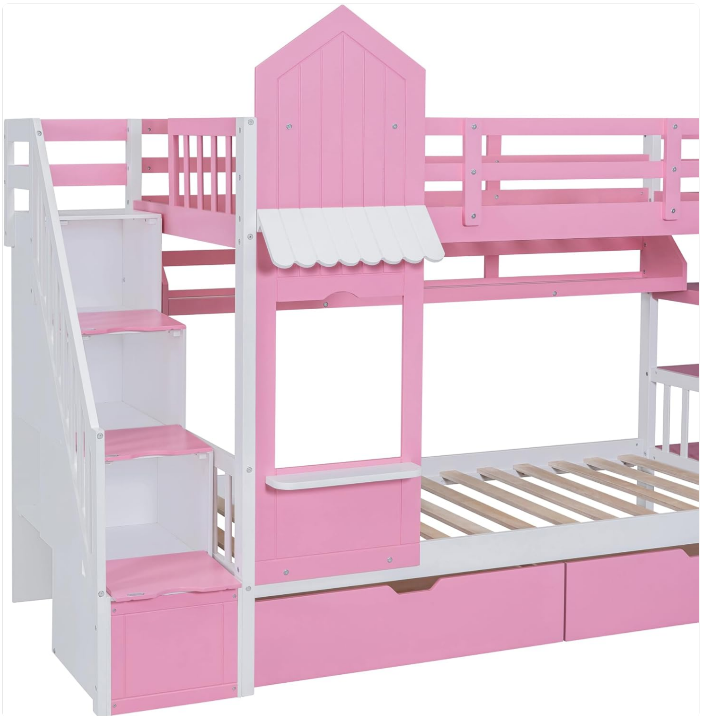
Figure 4: Close-up of the stairs unit, showing the integrated storage cubbies with hinged fronts.