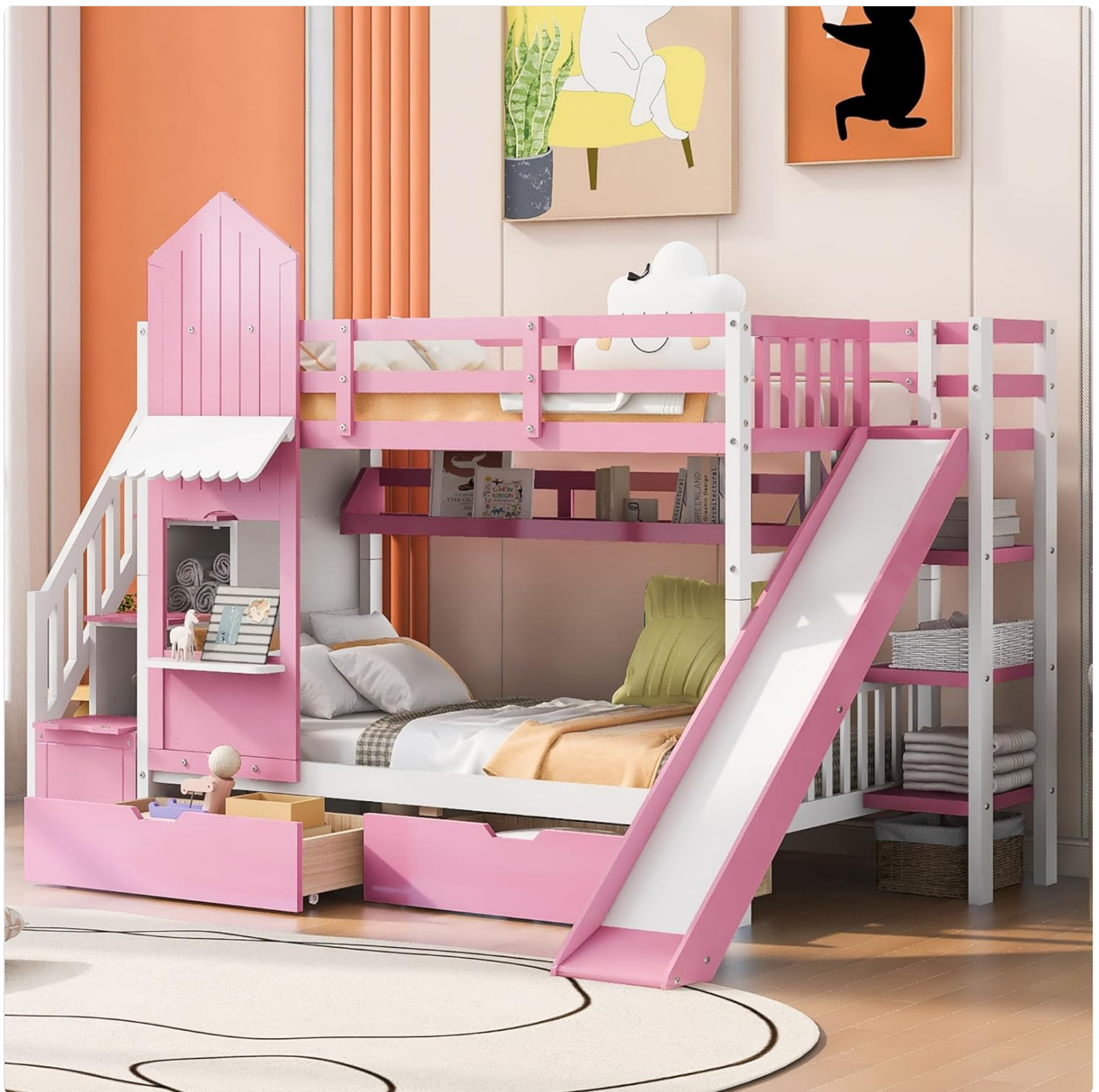
Figure 1: Overall view of the Twin Over Twin Bunk Bed with castle-style design, slide, and integrated storage.