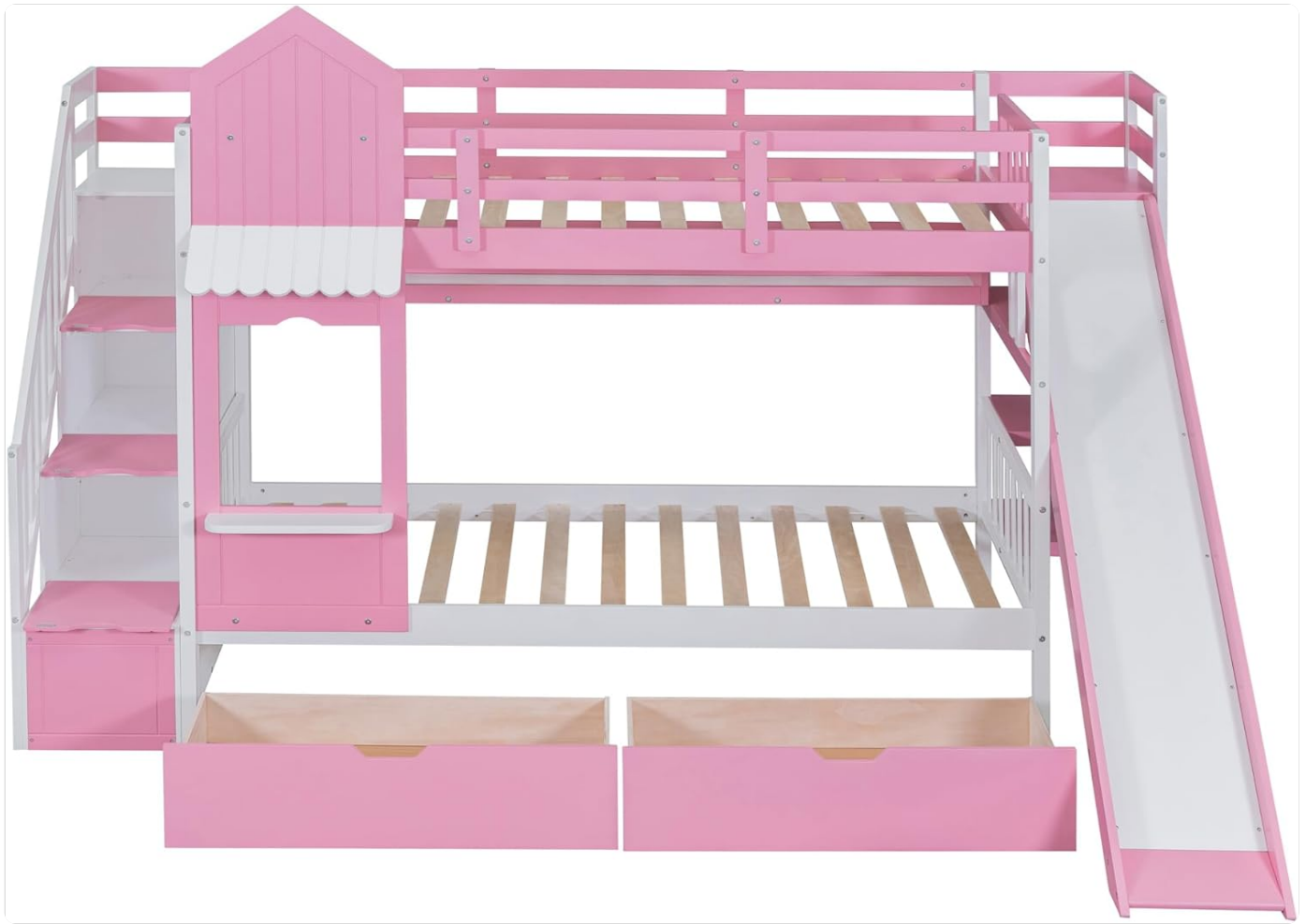
Figure 3: View of the two large storage drawers located beneath the lower bunk, ideal for larger items.