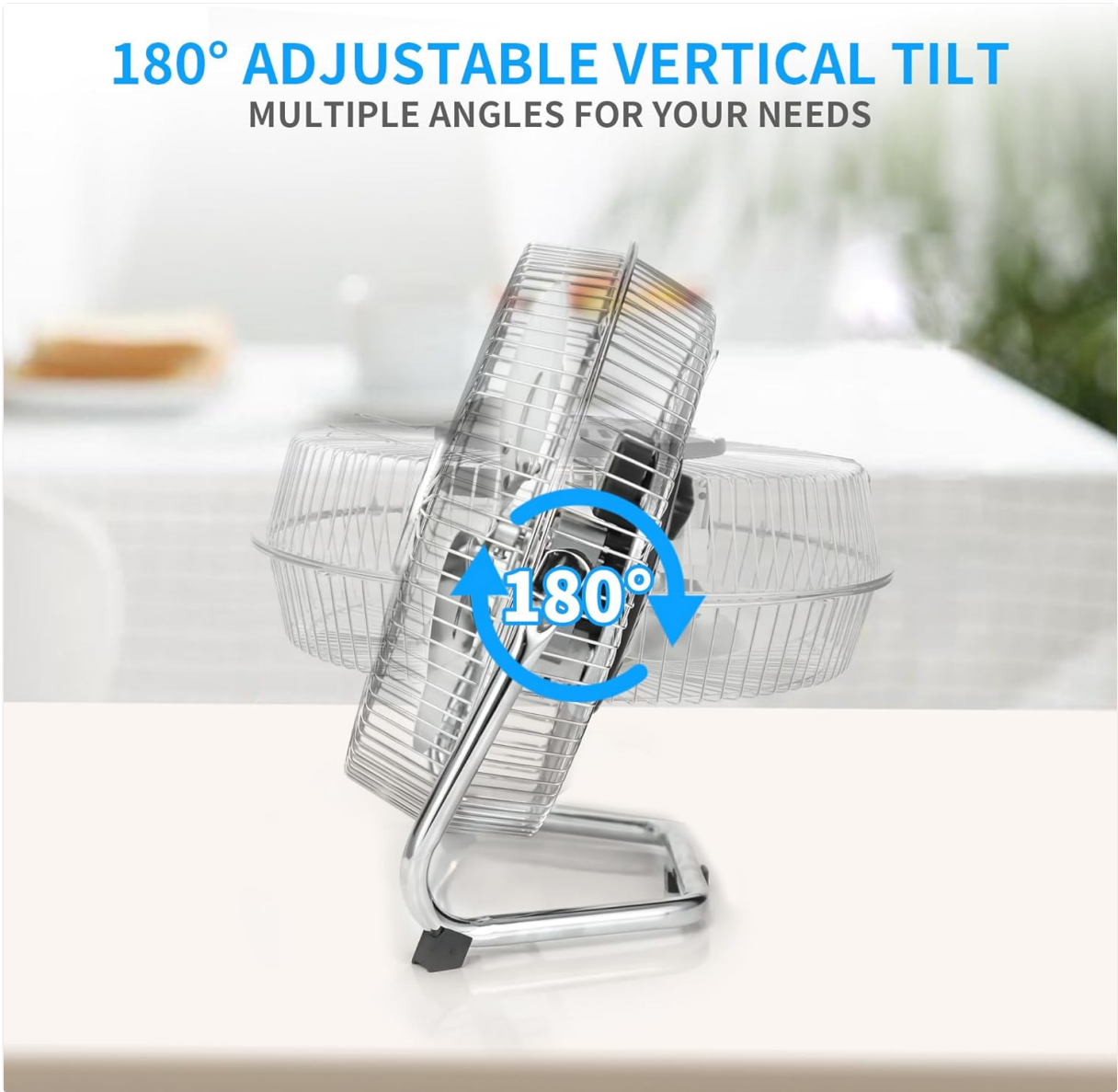
Figure 3.4: The fan features a 180-degree adjustable vertical tilt, allowing users to direct airflow as needed.