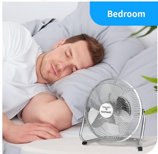
Figure 3.6: The fan shown in different household environments, including a living room, office, kitchen, and bedroom, highlighting its versatility.