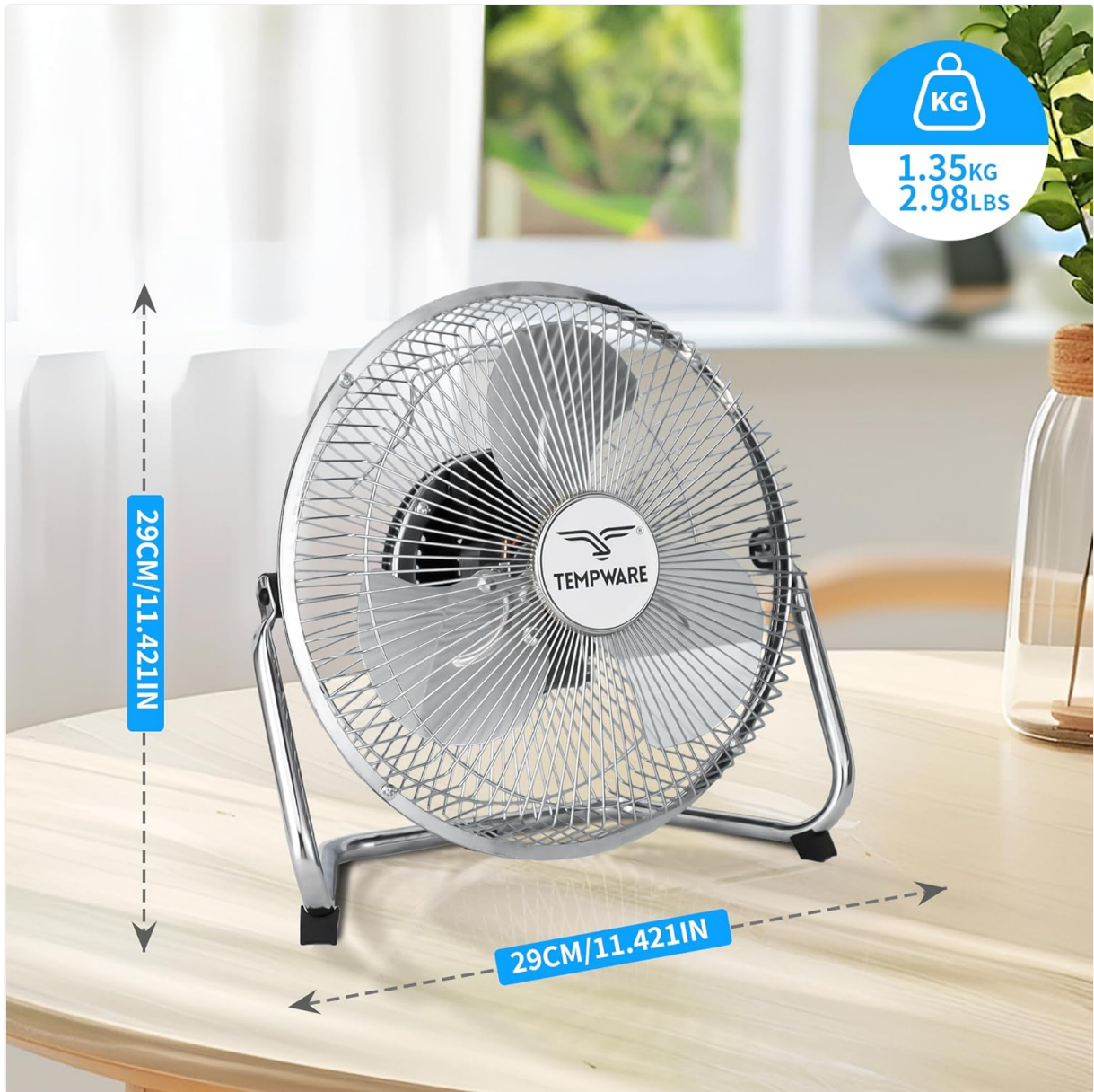
Figure 3.2: The fan's dimensions are approximately 11.4 inches in depth and width, as indicated in the image.