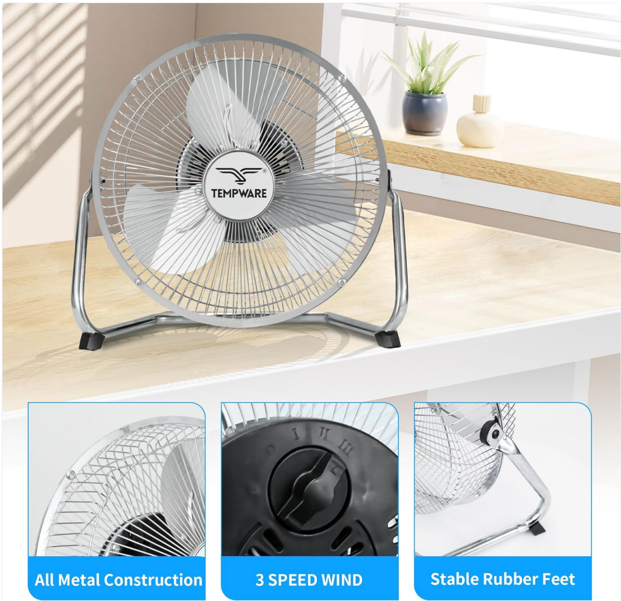
Figure 3.5: Close-up details showing the fan's all-metal construction, the 3-speed control dial on the back, and stable rubber feet on the stand.