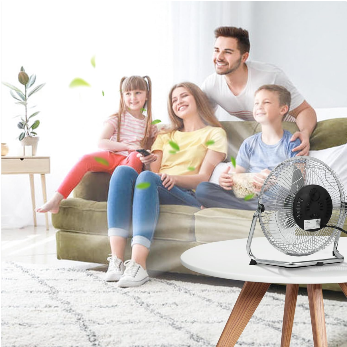
Figure 3.7: The fan operating in a living room, circulating air for a family relaxing on a sofa.