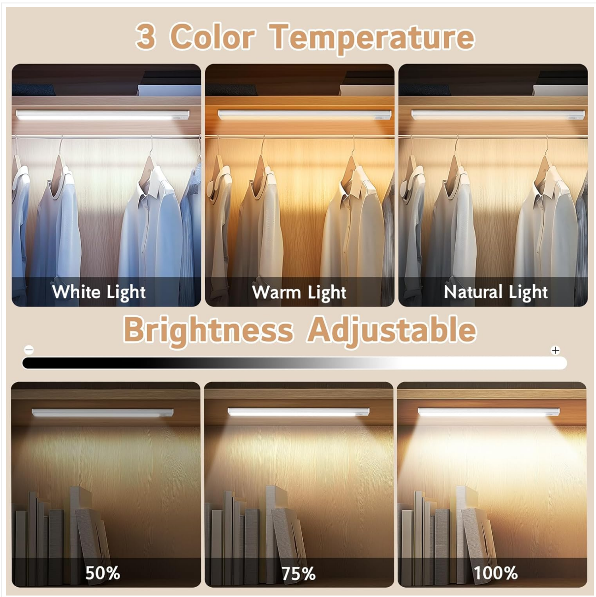
Figure 4: Demonstrating 3 color temperatures and brightness adjustment.