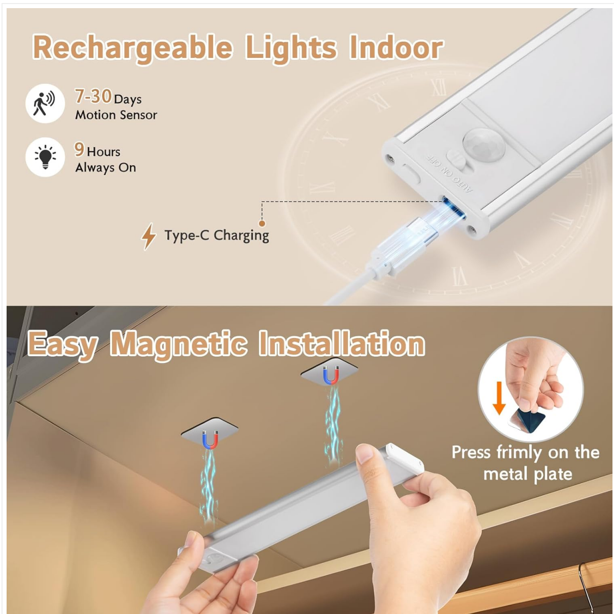
Figure 2: Illustration of USB-C charging and magnetic installation.

The magnetic attachment allows for easy removal for recharging or repositioning.