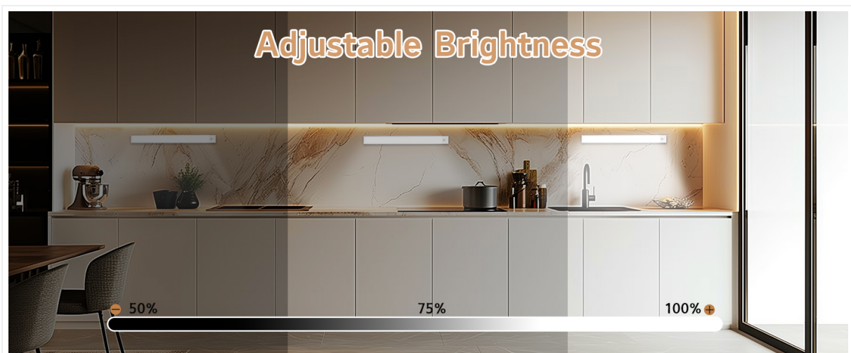
Figure 5: Adjustable brightness levels.

The brightness can be adjusted from 50% to 100%. This allows for customization based on your lighting needs, from subtle ambient light to brighter task lighting. Use the touch control button to adjust brightness.