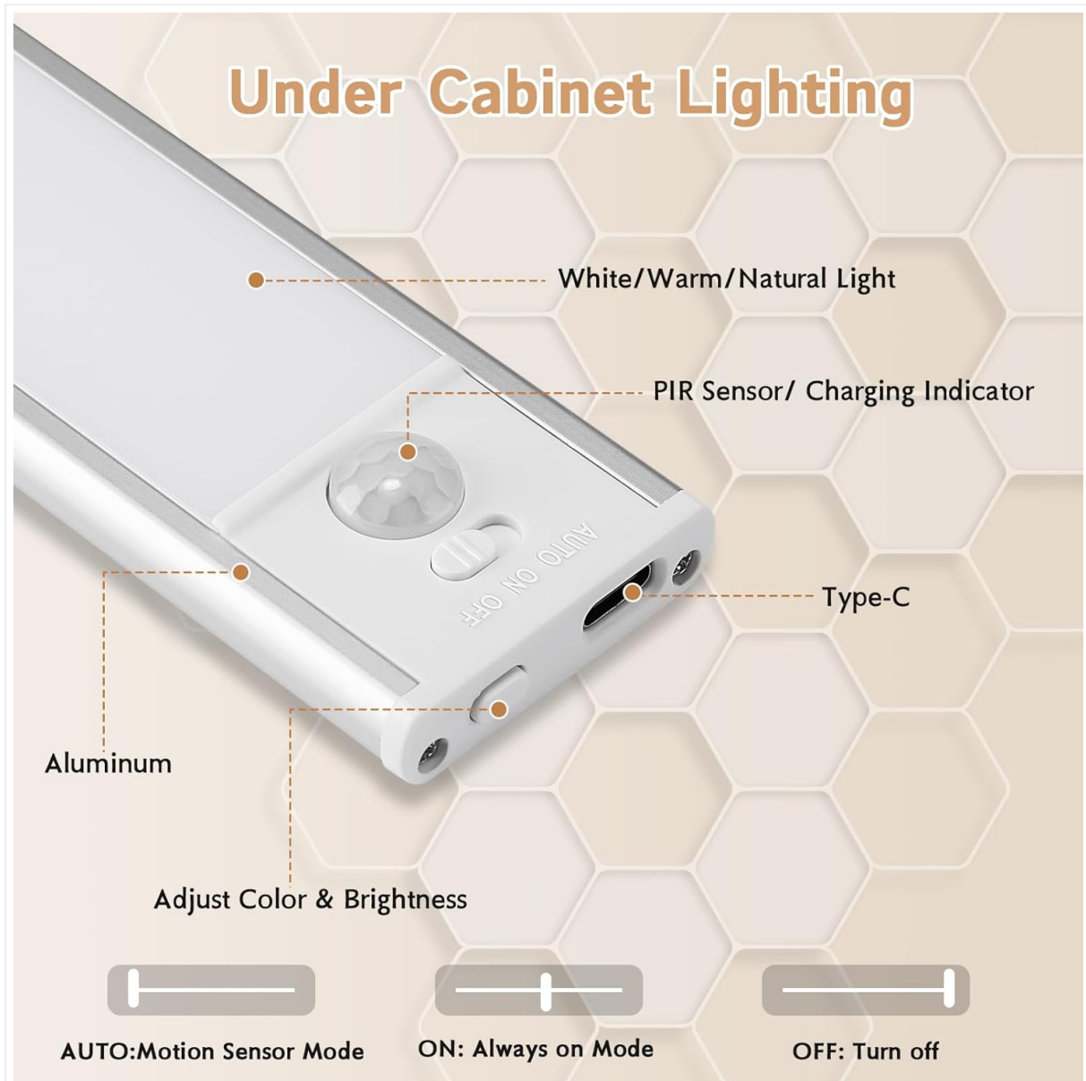
Figure 3: Light controls and features.

Cycle through these modes by pressing the touch control button on the light.