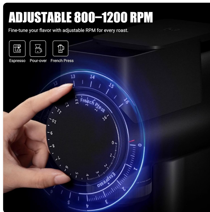
Image: Adjustable grind size dial on the TIMEMORE Sculptor 078S. The dial allows for precise selection of grind coarseness, with markings for various brewing methods like Espresso, Pour-over, and French Press.

The Sculptor 078S features a stepless coarseness adjustment dial on the front. Rotate the dial to select your desired grind size. Lower numbers correspond to finer grinds (e.g., espresso), while higher numbers indicate coarser grinds (e.g., French Press).