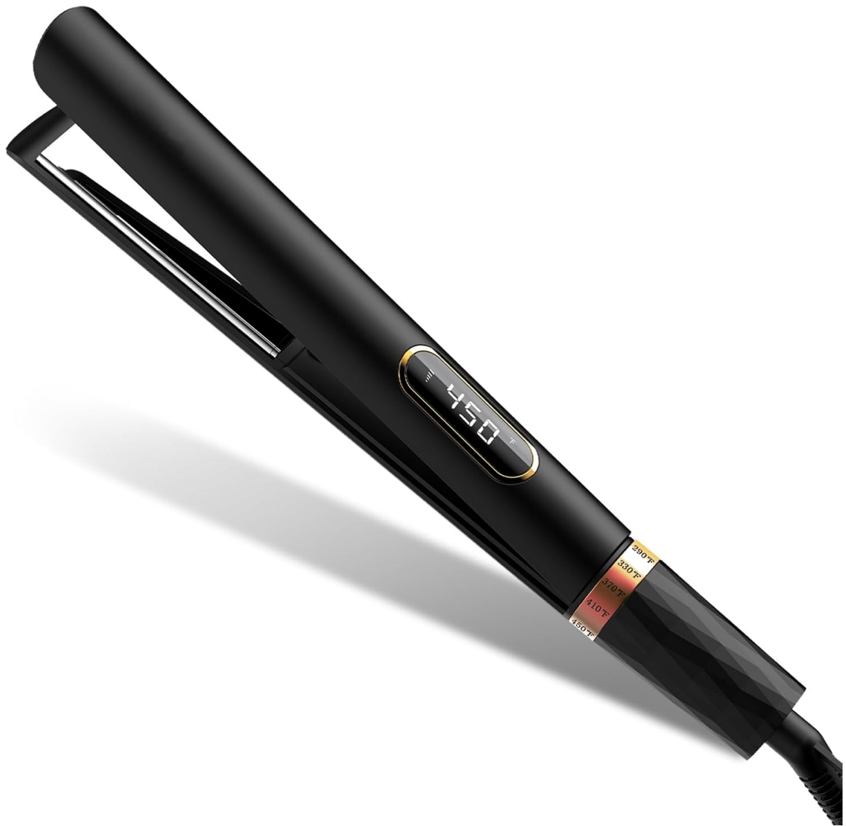
Figure 2.1: Nicebay HS070Bi 1-inch Titanium Flat Iron