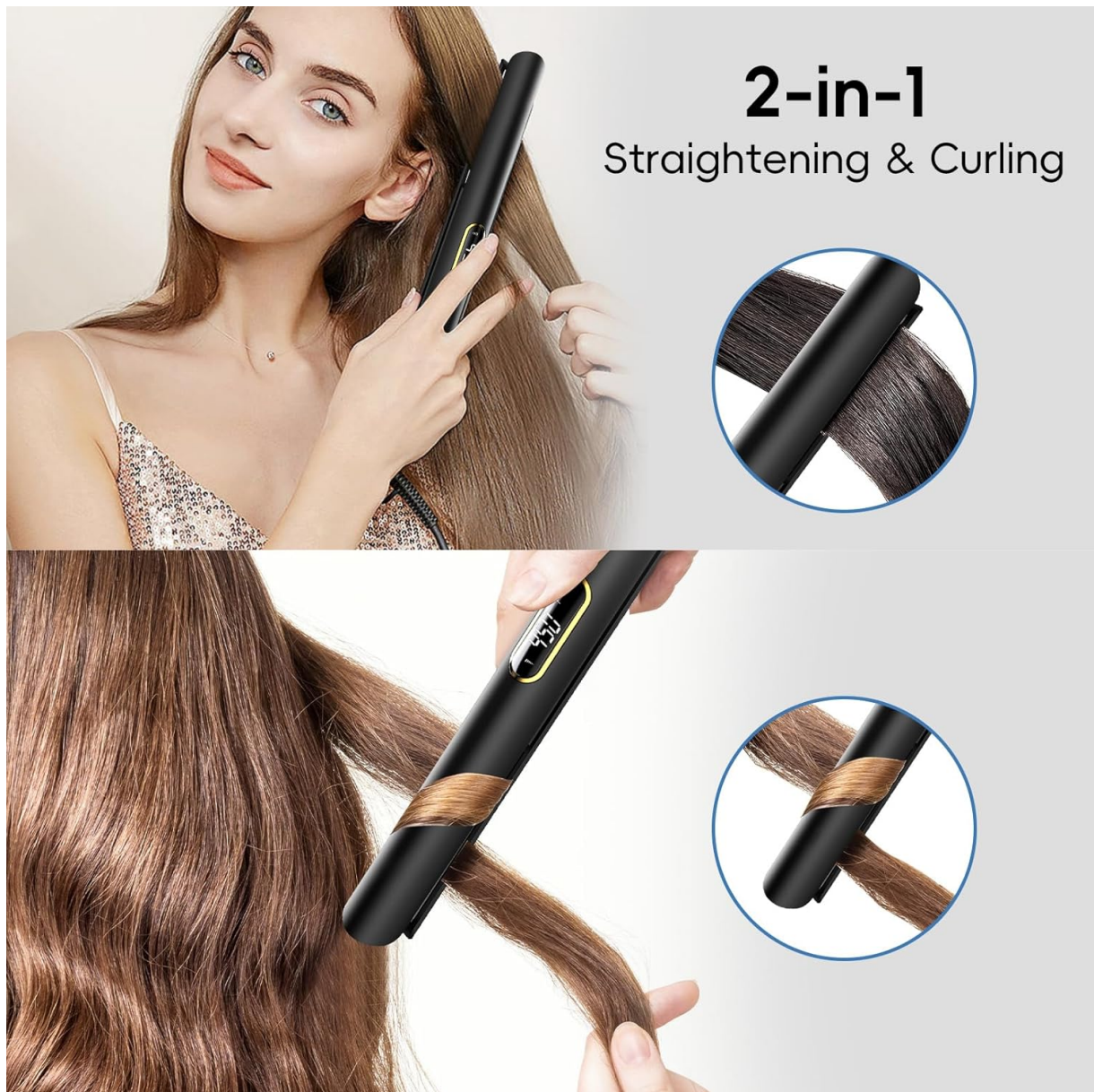
Figure 4.2: 2-in-1 Straightening and Curling Functionality