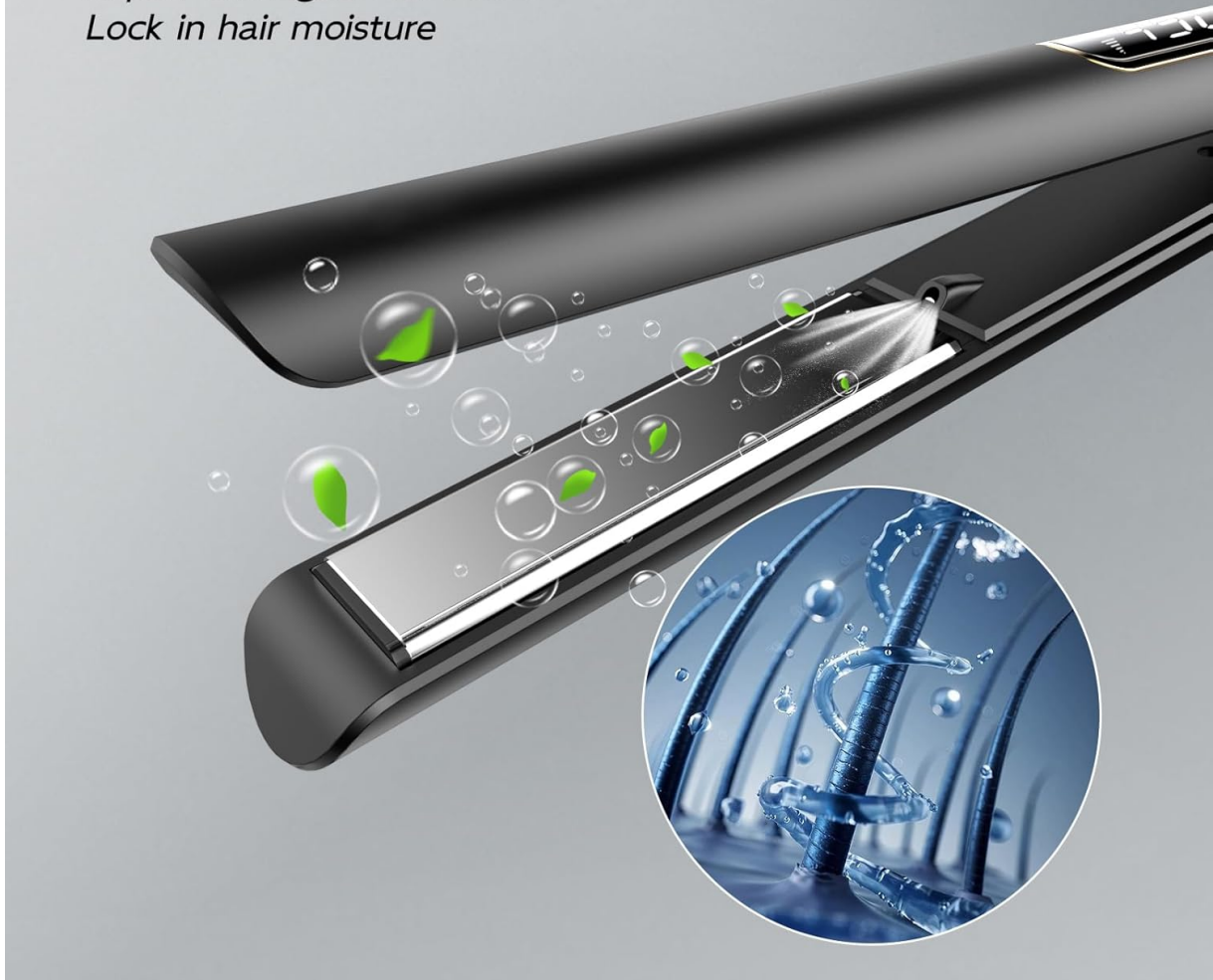
Figure 4.3: Negative Ion Technology in Action

Eliminating static electricity Repair damaged hair scales Lock in hair moisture