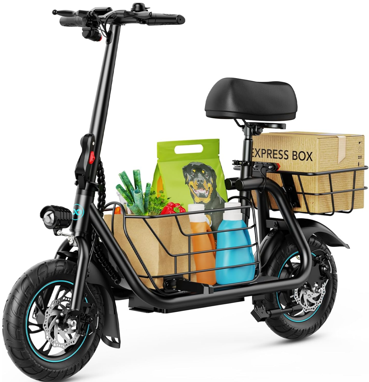
The Gyroor Electric Scooter with its large middle basket and rear cargo basket.