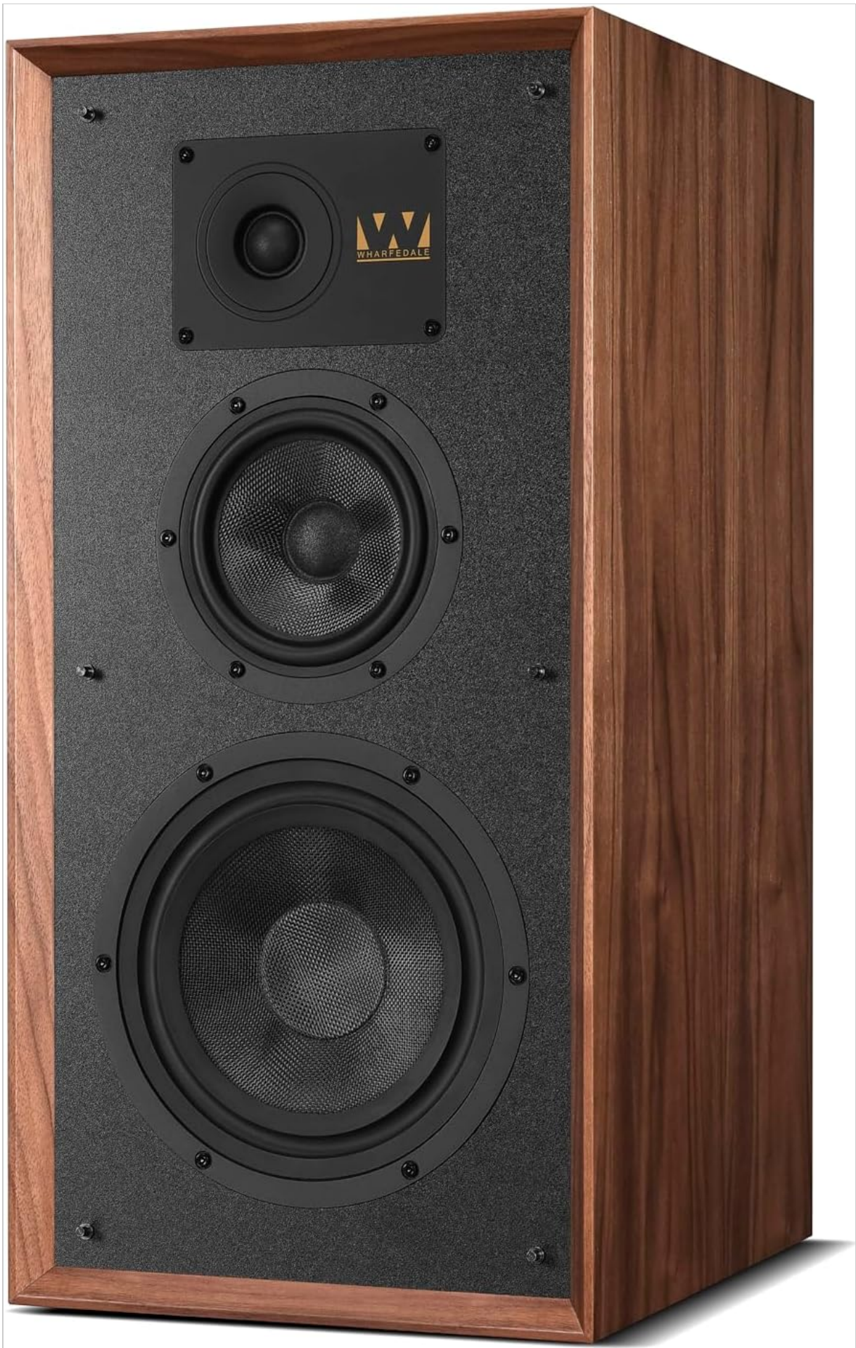
Figure 1: Angled view of the Wharfedale Super Linton speaker with the protective grille removed, revealing the tweeter, midrange, and bass drivers.