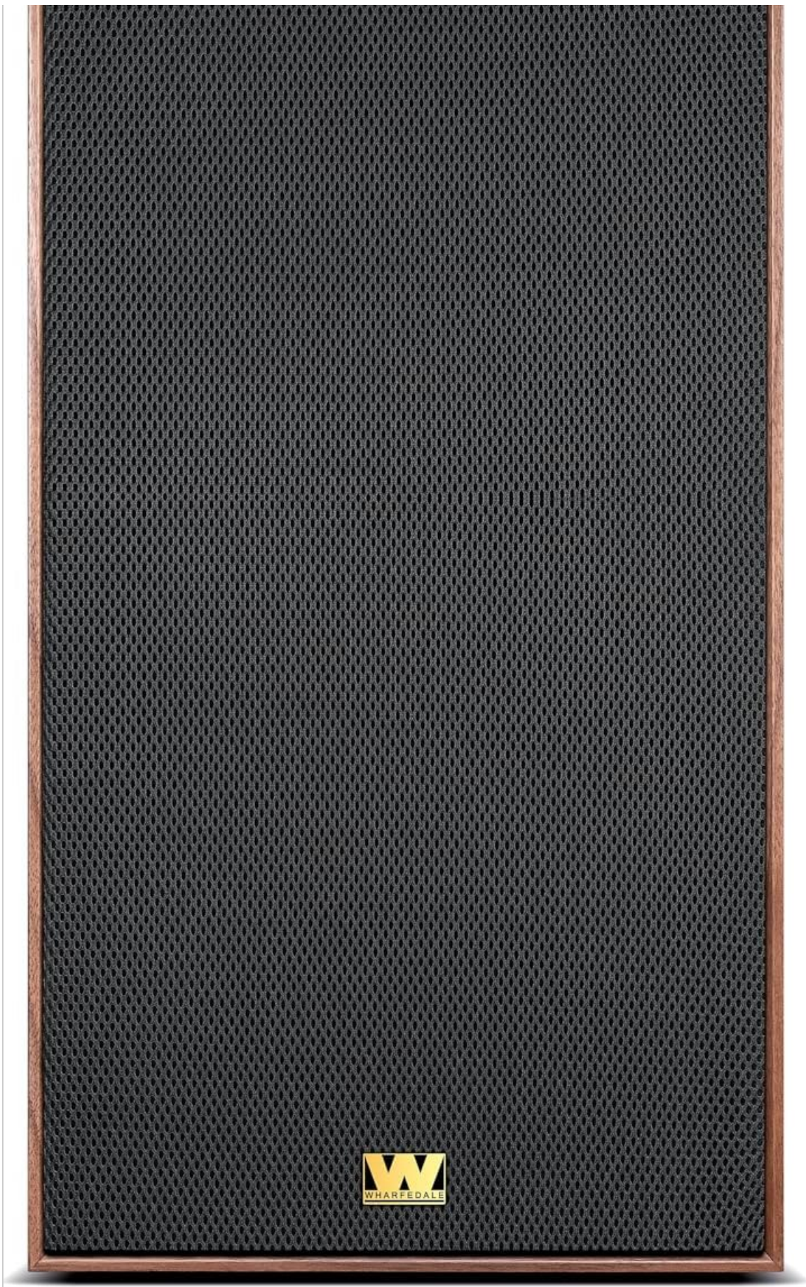
Figure 2: Front view of the Wharfedale Super Linton speaker with the protective grille attached.