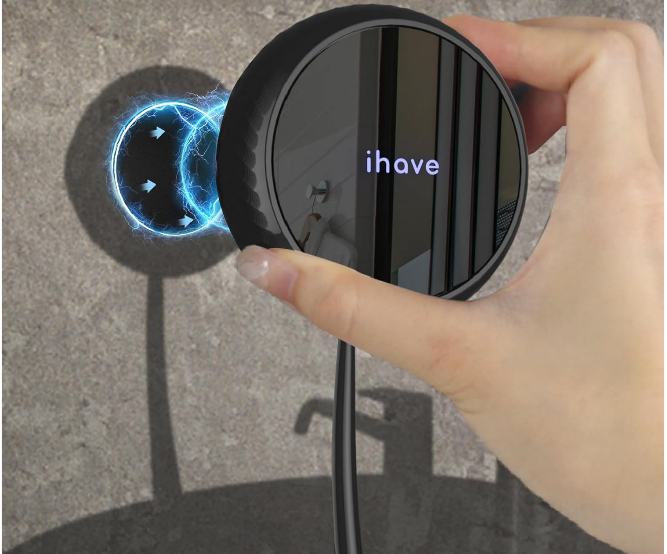
Image: A hand demonstrating the strong magnetic bracket for easy attachment and detachment.