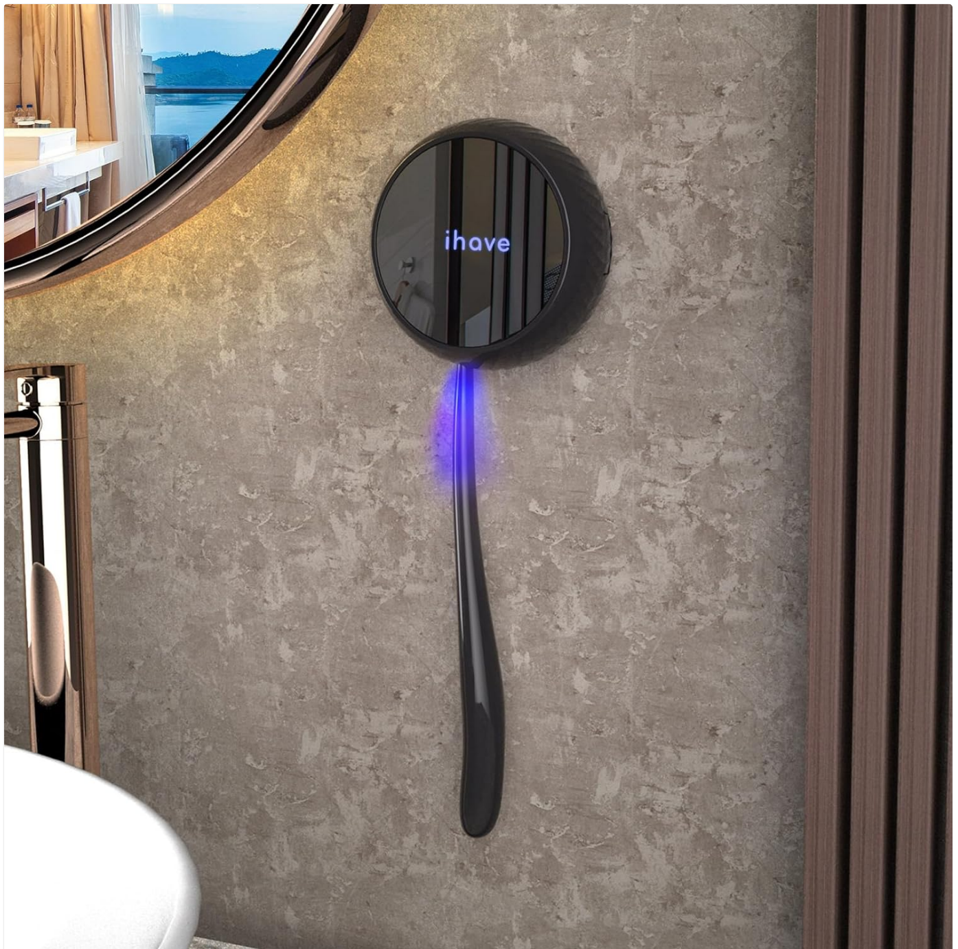
Image: The iHave Toothbrush Sanitizer in use, wall-mounted in a modern bathroom setting.