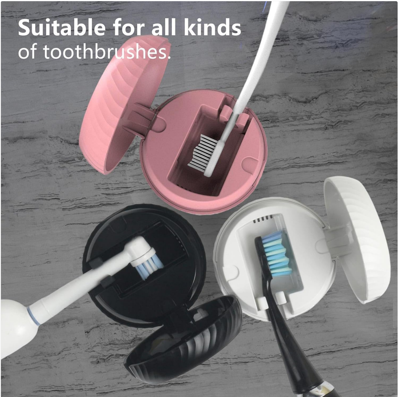
Image: The iHave Toothbrush Sanitizer demonstrating compatibility with various toothbrush types.