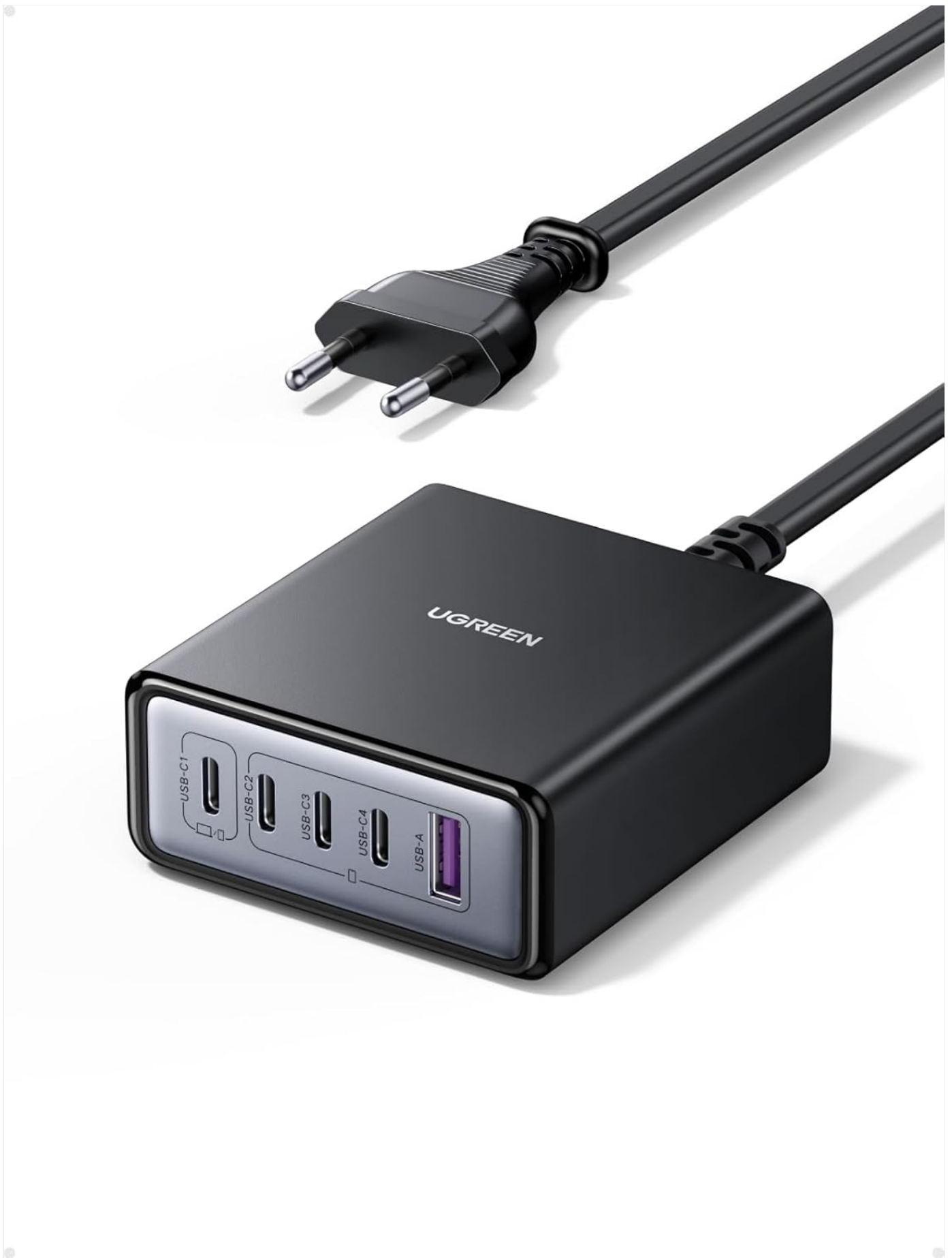
Image: The UGREEN Zapix 65W charger connected to its power cable with a European plug.