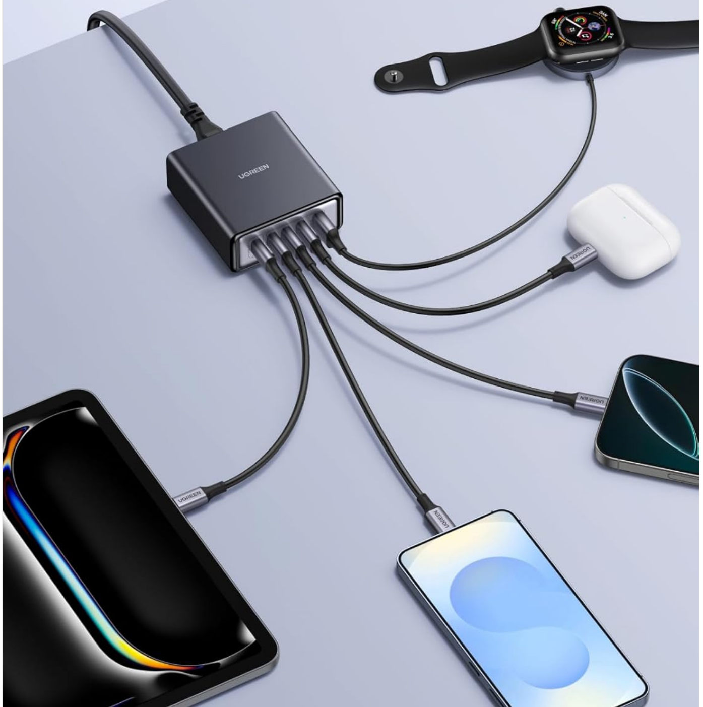
Image: The UGREEN Zapix 65W charger connected to and simultaneously charging a laptop, smartphone, smartwatch, and wireless earbuds.