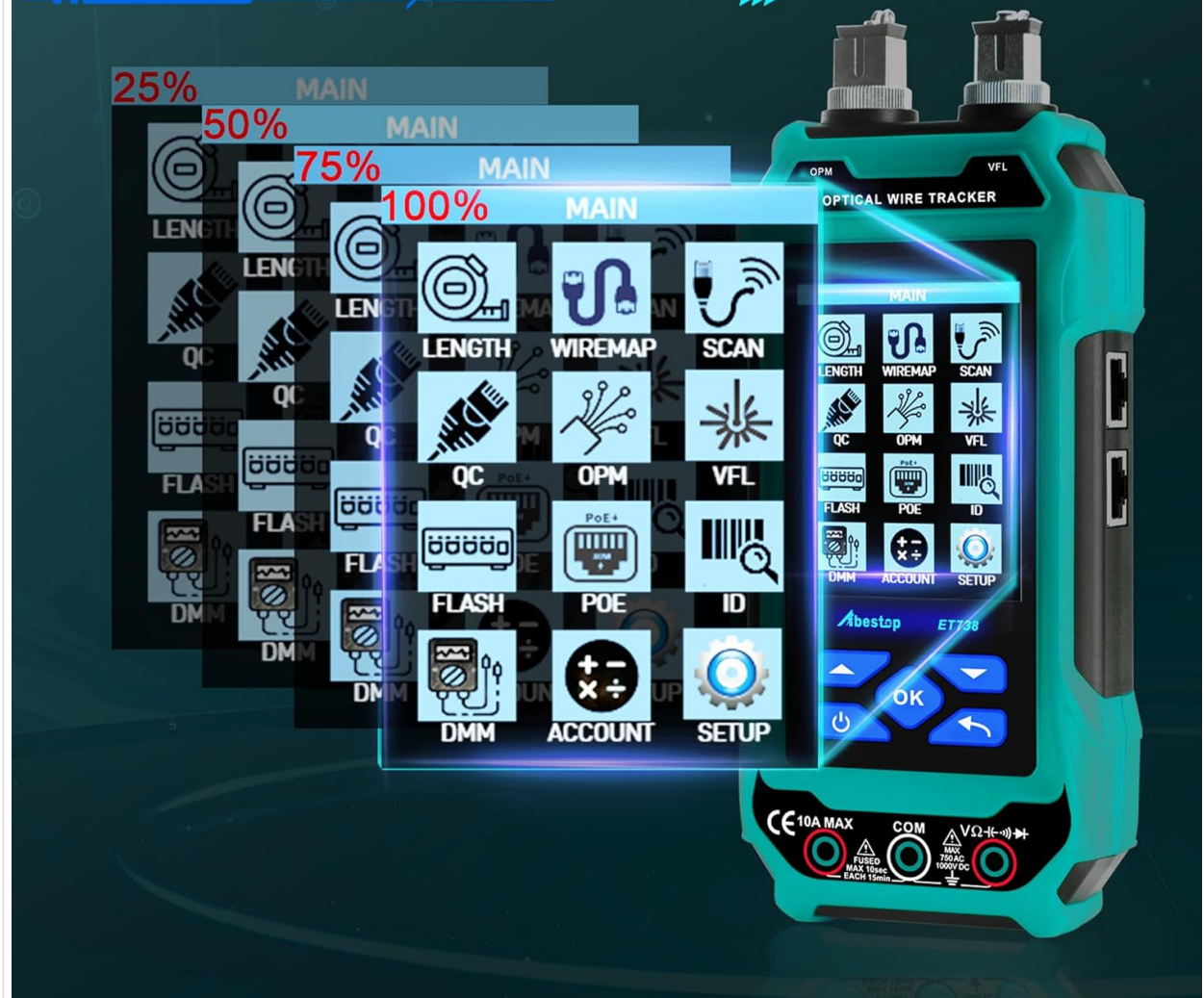
Figure 5: Overview of available functions, including DMM, PoE Test, and Remote ID.