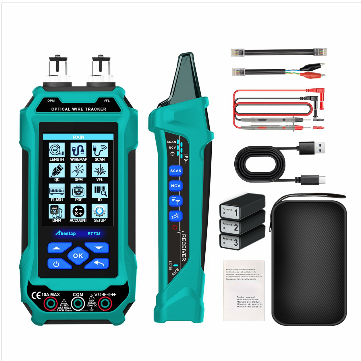
Figure 1: Abestop ET738 Main Unit and Receiver