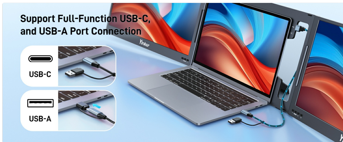
Image: Connection methods using full-function USB-C or USB-A with power.

The Yinker Z80A can be connected to your laptop using a single USB-C cable for both power and video signal, provided your laptop's USB-C port supports full functionality (video output and power delivery). If your laptop does not support full-function USB-C or requires additional power, use the provided power cable and adapter.