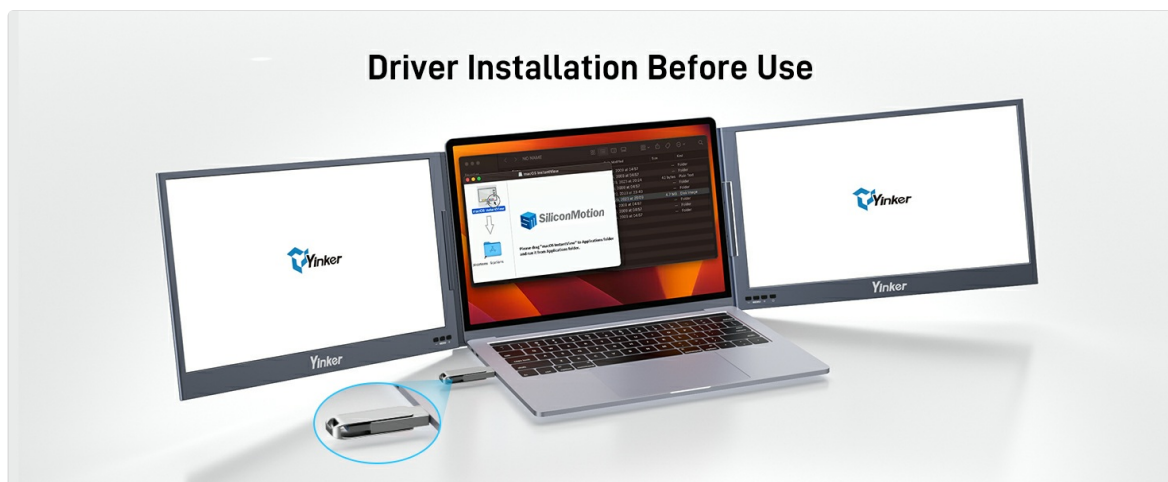
Image: Driver installation process for the screen extender.

Driver installation is required for first-time use. Please use the provided USB driver or download the necessary software from the official Yinker website. Follow the on-screen instructions for installation.