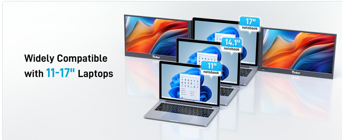
Image: Wide compatibility with 11-17 inch laptops.

The device is compatible with Windows, MacOS (including M1, M2, M3 MacBooks), and Android systems. It supports laptops ranging from 11 to 17 inches.