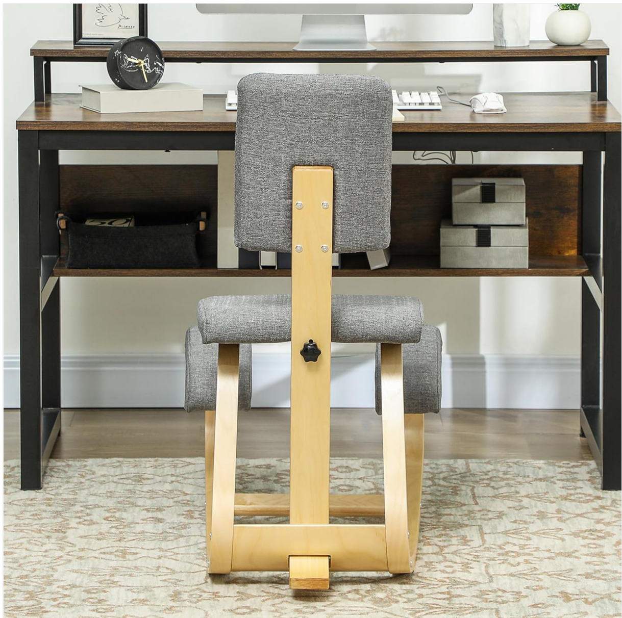
Rear view of the chair, highlighting the backrest and potential adjustment mechanism.