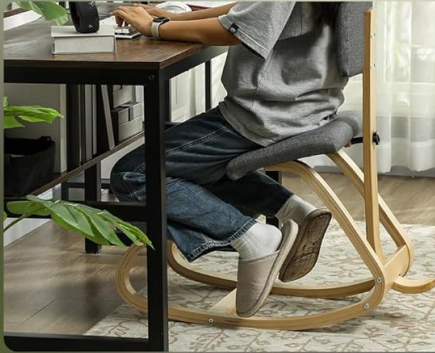
Chaise de dactylographie