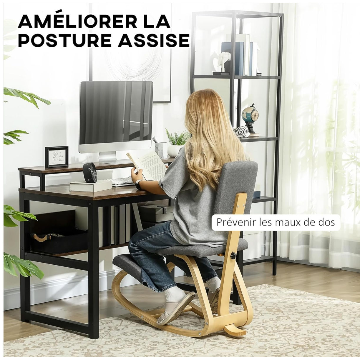
Demonstration of correct sitting posture on the ergonomic kneeling chair.