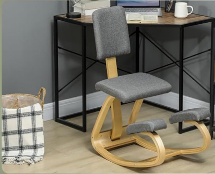
Chaise de méditation