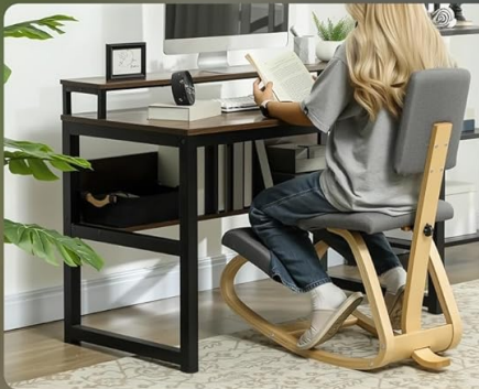
Chaise de bureau à domicile

The versatile use of the kneeling chair for various activities such as meditation, typing, and home office work.