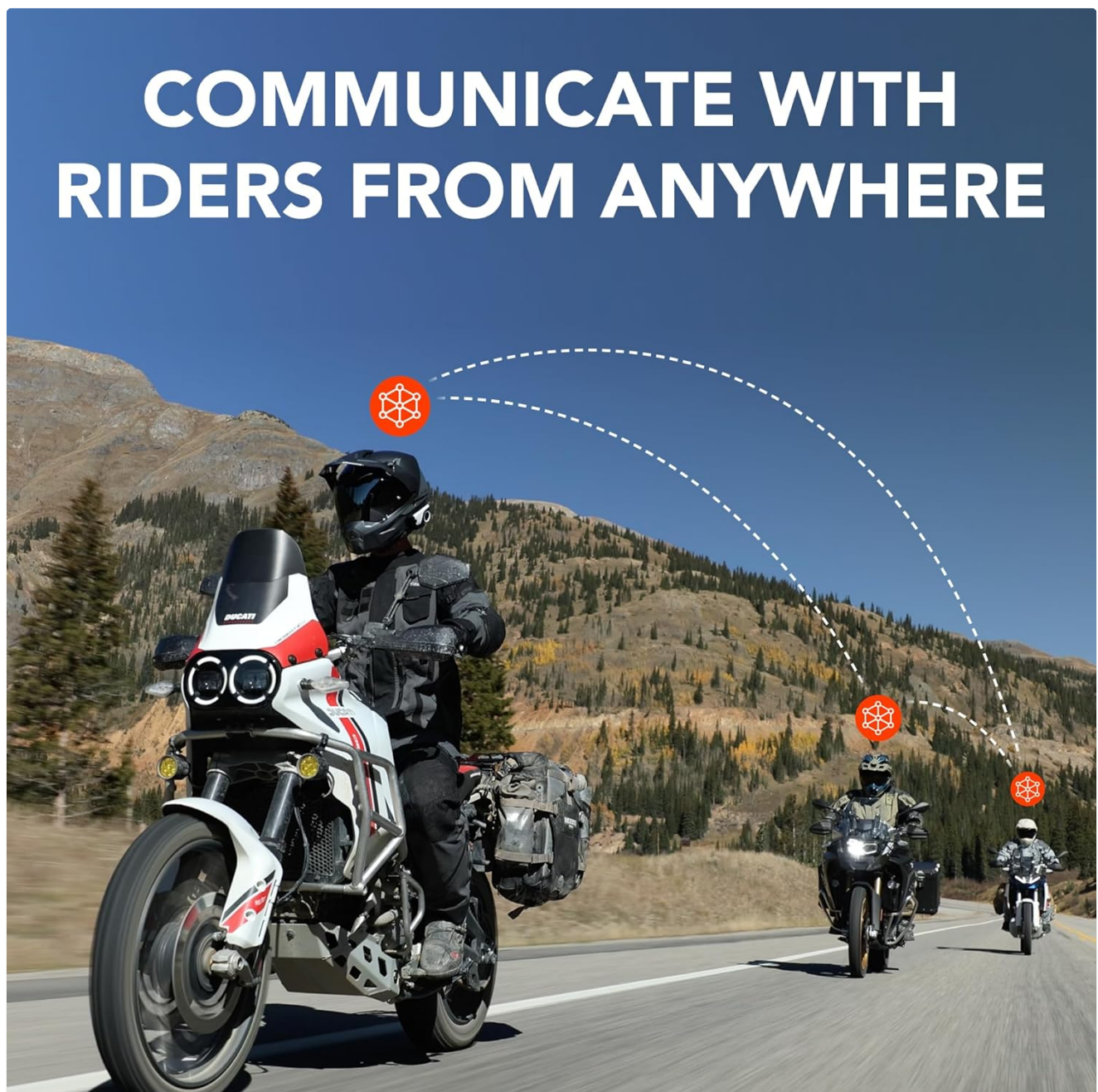
Figure 5: Riders communicating seamlessly using the Sena 60S, demonstrating its wide communication capabilities.