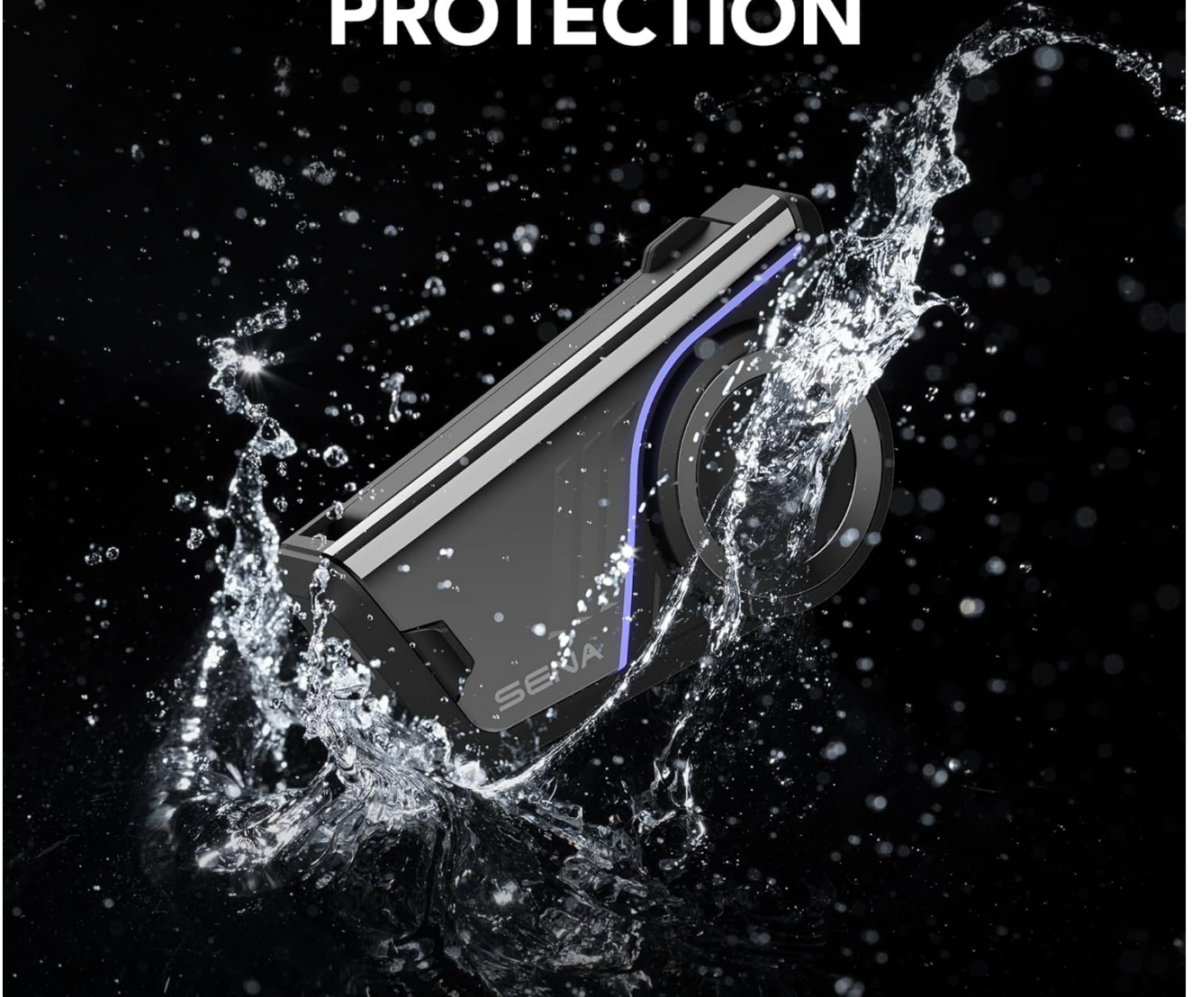
Figure 6: The Sena 60S unit demonstrating its IPX7 waterproof protection.