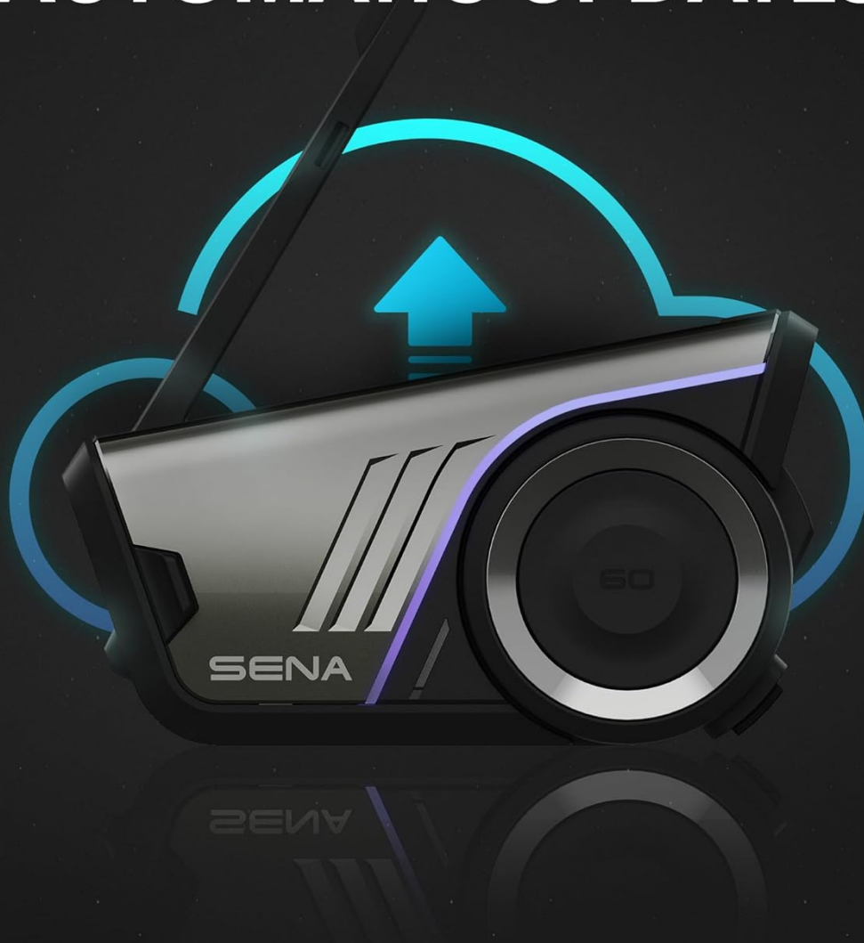
Figure 7: The Sena 60S unit illustrating its Over-The-Air automatic update capability.