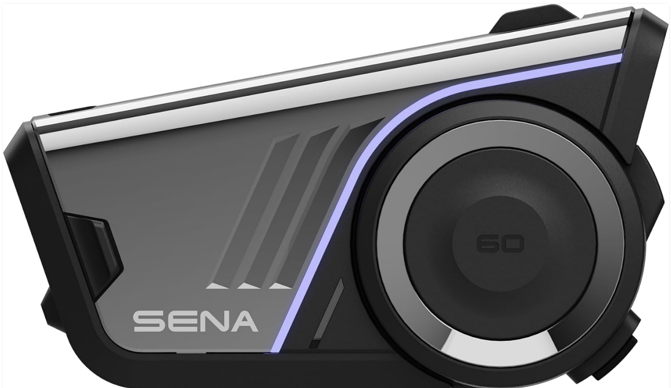
Figure 1: Sena 60S Motorcycle Communication Headset main unit.

The Sena 60S is a cutting-edge motorcycle helmet communication system designed for riders who crave seamless connectivity and high-performance features. Equipped with Mesh 3.0 Intercom technology, the 60S allows users to effortlessly connect with a virtually unlimited number of riders, providing a clear and stable communication experience even in large groups. With its 2nd generation of Harman Kardon speakers, the 60S ensures crisp audio quality for music, GPS navigation, and phone calls. Whether you're exploring the open road solo or riding with friends, the Sena 60S elevates your journey with unparalleled connectivity and convenience. Each 60S unit comes with 4 interchangeable faceplates in distinct colors (Smoked Chrome, Alpine White, Piano Black, Silver Stone) that add a touch of individuality to match any style.