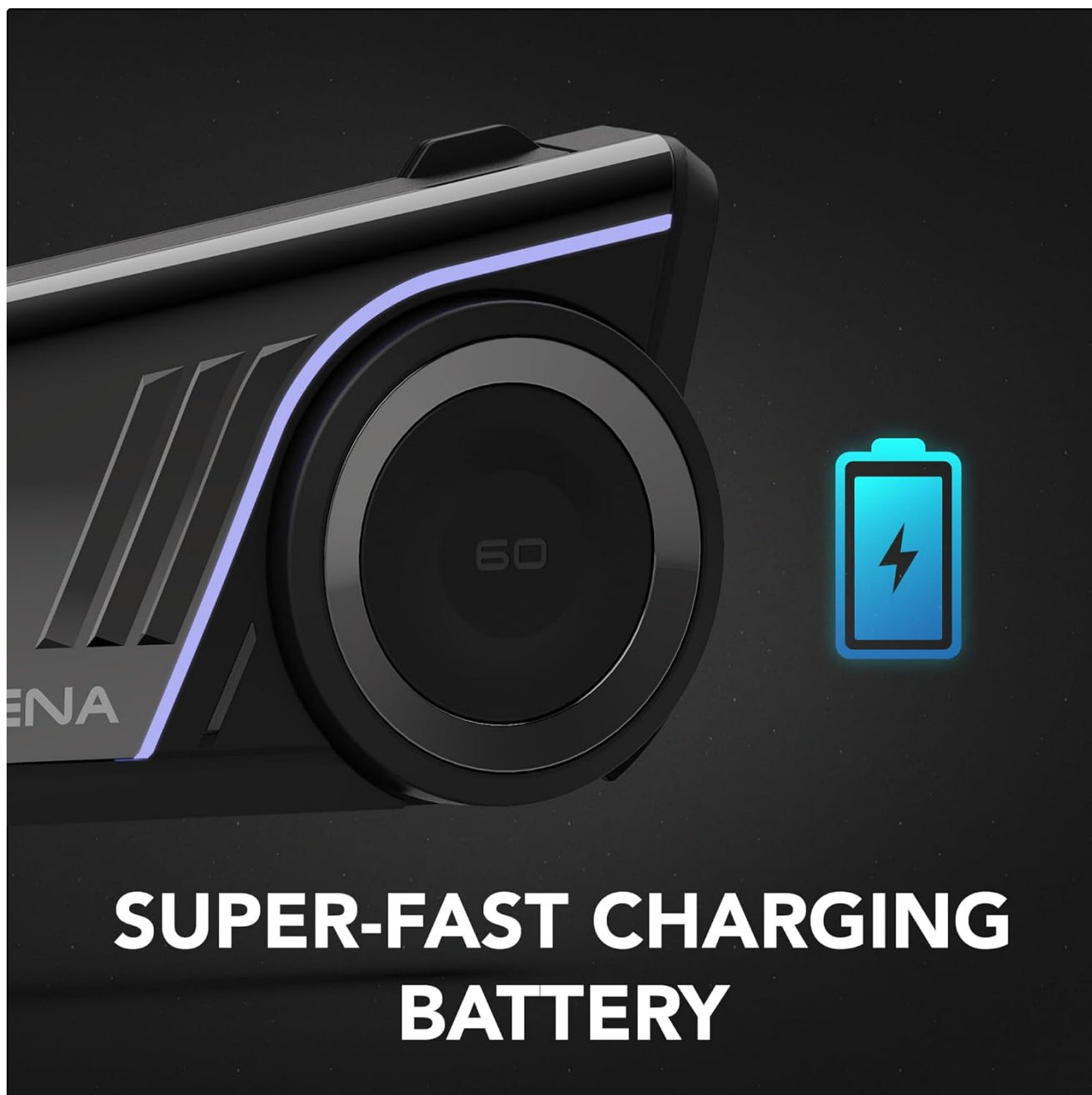
Figure 3: The Sena 60S unit highlighting its super-fast charging capability.