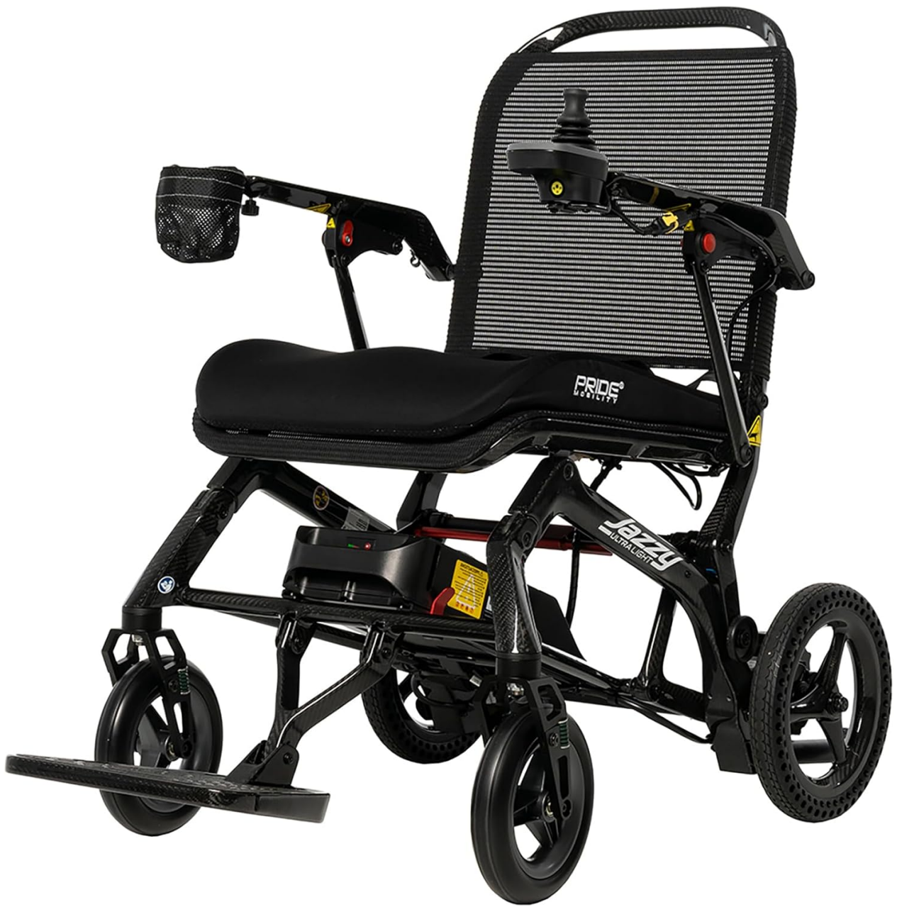
Figure 1: Front view of the Jazzy Ultra Light Power Wheelchair.