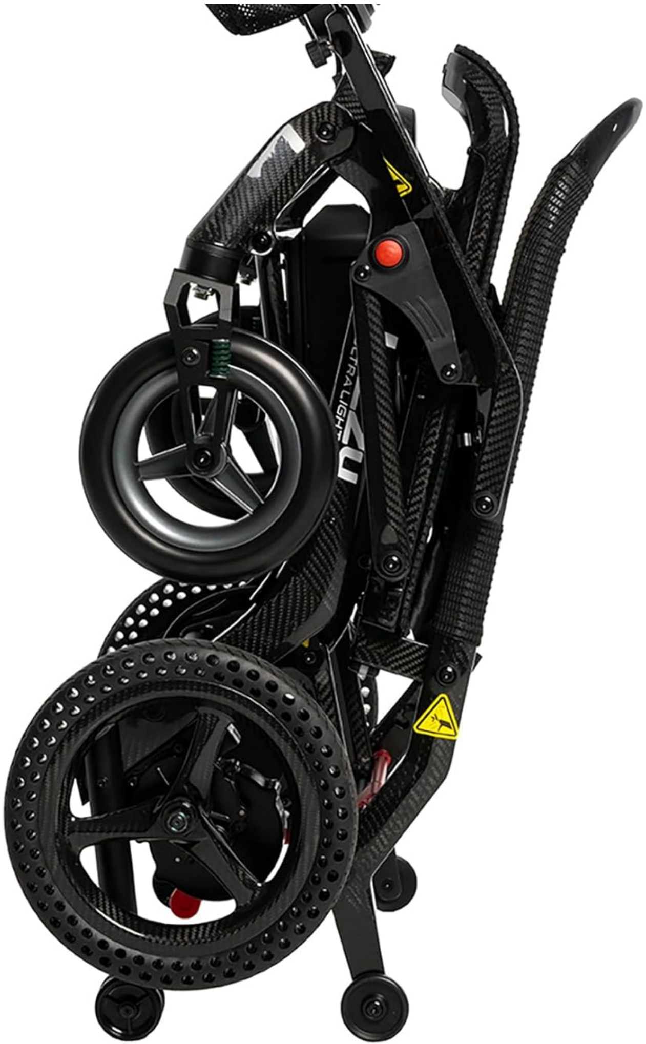
Figure 2: The Jazzy Ultra Light Power Wheelchair in its folded state.