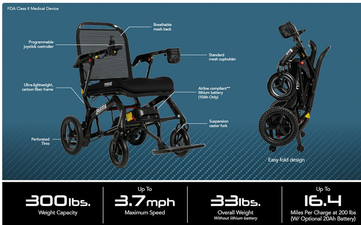
Figure 4: Infographic summarizing key features and specifications.