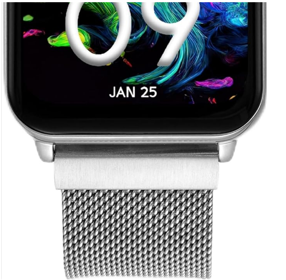
The Armitron Connect Matrix Smartwatch, featuring a vibrant display and sleek silver design.