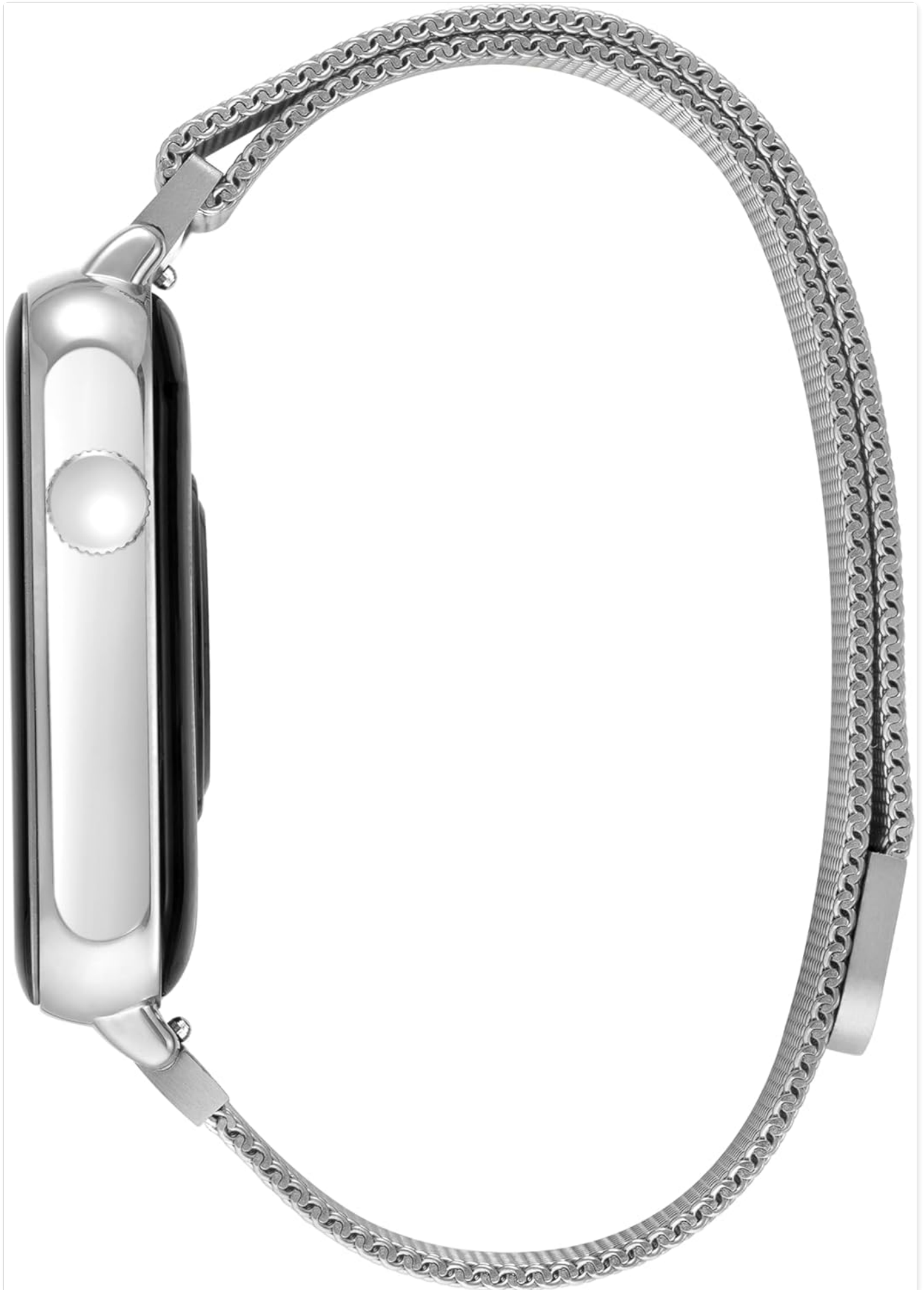
Side view of the Armitron Connect Matrix Smartwatch, highlighting the functional side dial.