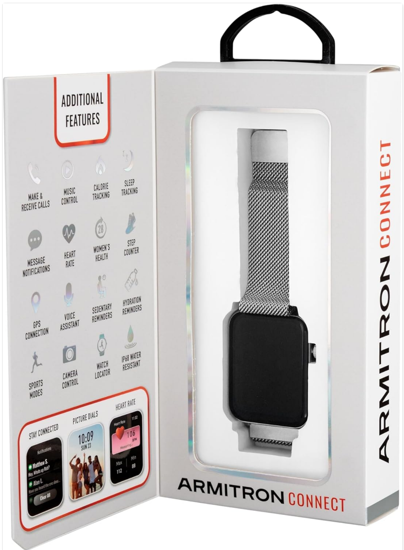
The Armitron Connect Matrix Smartwatch and its contents as seen when the packaging is opened.