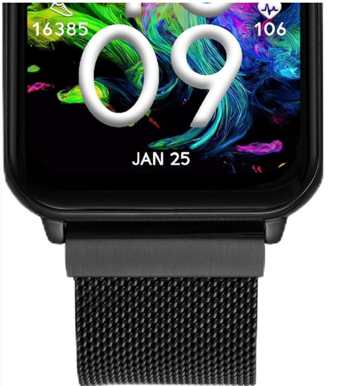
Figure 2.1: Front view of the Armitron Connect Matrix Smartwatch, showcasing its AMOLED high-definition touchscreen display and black mesh band.