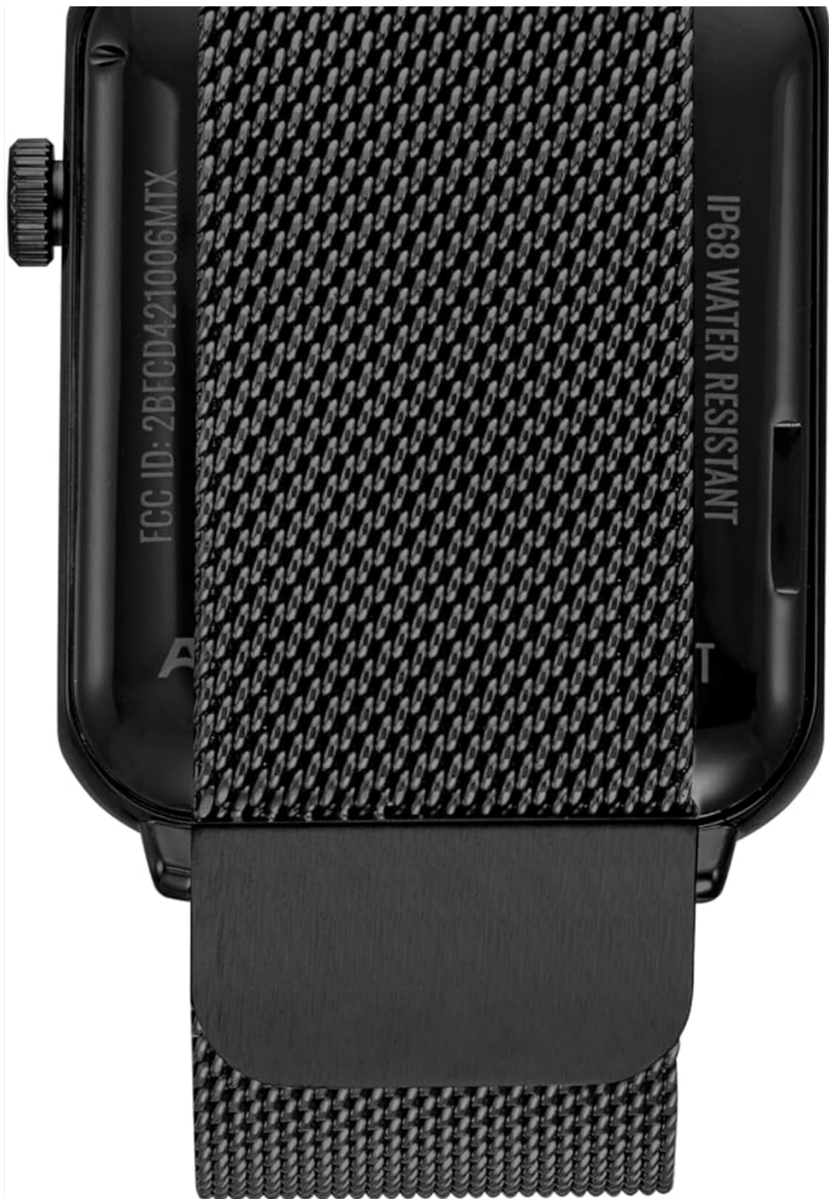
Figure 2.2: Back view of the smartwatch, highlighting the health sensors and the IP68 water resistance rating.