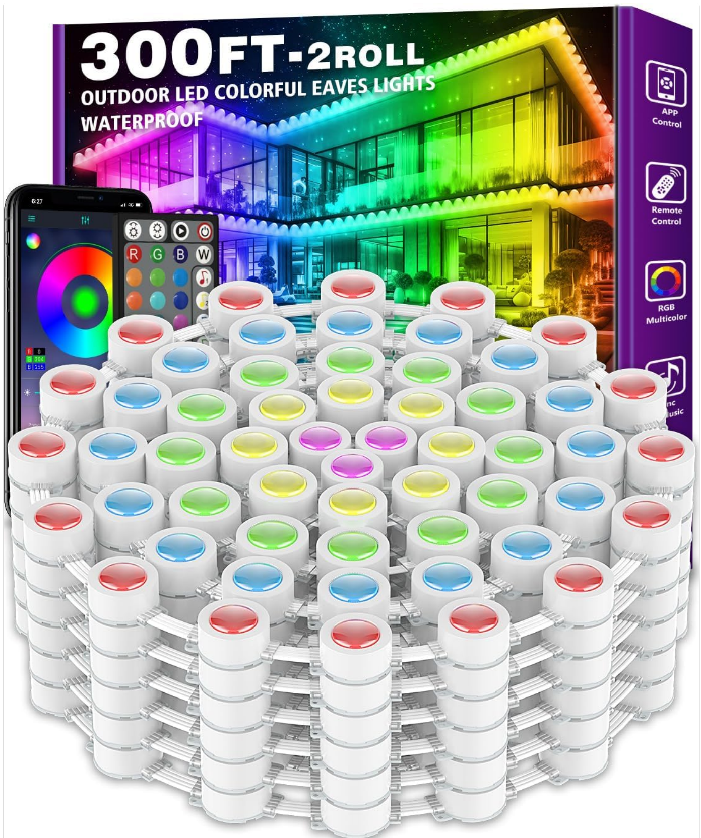
Image Description: This image displays the FBZ 300FT Permanent Outdoor RGB Lights, coiled and ready for installation, alongside a smartphone screen illustrating the smart app control interface.