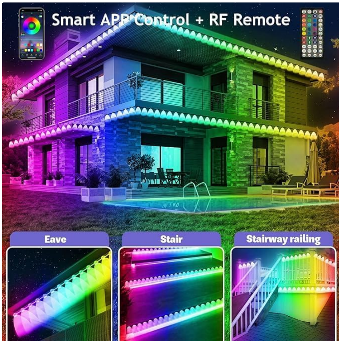
Image Description: This image illustrates the two primary control methods for the FBZ lights: a smartphone displaying the 'Lotus Lantern' app interface for detailed customization, and an RF remote control for quick adjustments.