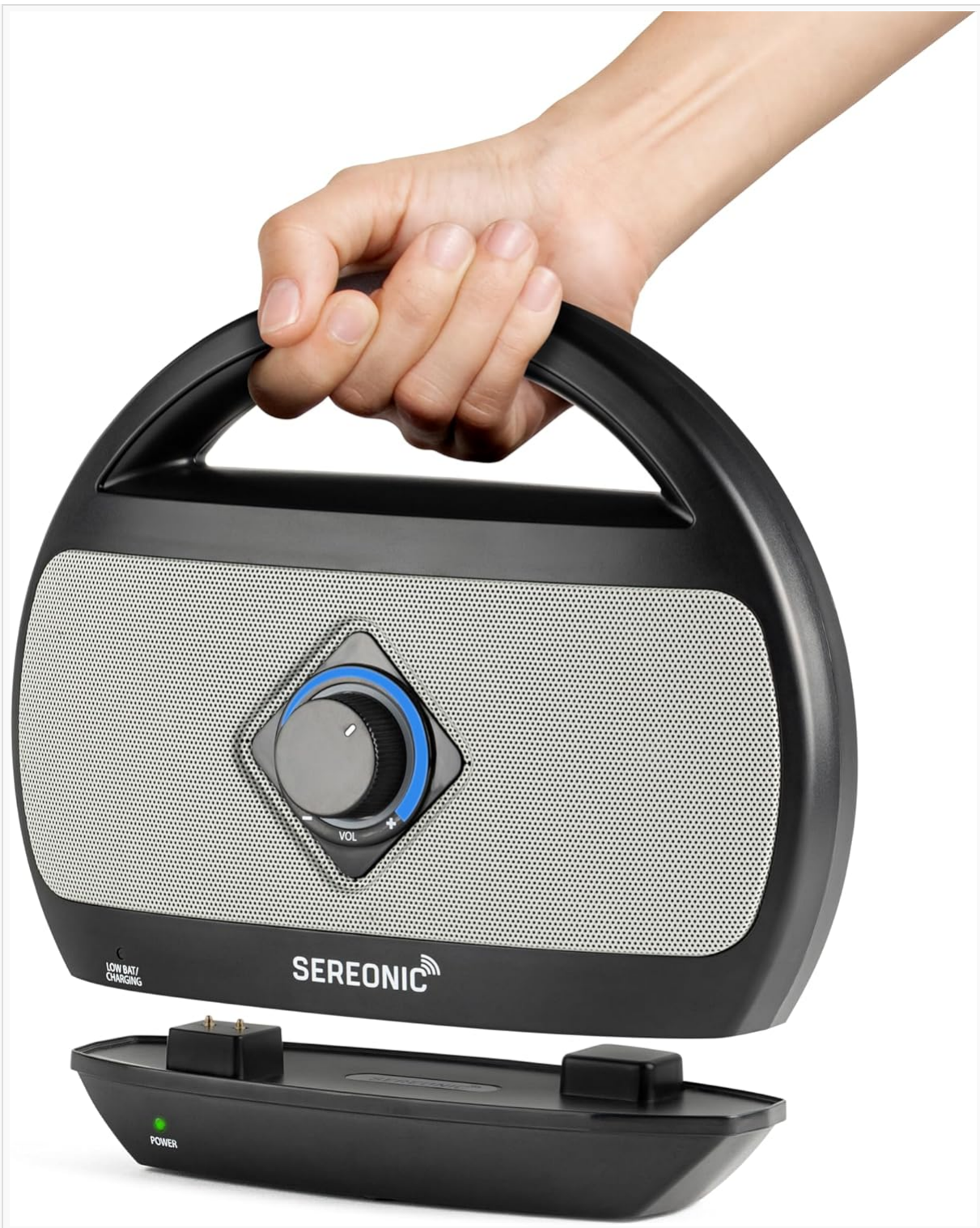
Image: The SEREONIC wireless speaker being lifted from its charging base.