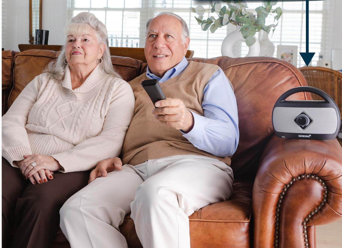
Image: The SEREONIC speaker providing enhanced audio for a couple watching television.