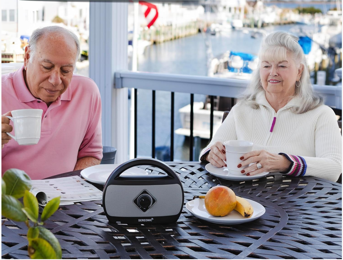
Image: The SEREONIC speaker being used outdoors, demonstrating its extended range.

Enjoy pristine audio up to 100 feet away with zero audio lag