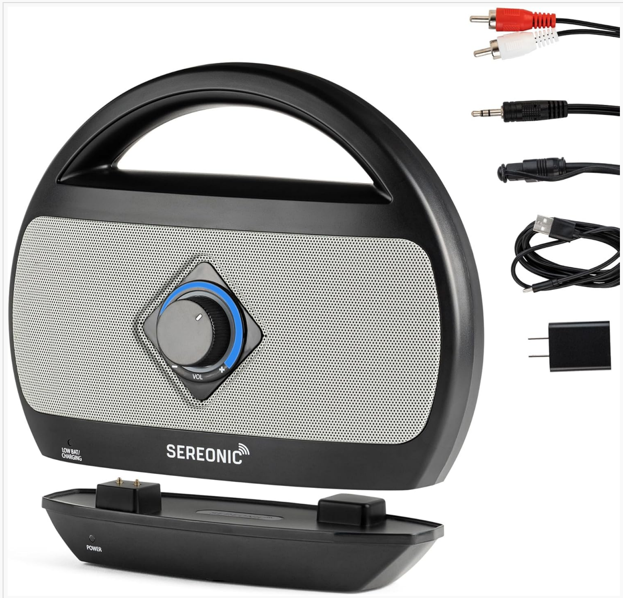
Image: The SEREONIC speaker, its charging base, and the included audio cables for TV connection.

The system is designed for plug-and-play operation, typically requiring no changes to your TV's audio settings. For HDMI connections, an external HDMI converter (sold separately) is required.