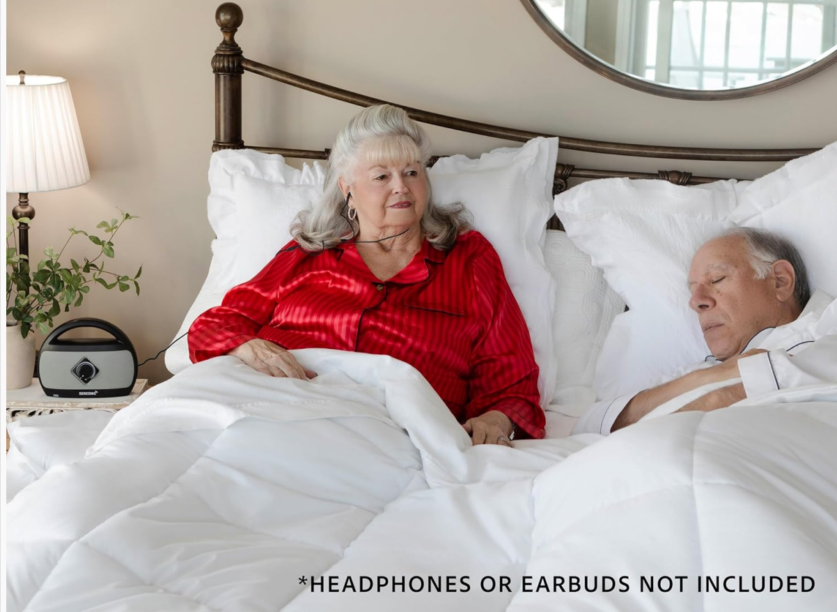
Image: Private listening with the SEREONIC speaker using headphones.

ENJOY WATCHING TV WITHOUT DISTURBING OTHERS THROUGH YOUR CHOICE OF WIRED HEAD- PHONES* OR EARBUDS*