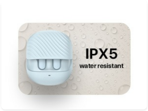
Image: The Noise Buds X2 charging case with water droplets, highlighting its IPX5 water-resistant rating.