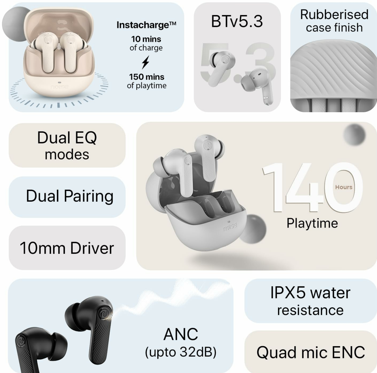
Image: An infographic detailing the main features of the Noise Buds X2 earbuds.