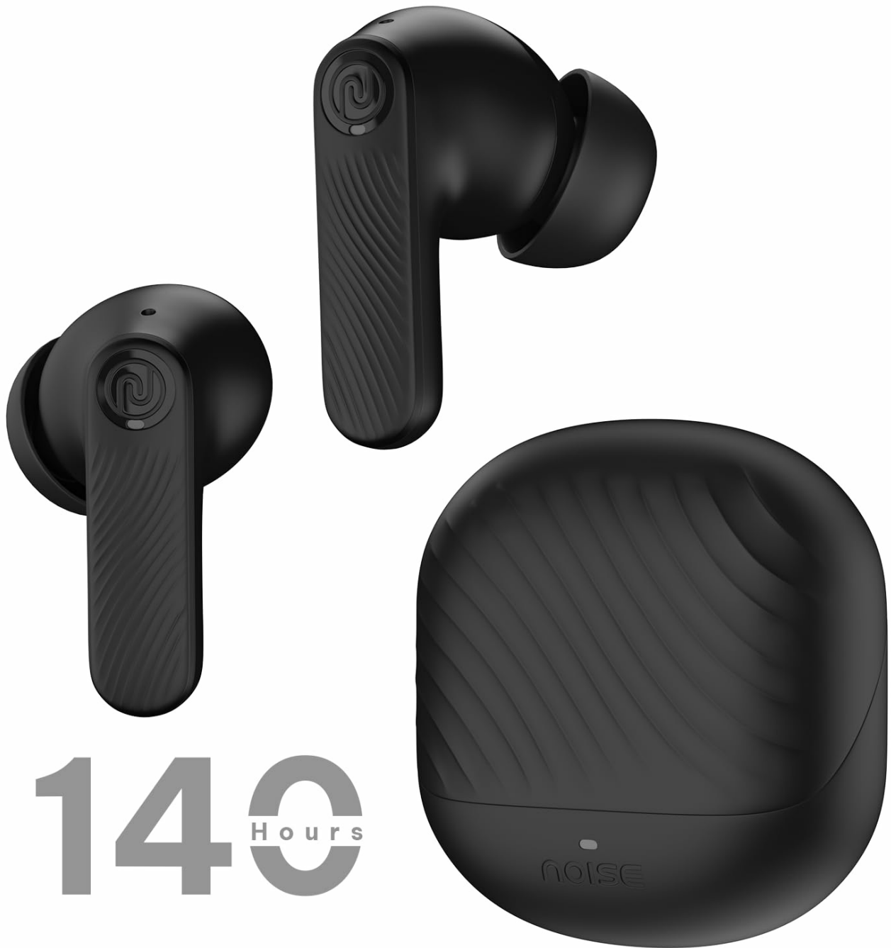
Image: Noise Buds X2 earbuds and charging case, highlighting the 140-hour playtime capability.