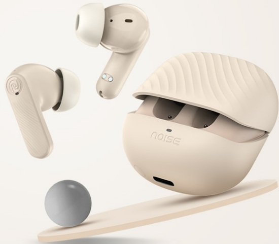
Image: Noise Buds X2 earbuds and case, highlighting the Dual EQ modes for customized sound profiles.