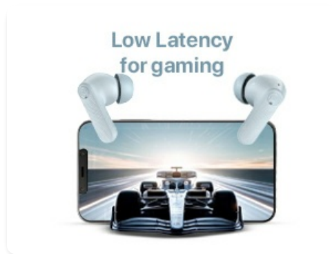
Image: Noise Buds X2 earbuds paired with a phone displaying a racing game, demonstrating the low latency mode for gaming.

Activate Low Latency Mode for an optimized gaming experience with reduced audio delay. Refer to the quick start guide for the specific touch gesture to activate this feature.