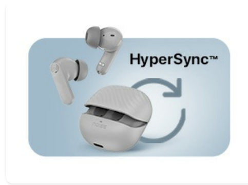
Image: Visual representation of HyperSync™ technology for seamless device connection.