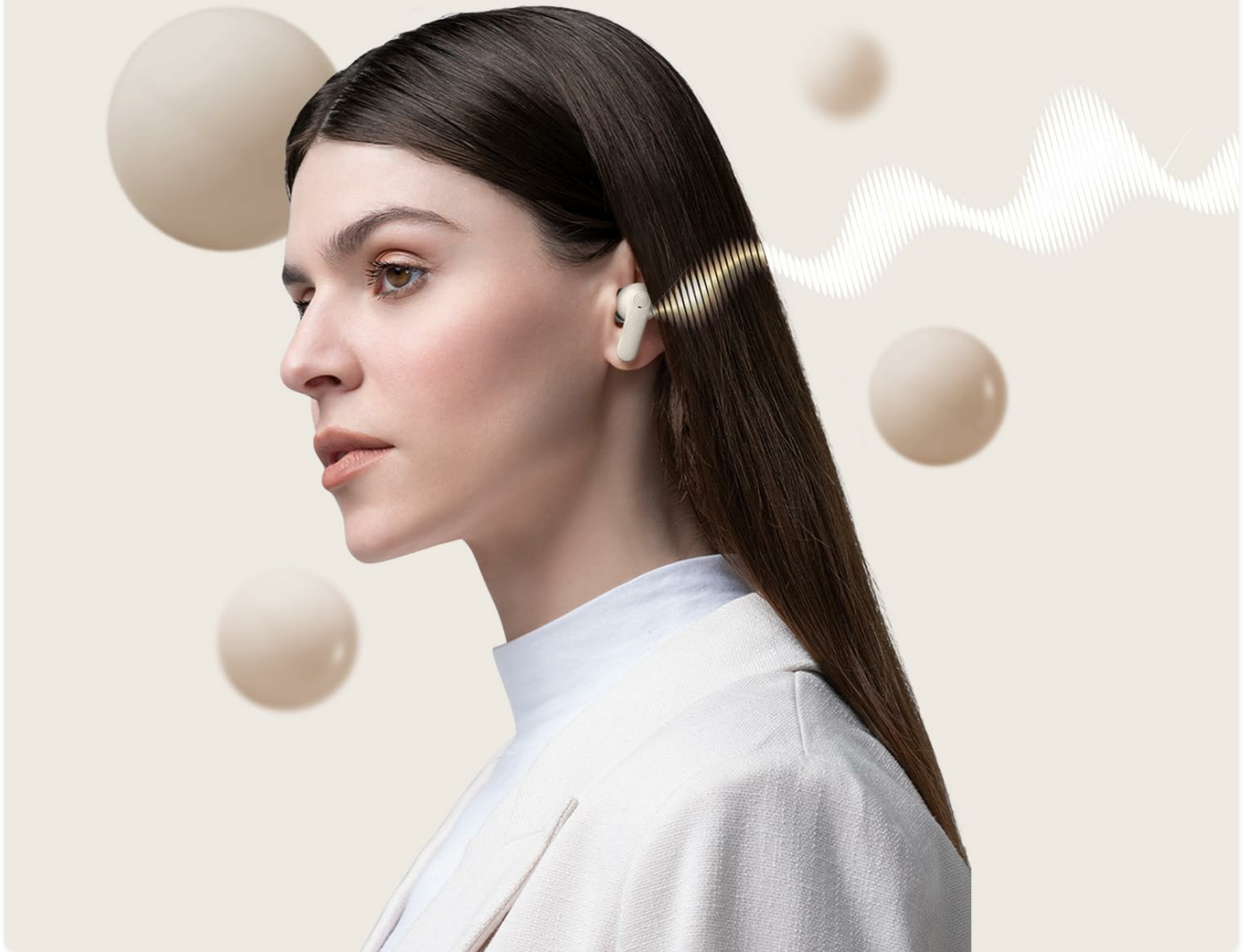
Image: A user wearing Noise Buds X2, illustrating the effectiveness of Active Noise Cancellation (ANC) up to 32dB.