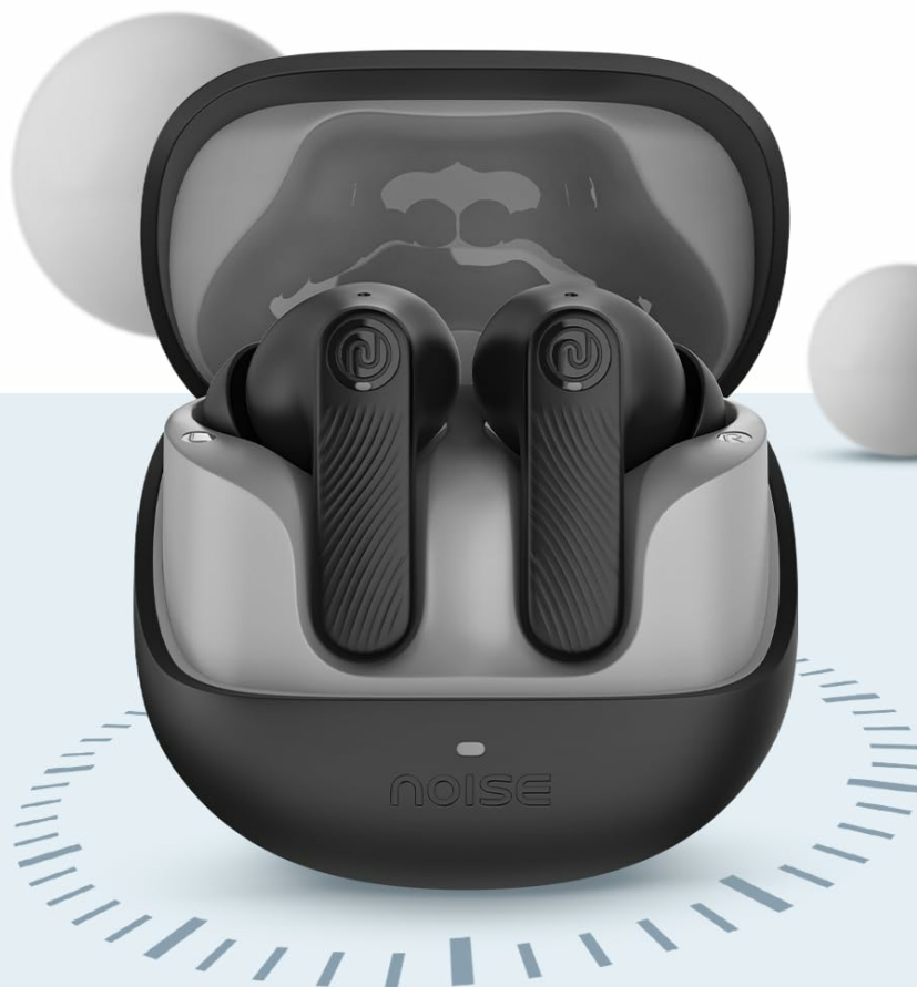
Image: The Noise Buds X2 charging case with earbuds, illustrating the Instacharge feature for quick power-ups.

10 mins of charge ⚡ 150 mins of playtime