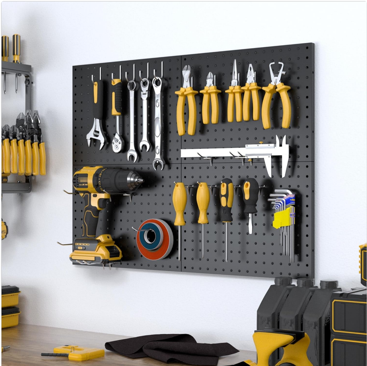
Image: Contents of the Spampur 4 Pack Metal Pegboard Panels, showing four black pegboard panels and a variety of 50 hooks.