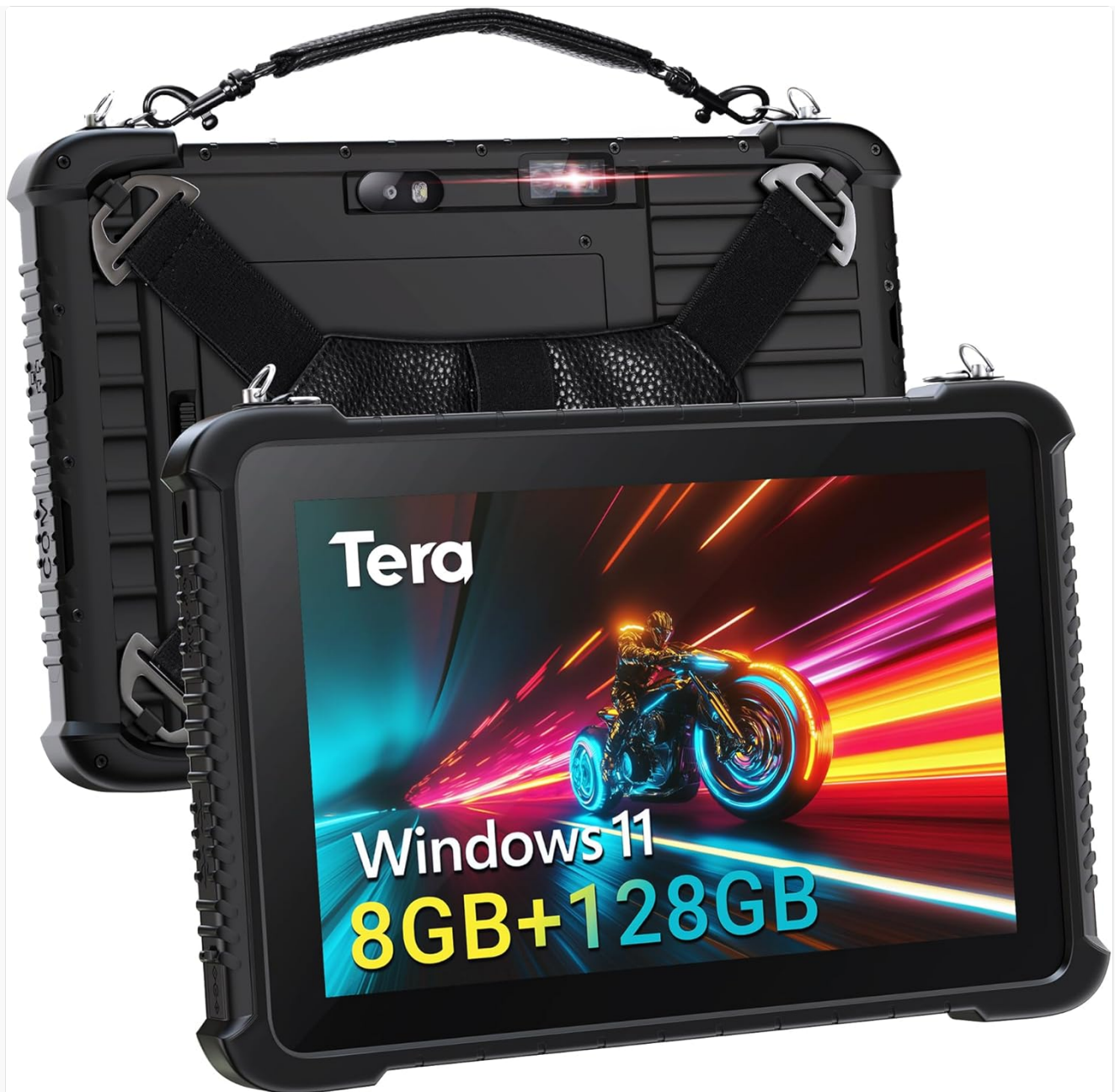
Image: The Tera T02W Rugged Tablet, showcasing its 10.1-inch display with Windows 11 and key specifications of 8GB RAM and 128GB storage.