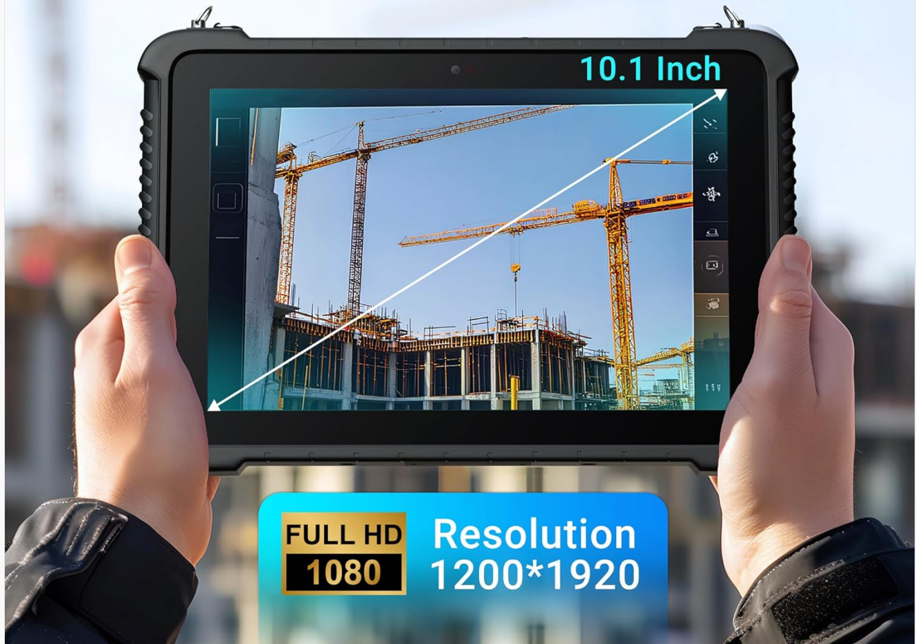
Image: The Tera T02W Rugged Tablet highlighting its large 10.1-inch screen, designed for enhanced visuals and productivity with Full HD 1200x1920 resolution.