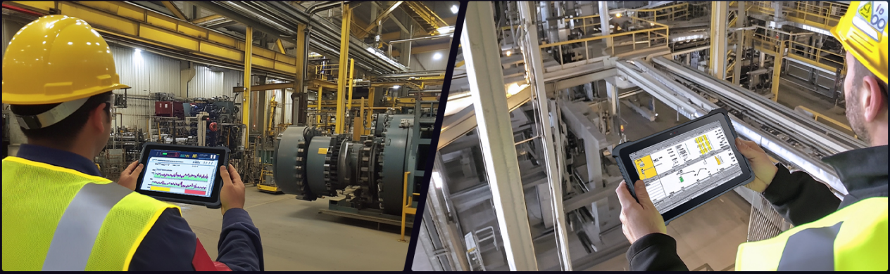
Image: Two individuals utilizing the Tera T02W Rugged Tablet in an industrial environment, highlighting its seamless connectivity with 2.4G and 5.8G Wi-Fi support.