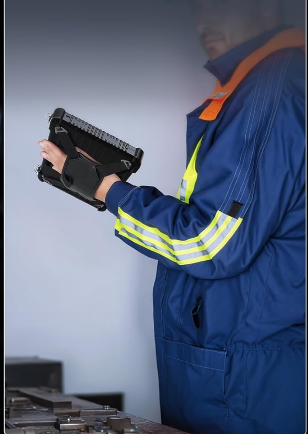
Image: The Tera T02W Rugged Tablet demonstrating its portability with an easy carry grip and a secure hold using the included straps.