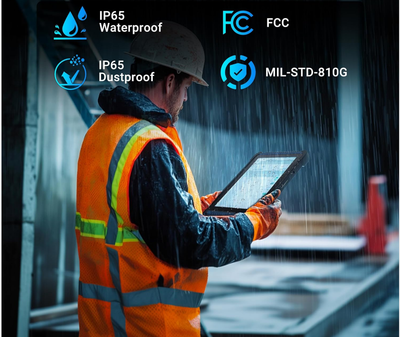
Image: A construction worker using the Tera T02W Rugged Tablet in a challenging environment, highlighting its IP65 waterproof and dustproof ratings, and MIL-STD-810G certification for durability.