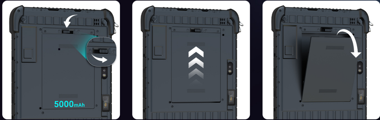
Image: A visual guide demonstrating the process of installing the removable 5000mAh battery into the Tera T02W Rugged Tablet.