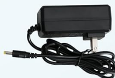
19V 3.42A Charging Cable