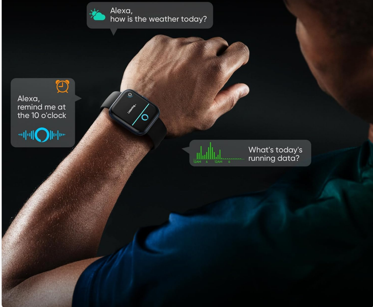
Image: A user interacting with the Fitpolo W208 Plus Smart Watch, demonstrating the Alexa voice assistant feature for queries and reminders.