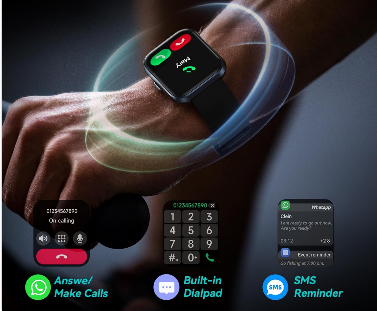
Image: The Fitpolo W208 Plus Smart Watch displaying incoming call and message notifications, along with its built-in dialpad.