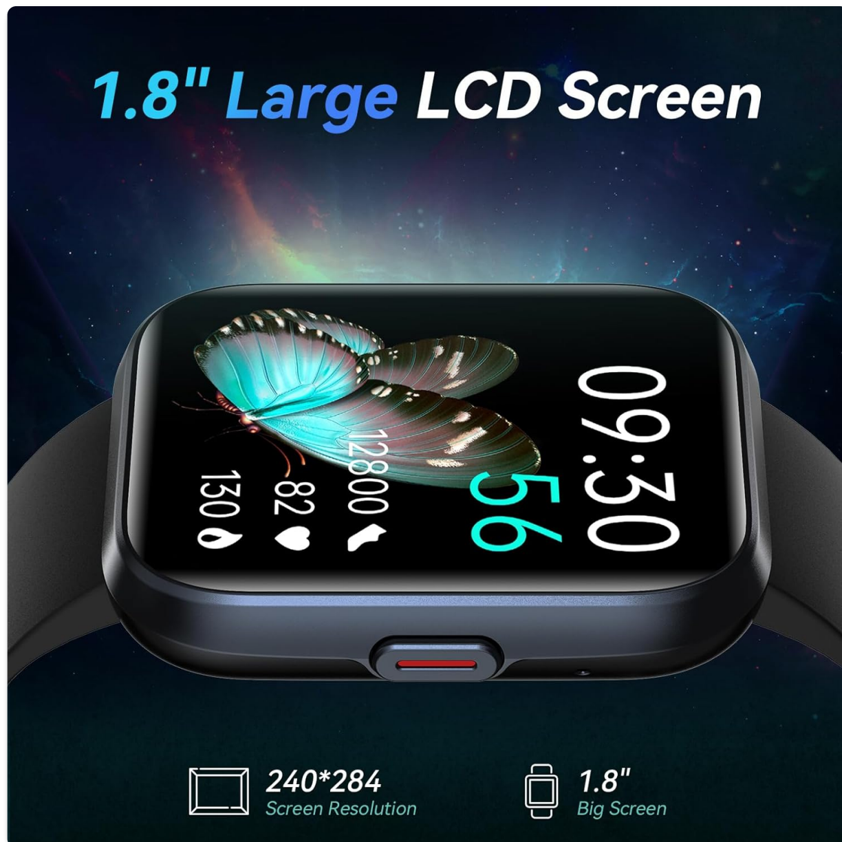
Image: The Fitpolo W208 Plus Smart Watch screen, emphasizing its 1.8-inch size and 240x284 resolution.

The Fitpolo W208 Plus features a 1.8-inch TFT-LCD colorful touchscreen for intuitive navigation. Swipe left, right, up, or down to access different functions and menus. The side button typically serves as a home button or to wake/sleep the screen.