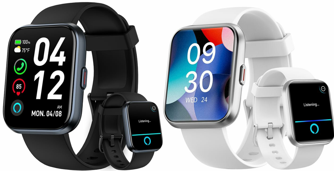
Image: The Fitpolo W208 Plus Smart Watch with its main display showing time, date, weather, and health metrics.