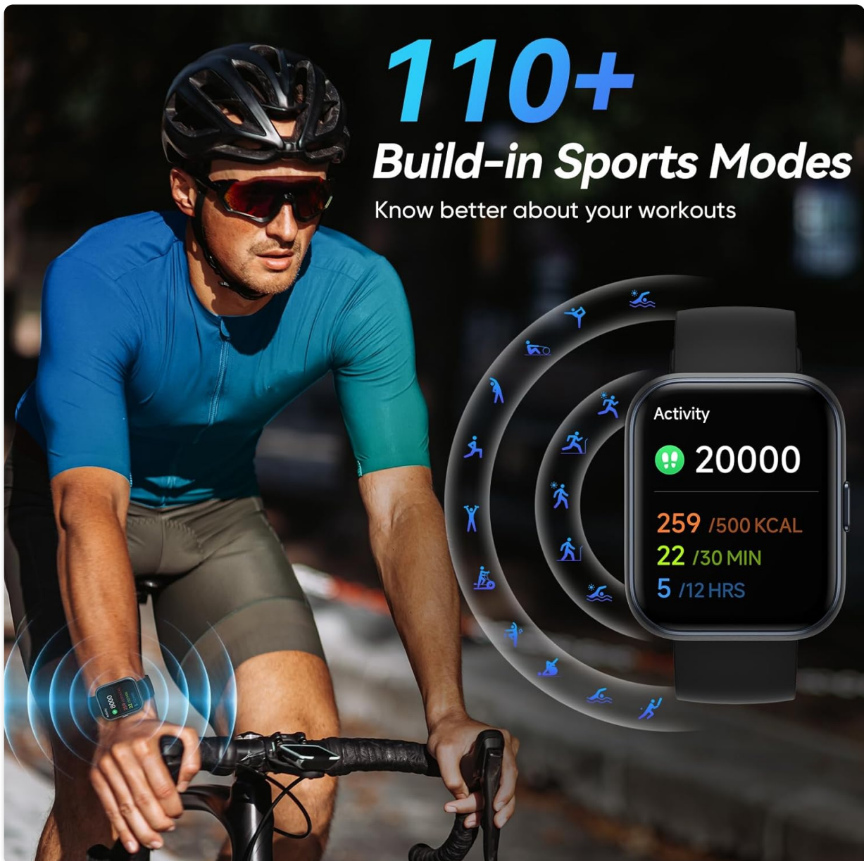
Image: A person cycling while wearing the Fitpolo W208 Plus Smart Watch, with icons representing over 110 built-in sports modes.