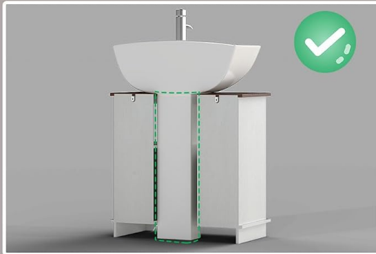
Évier avec socle