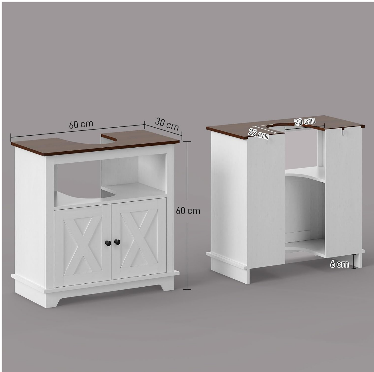
Image: Dimensional diagram of the cabinet, highlighting the overall size and the U-shaped cutout for sink compatibility.