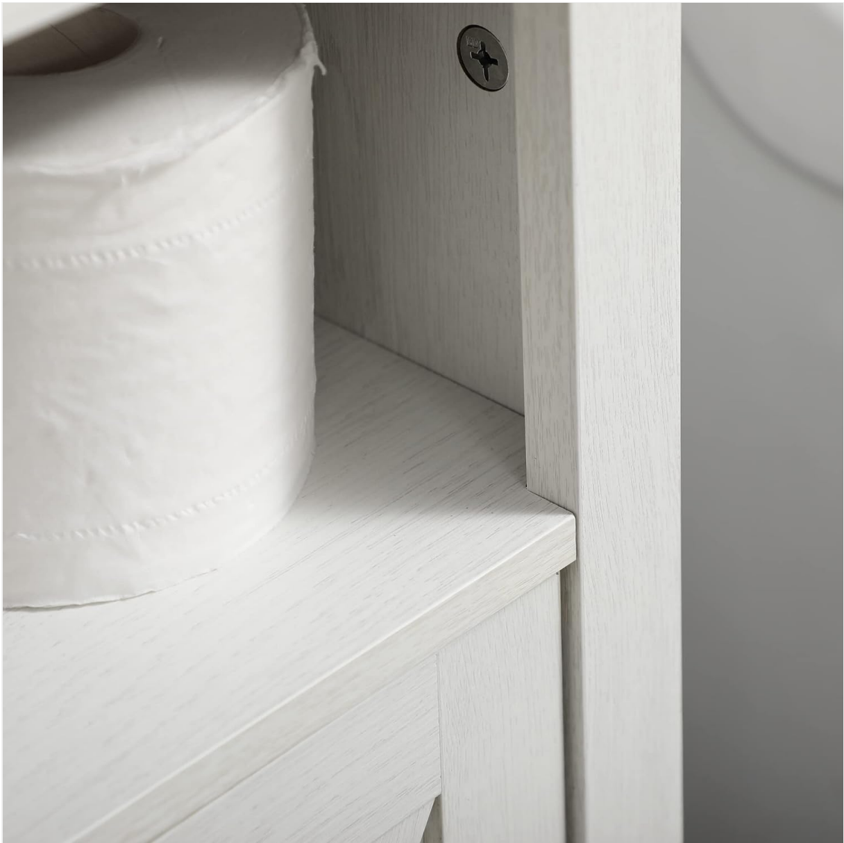
Image: Close-up view of the interior shelf, demonstrating its capacity for items like toilet paper rolls.