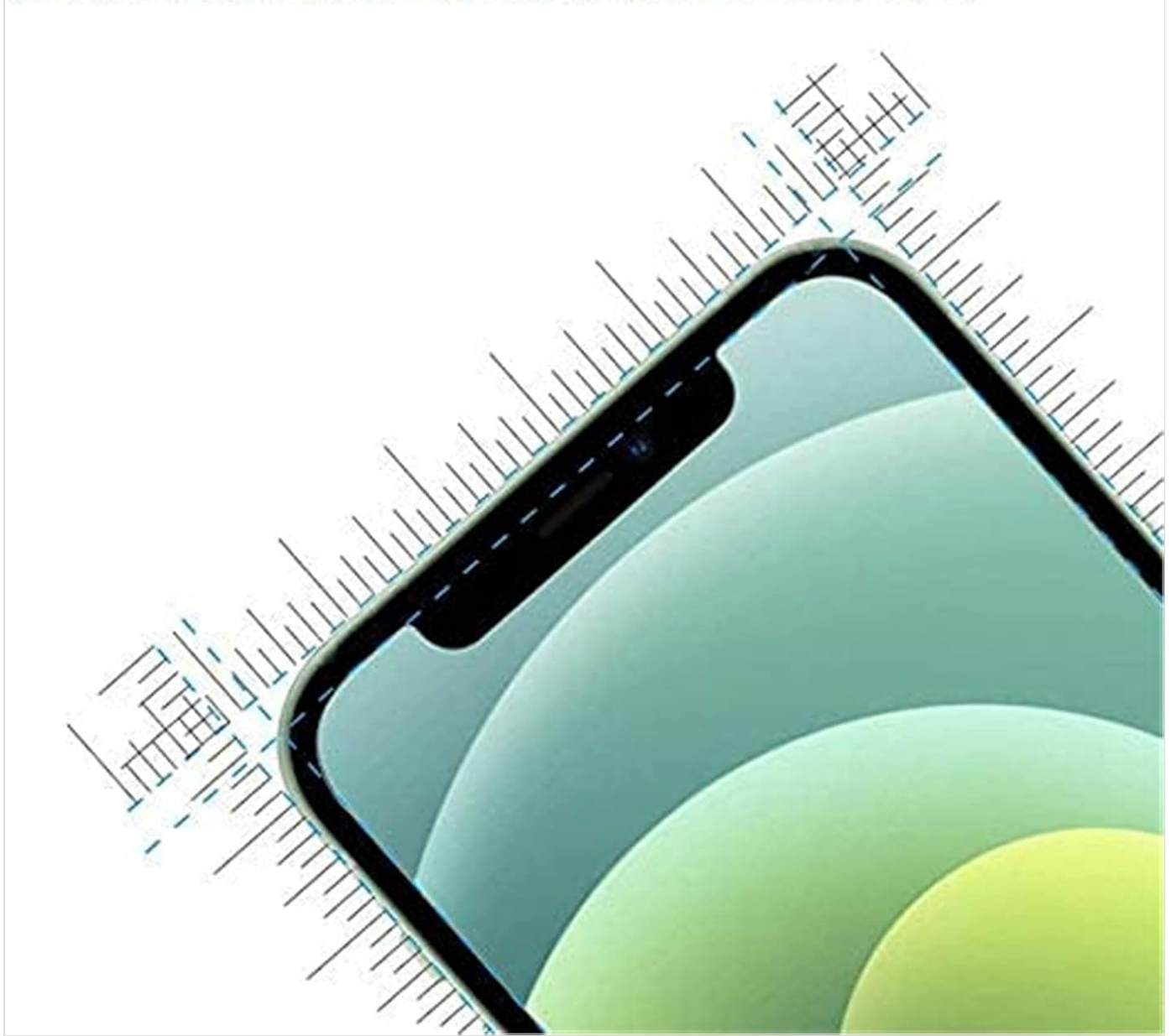
Image: Diagram illustrating the case-friendly design, showing the screen protector is slightly smaller than the phone's display to accommodate cases.

Protector is smaller than the actual size of the phone to ensure it is compatible with MOST cases.