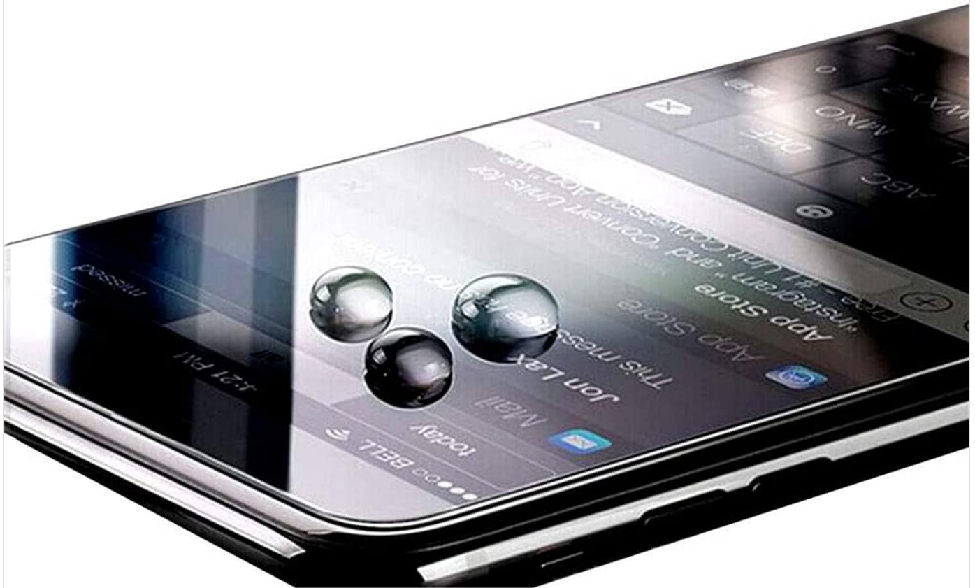
Image: Close-up demonstrating the oleophobic coating's ability to repel liquids and reduce fingerprints.

Oleo-phobic coating: protect against sweat and reduce fingerprints