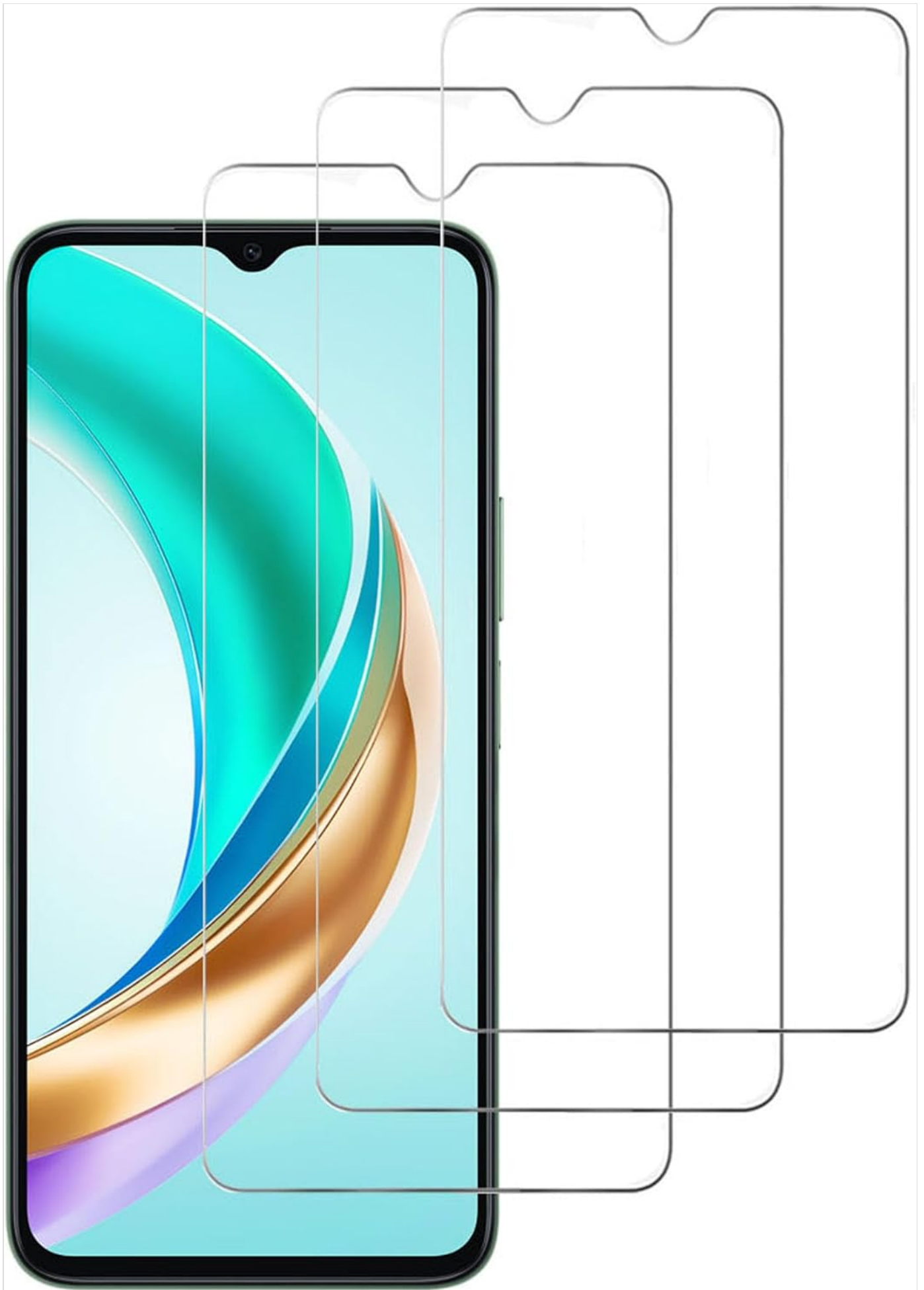
Image: The Vortex CB68 phone alongside three tempered glass screen protectors, illustrating the product package.