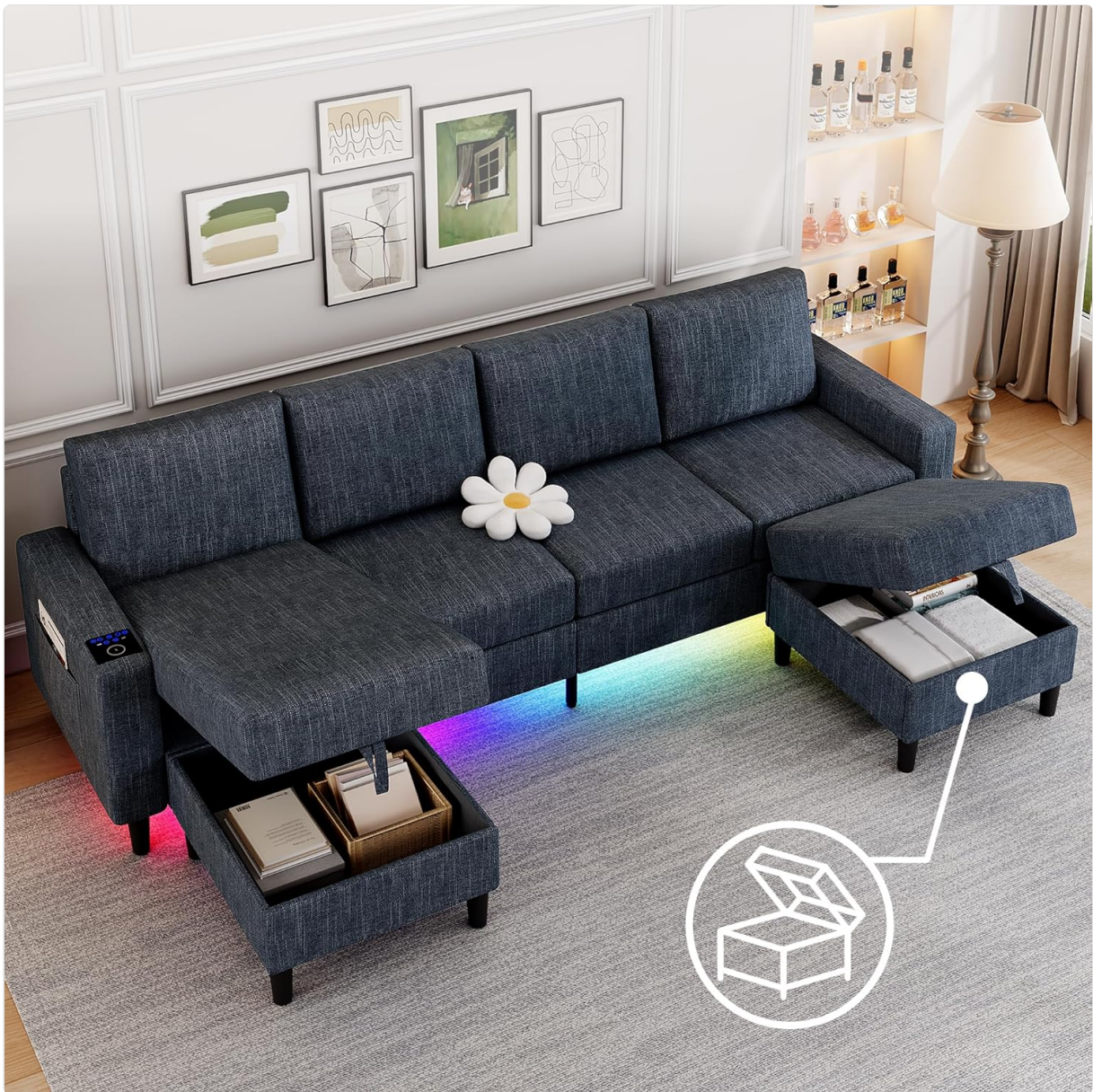
Figure 5.4: The movable ottomans offer integrated storage space.