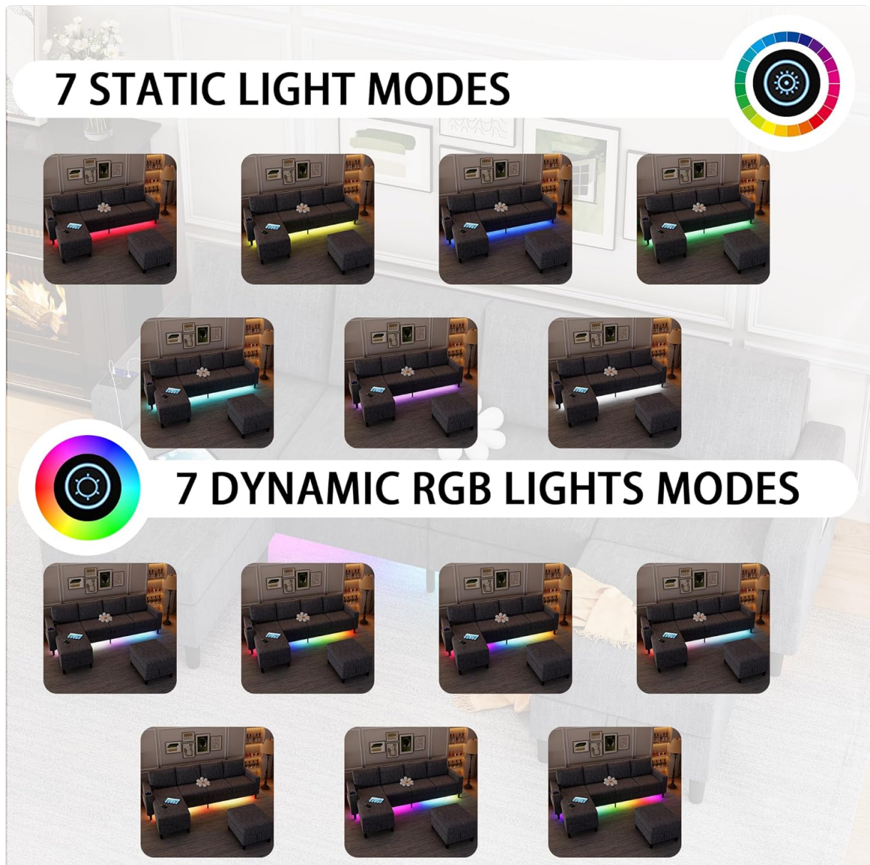
Figure 5.2: Visual representation of the 7 static and 7 dynamic RGB light modes.