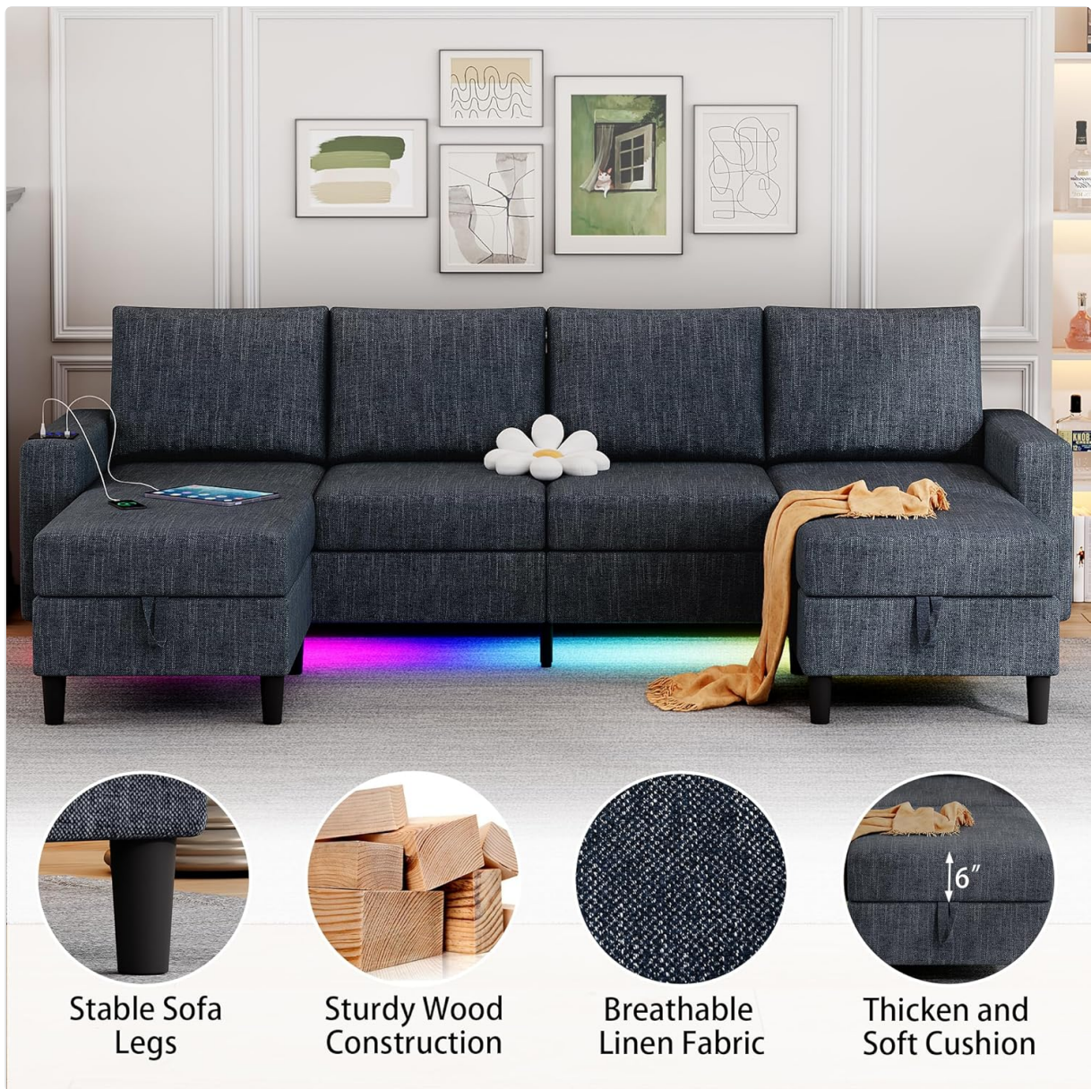
Figure 6.1: Key features of the sofa's construction and materials, including stable legs, wood frame, breathable linen, and thick cushions.