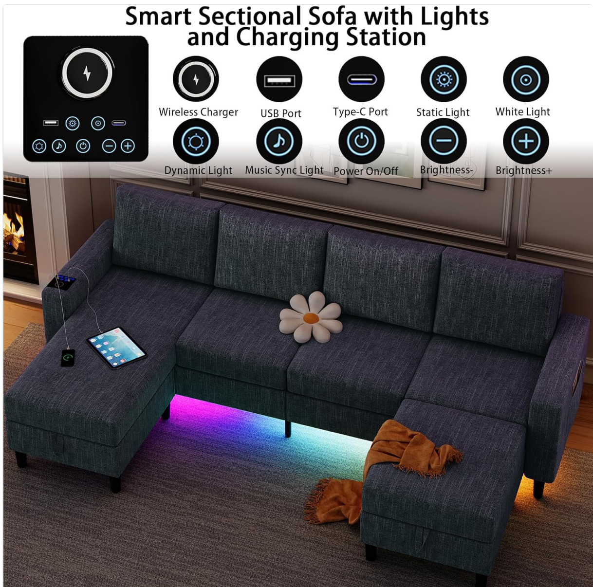
Figure 5.1: Smart module control panel.