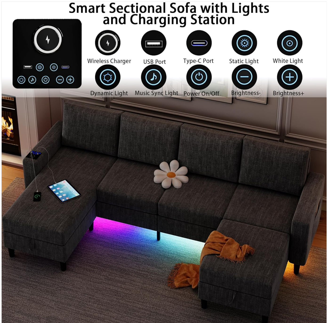
Figure 3: Smart Module and Control Panel. This image highlights the smart module with wireless charging, USB, and Type-C ports, along with the control panel for the RGB LED lights.