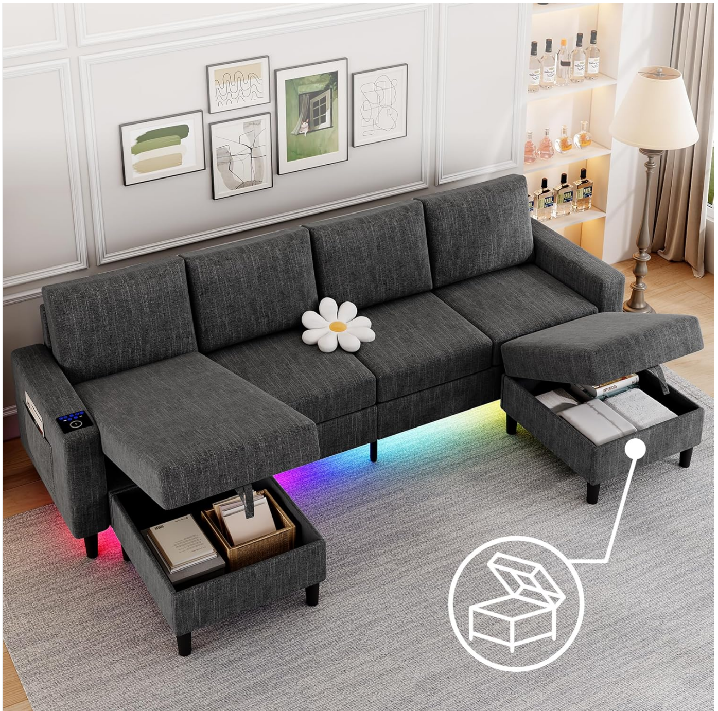
Figure 5: Storage Ottoman. This image illustrates the hidden storage capacity within the movable ottomans, perfect for blankets, books, or other items.