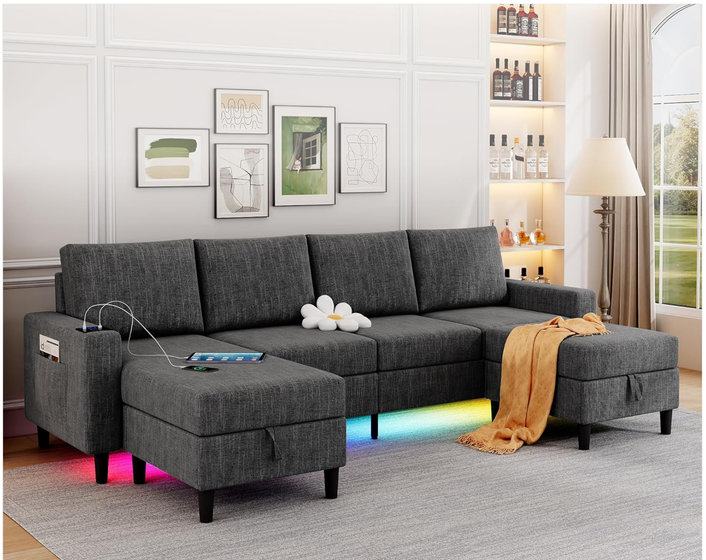
Figure 4: LED Light Modes. This visual guide displays the various static and dynamic RGB light modes available for your sectional sofa.