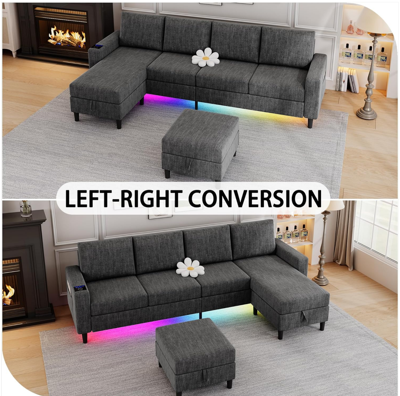
Figure 2: Left-Right Chaise Conversion. This image demonstrates how the chaise lounge can be configured on either the left or right side of the sofa to suit your living space.