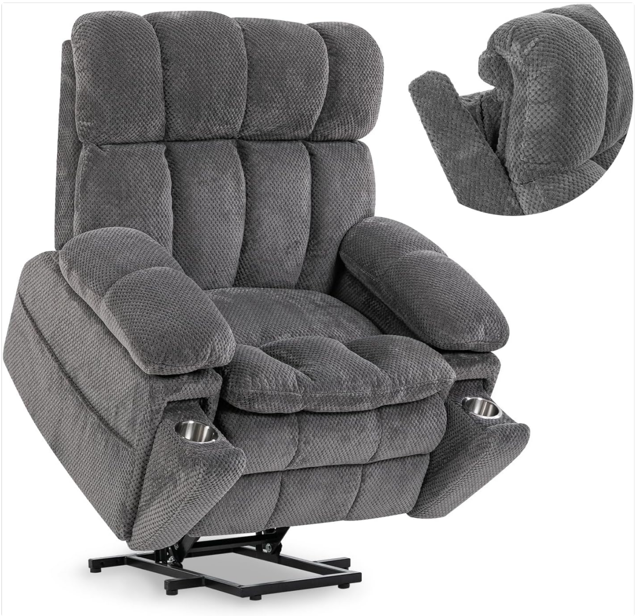
Figure 4.1: Fully assembled Zuacs Dual Motor Power Lift Recliner Chair.