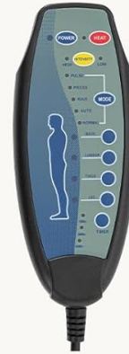
Figure 5.7: Massage and heating zones diagram.