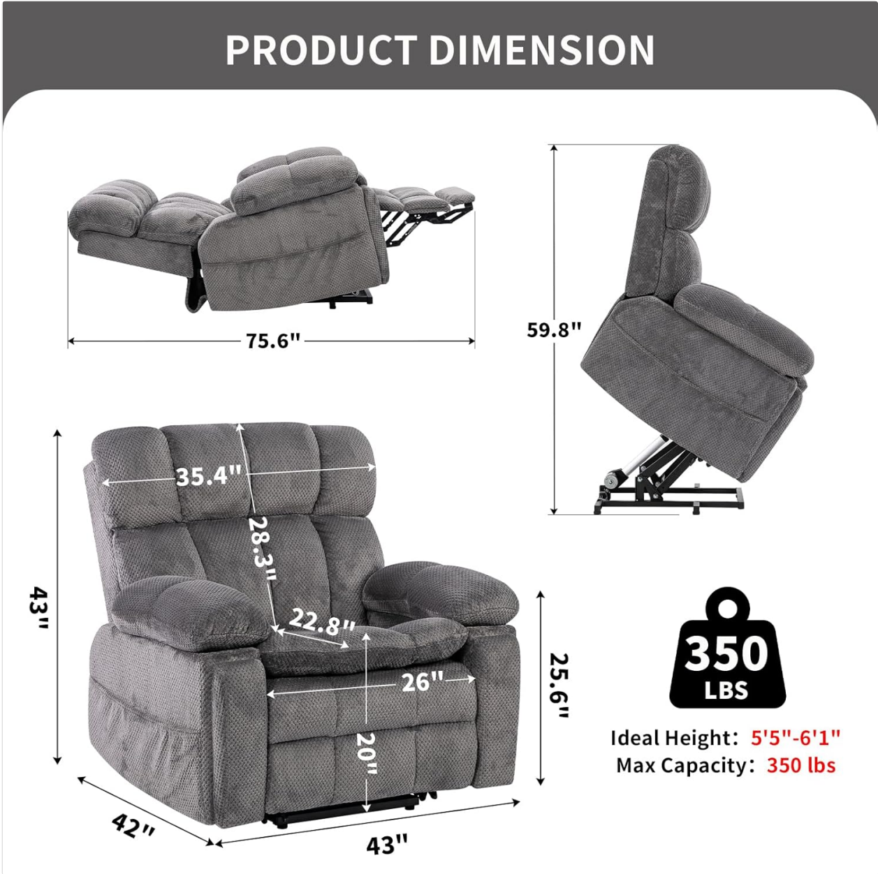
Figure 8.1: Detailed product dimensions.