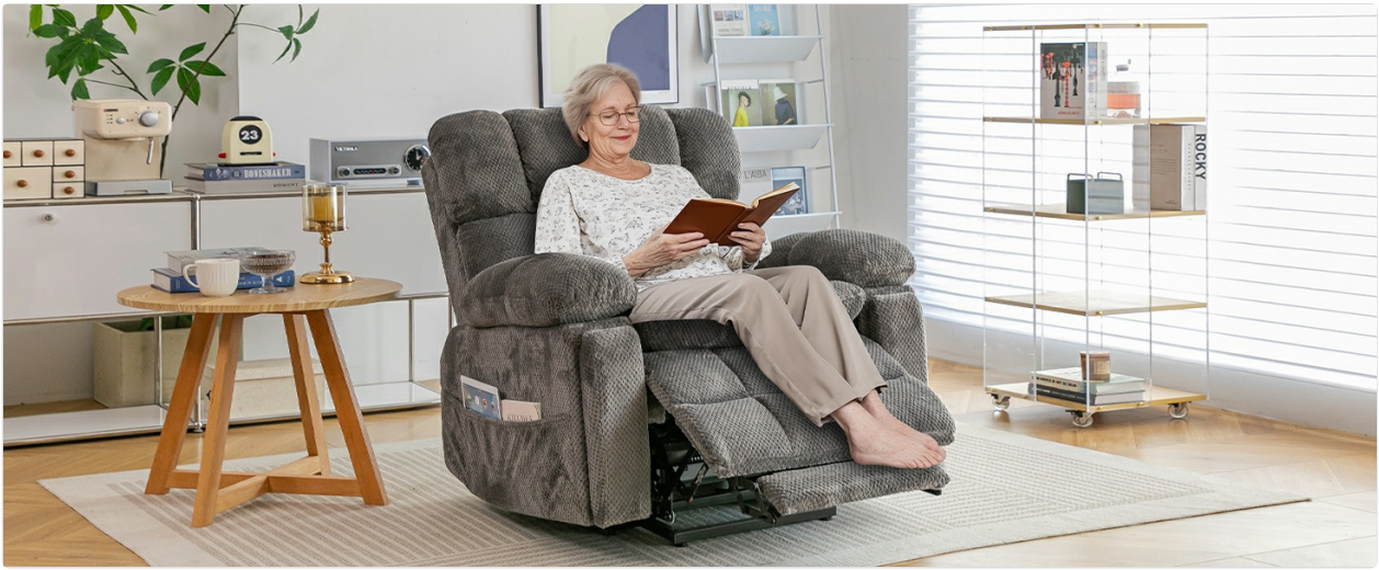
Figure 5.2: Demonstrating the power lift function for easy standing.