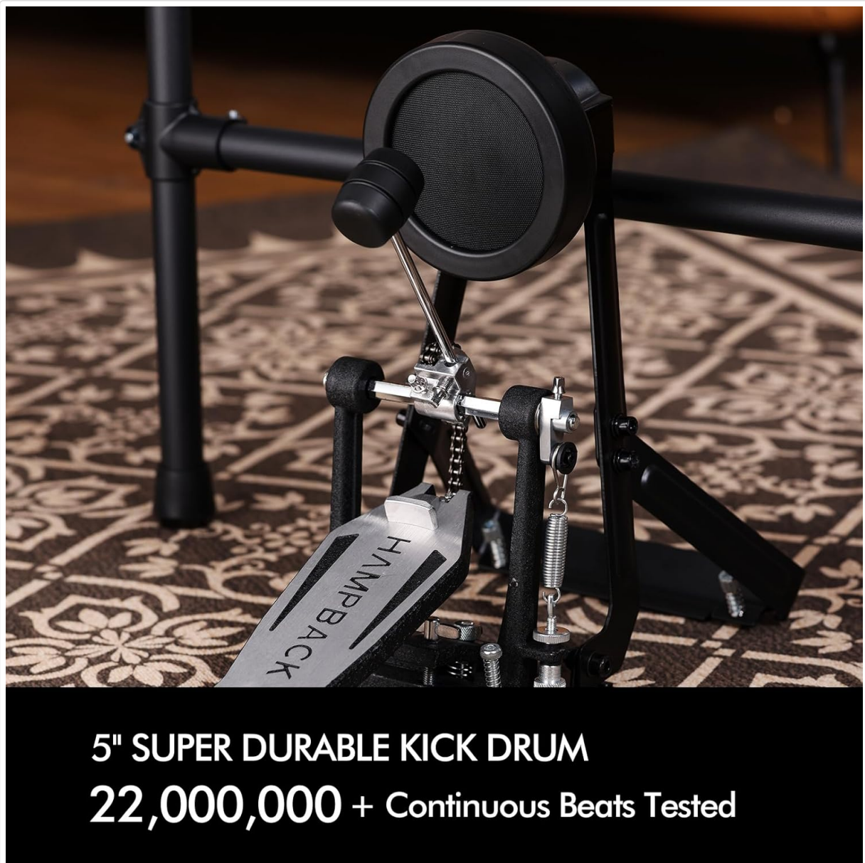
Figure 5: The 5-inch super durable bass drum pad and pedal assembly, engineered for extensive use and consistent performance.