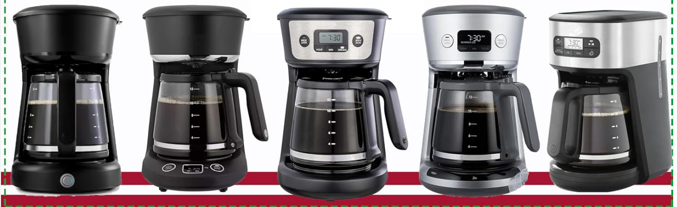
Image: A visual guide indicating compatibility with various Mr. Coffee 12-cup models, including RF, PC, SC, BVMC-RF300, BVMC-MSX23-NLY, BVMC-SC12BL1-2, and BVMC-PL12BL1-NP Series. Several Mr. Coffee machines are pictured below the compatibility text.