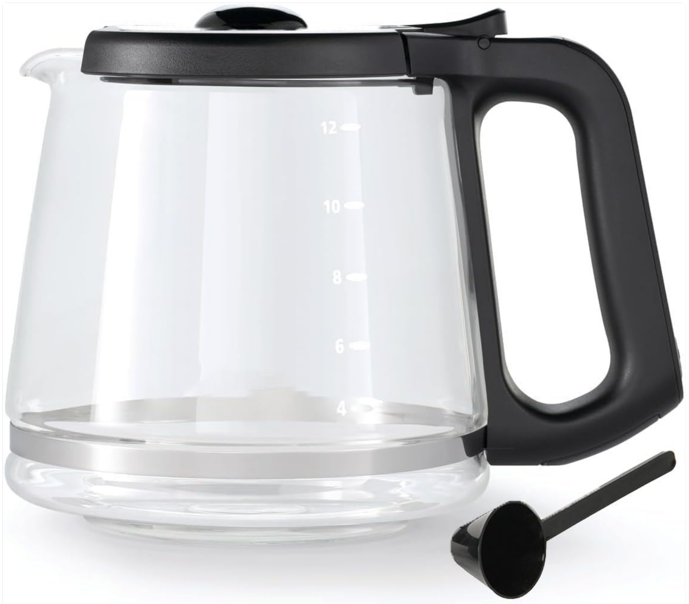
Image: The cupsync 12-Cup Coffee Pot Replacement, a clear glass carafe with a black handle and lid, shown alongside a black coffee measuring spoon.