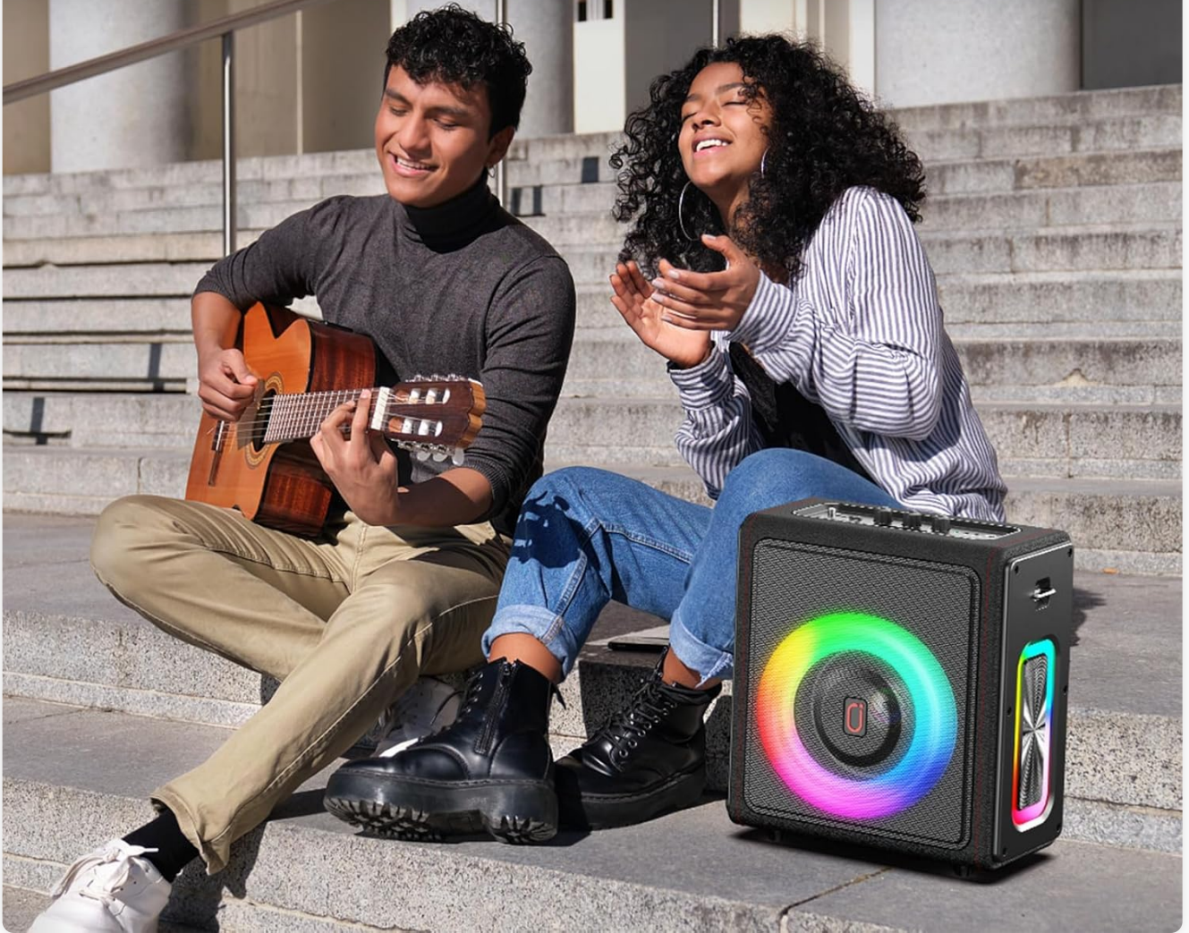
Image: The MS75 karaoke machine highlighting its 6000 mAh battery, indicating a charging time of 4-5 hours for up to 24 hours of playing time.