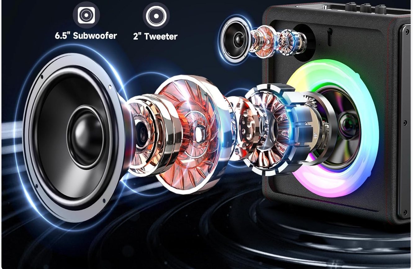
Image: An exploded view of the MS75 karaoke machine, illustrating its internal components including the 6.5-inch subwoofer, 2-inch tweeter, DSP chip, and 60W power for superior stereo sound.