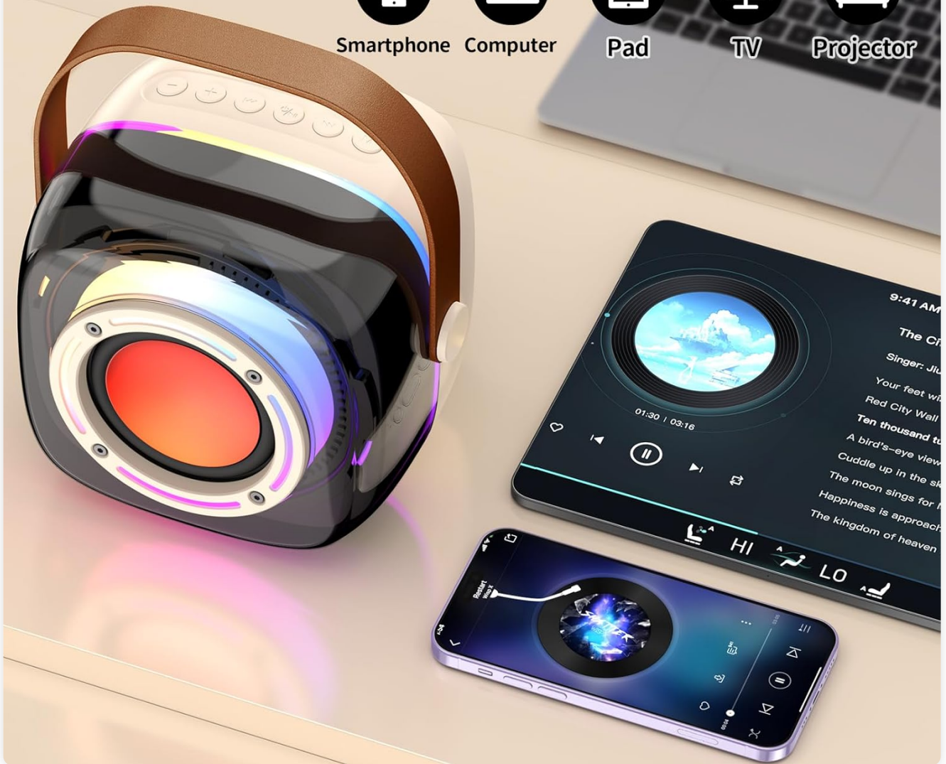
Image: The D39T mini karaoke machine demonstrating compatibility with various devices such as smartphones, computers, pads, TVs, and projectors.