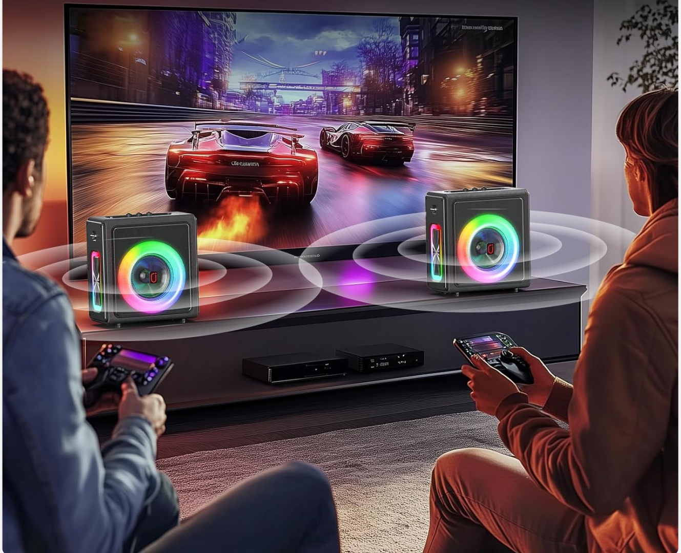
Image: Two MS75 karaoke machines positioned to demonstrate True Wireless Stereo (TWS) pairing, providing low-latency, high-fidelity stereo sound for an immersive experience.

Provides low-latency, high-fidelity stereo sound