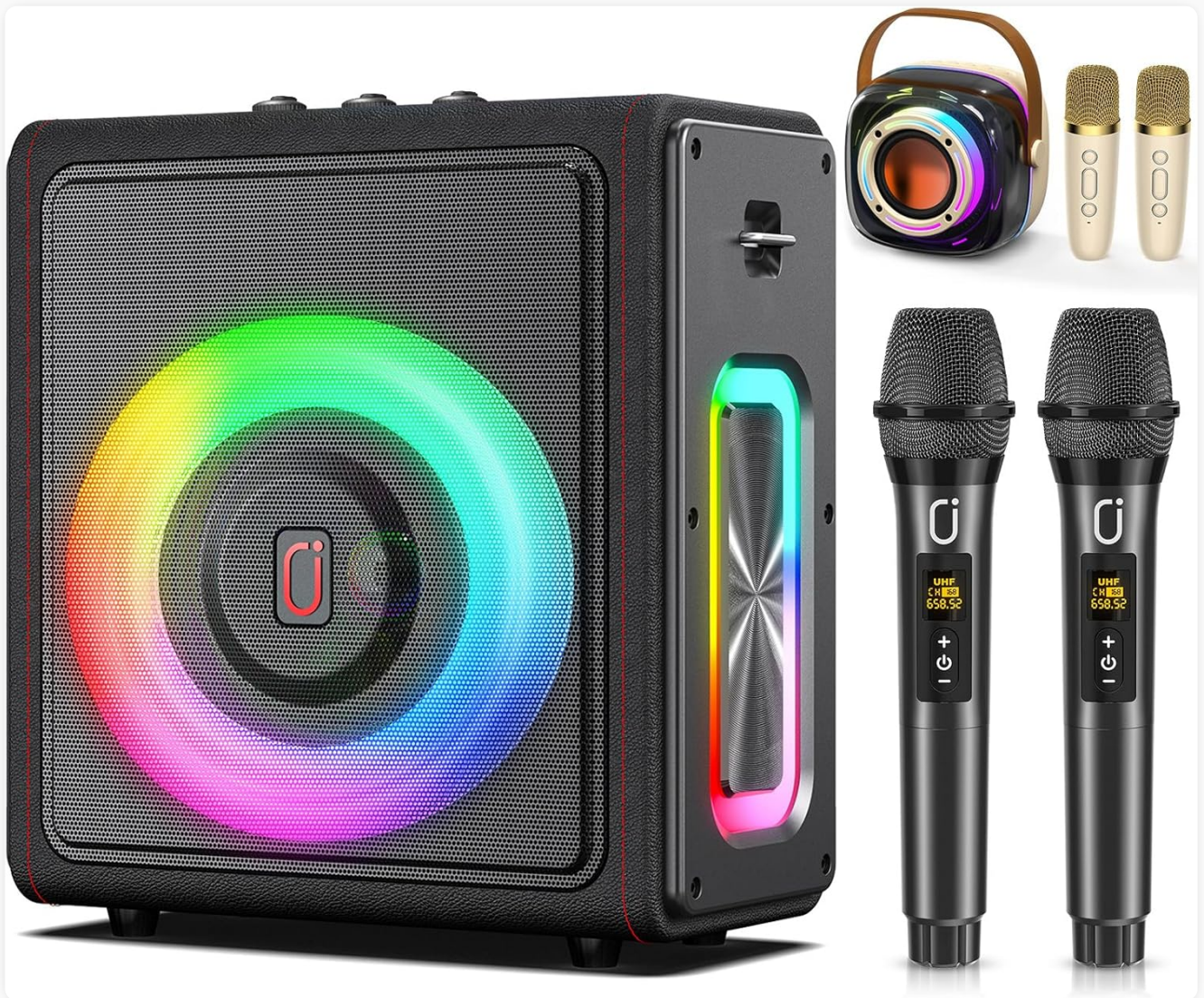
Image: The PPMIC MS75 karaoke machine, the smaller D39T mini karaoke machine, and two wireless microphones, illustrating the complete combo package.