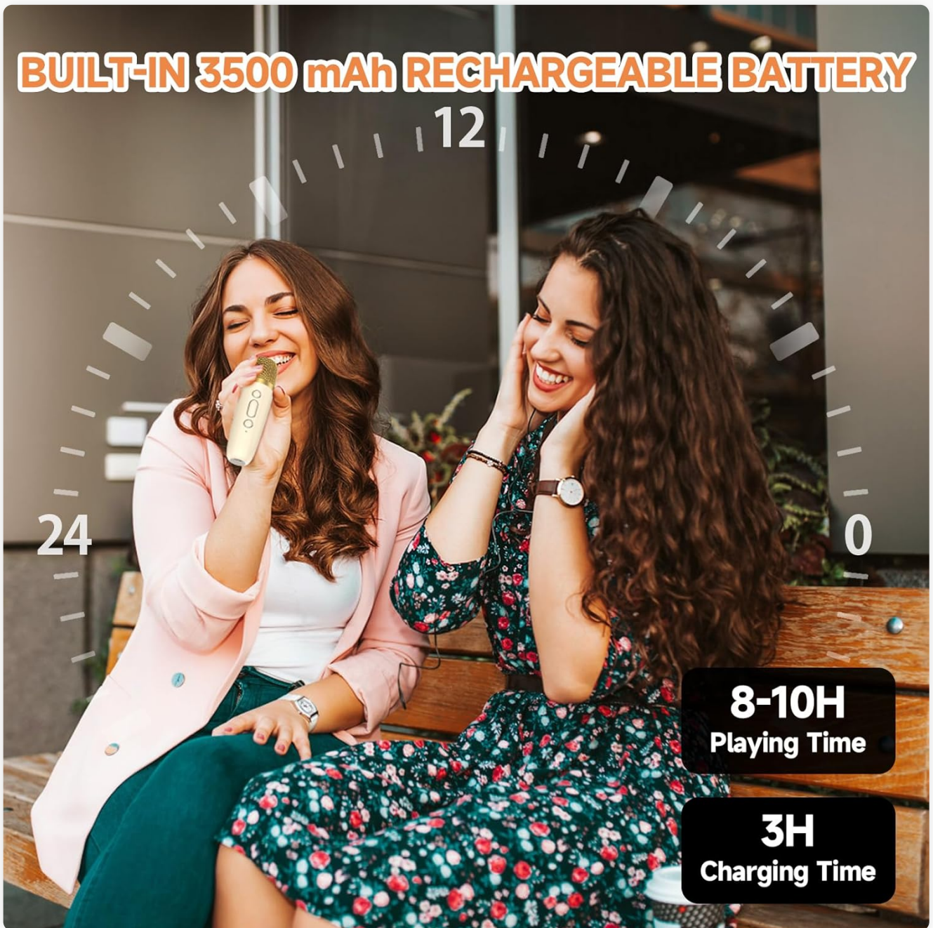
Image: The D39T mini karaoke machine, showing its 3500 mAh battery, providing 8-10 hours of playing time after 3 hours of charging.