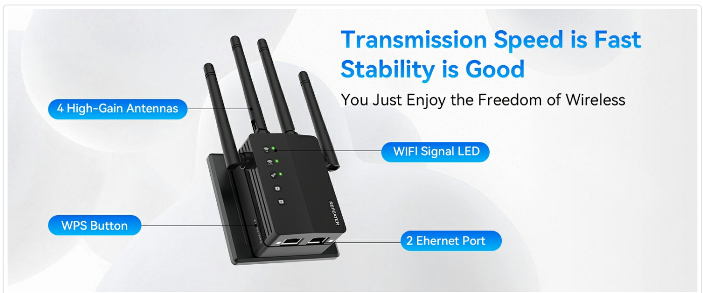
Figure 2: Key features of the WiFi Extender 56789.