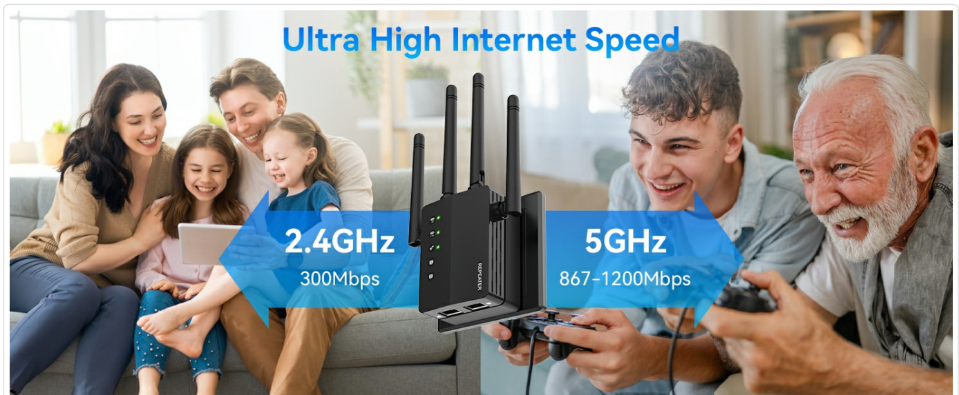
Figure 4: Illustration of dual-band speeds and family enjoying high-speed internet.