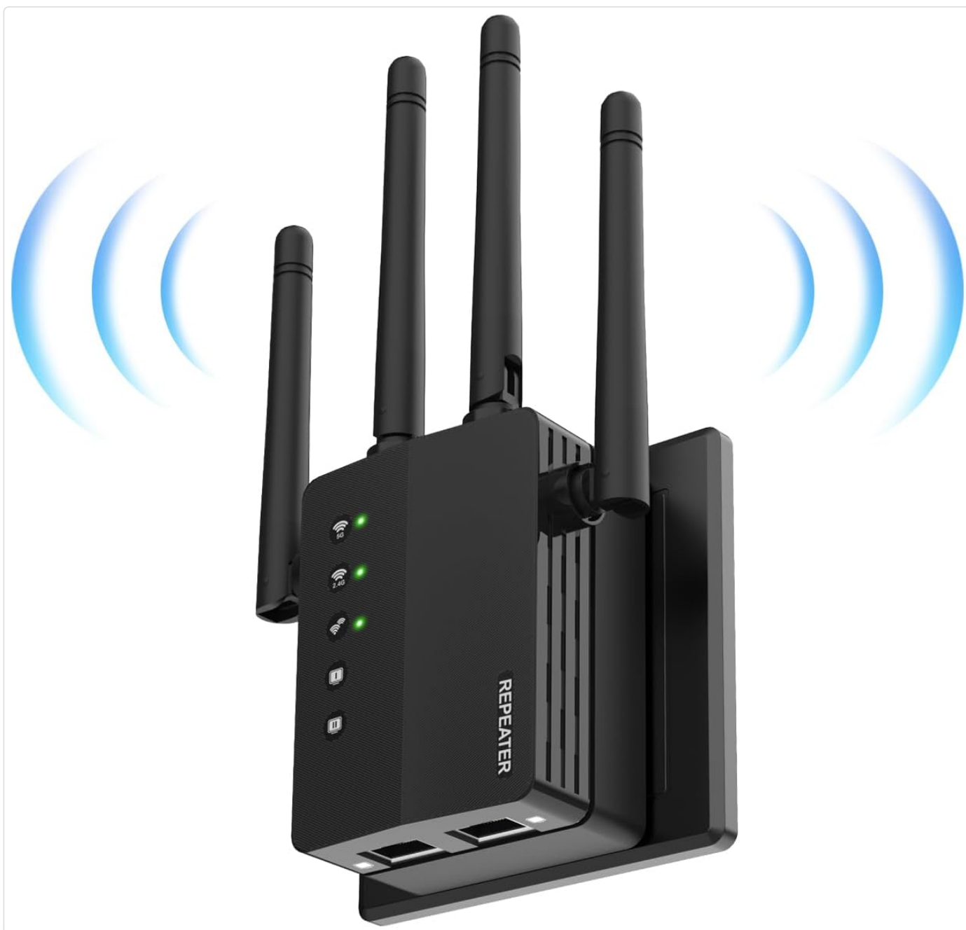
Figure 1: GEYILO WiFi Extender 56789 product view.