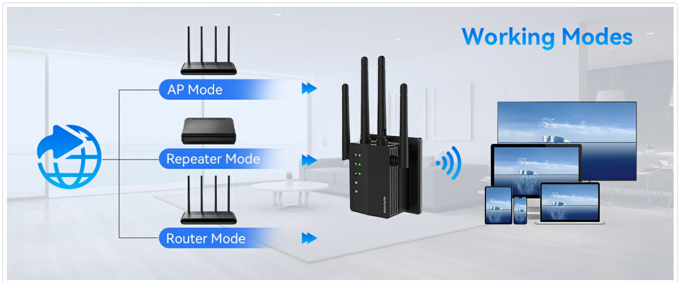
Figure 5: Working modes of the WiFi Extender 56789.