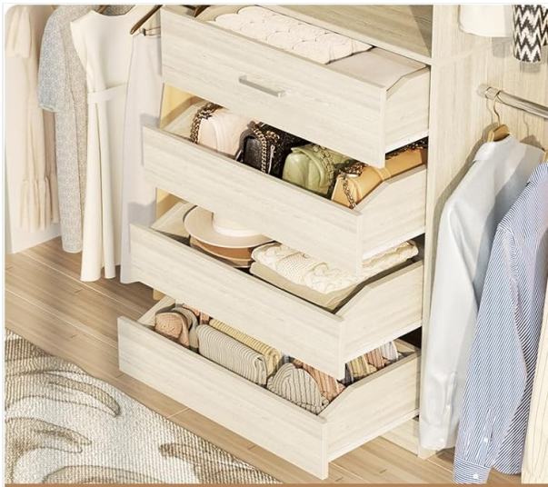
4 Large Wooden Drawers