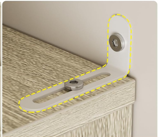
Anti-tip Kits to Ensure Safety

This image highlights key features of the closet system: four large wooden drawers for organized storage, adjustable height shelves for flexible configuration, four expandable depth rods for varying clothing lengths, and anti-tip kits designed to ensure stability and safety.