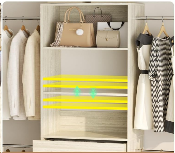
Adjustable Height Shelves