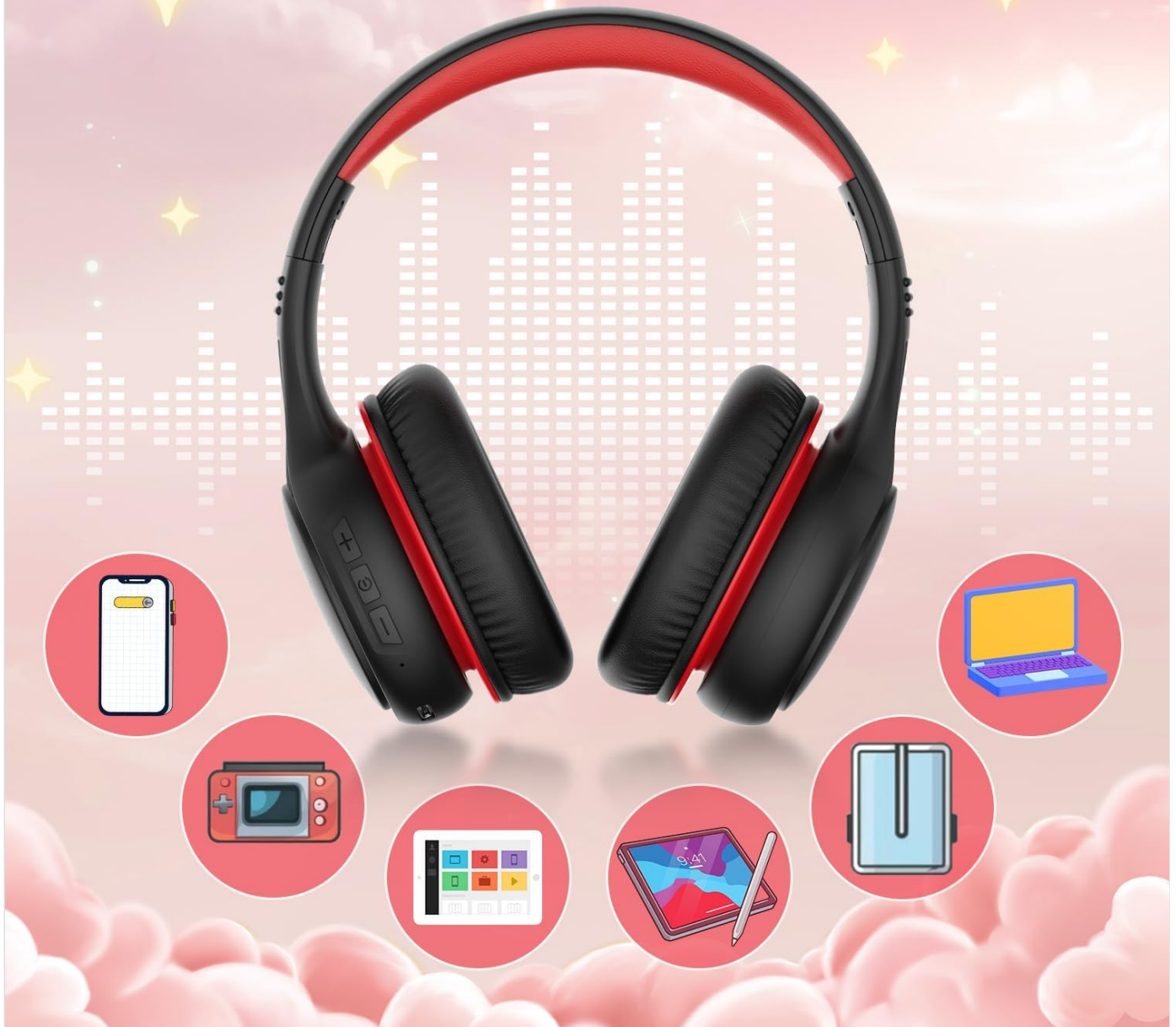
Image: The headphones are shown with icons representing compatible devices such as smartphones, gaming consoles, tablets, and laptops, illustrating wide compatibility.