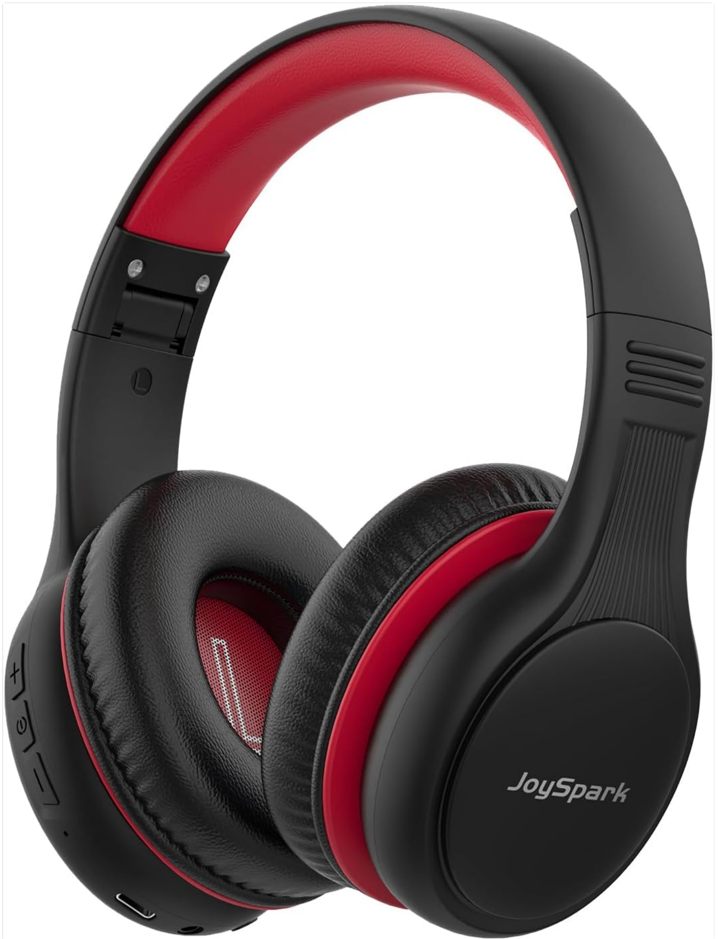
Image: Front view of the JoySpark Kids Bluetooth Headphones B08 in black and red. The headphones feature soft earcups and an adjustable headband. The right earcup shows control buttons and a charging port.