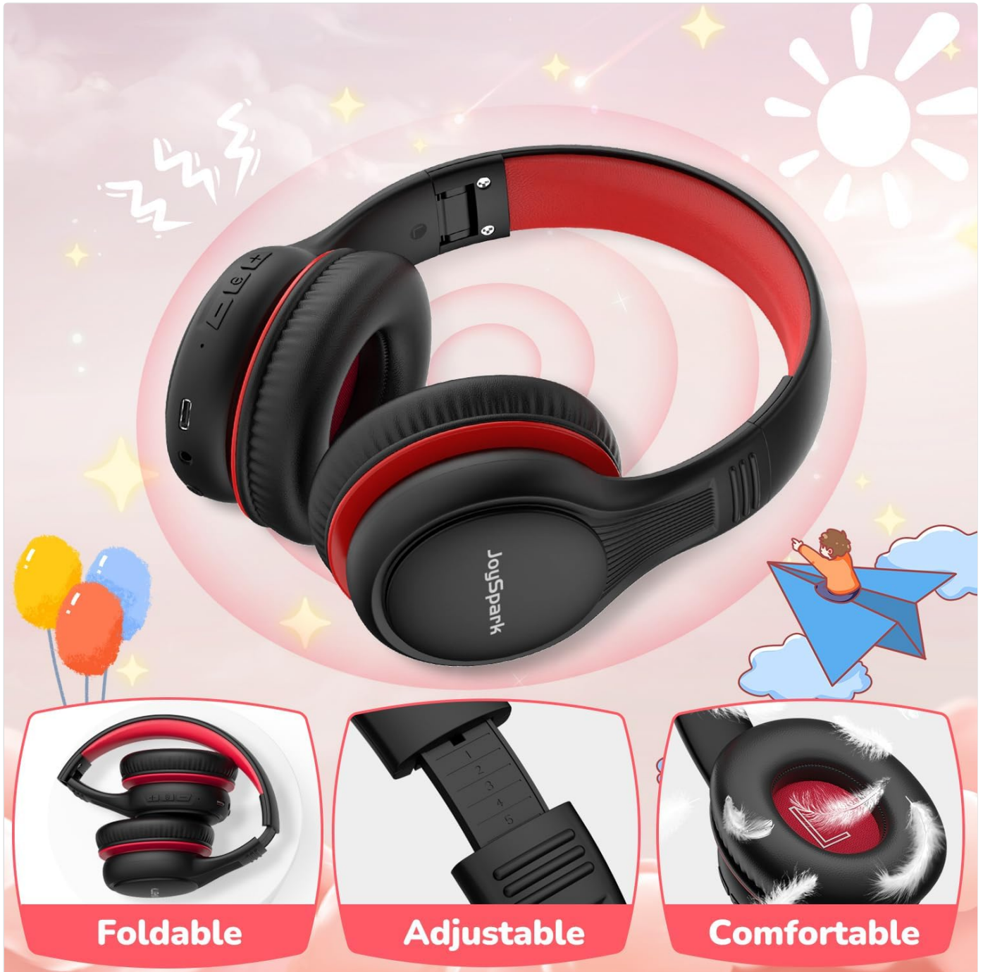
Image: A composite image demonstrating the headphones' foldable design for easy storage, adjustable headband for a custom fit, and soft ear cushions for comfort.