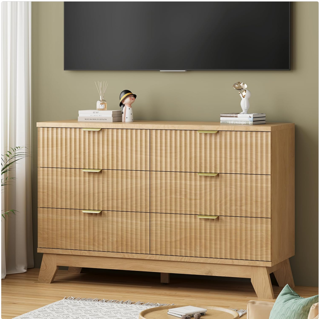
Image: Detailed view highlighting the adjustable feet, stable base, chic metal handle, and the distinctive fluted panel design of the dresser.