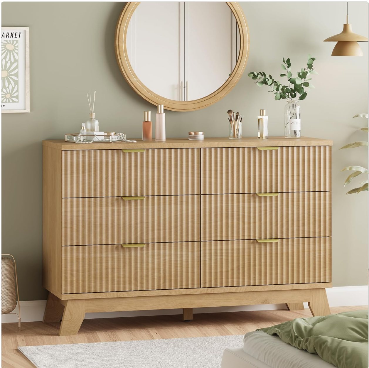
Image: The Xixini Fluted Dresser in Natural Oak, showcasing its unique wave-like fluted panel design and metal handles.