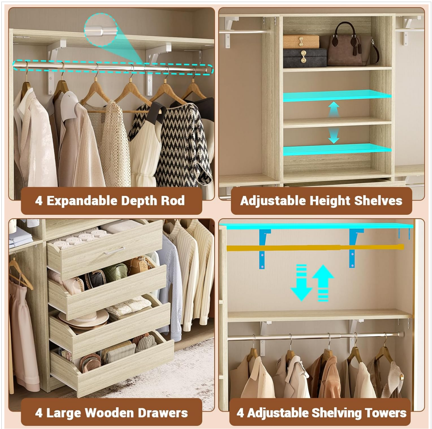
Image: Close-up view highlighting key features: expandable depth rods, adjustable height shelves, and four large wooden drawers within the central tower.