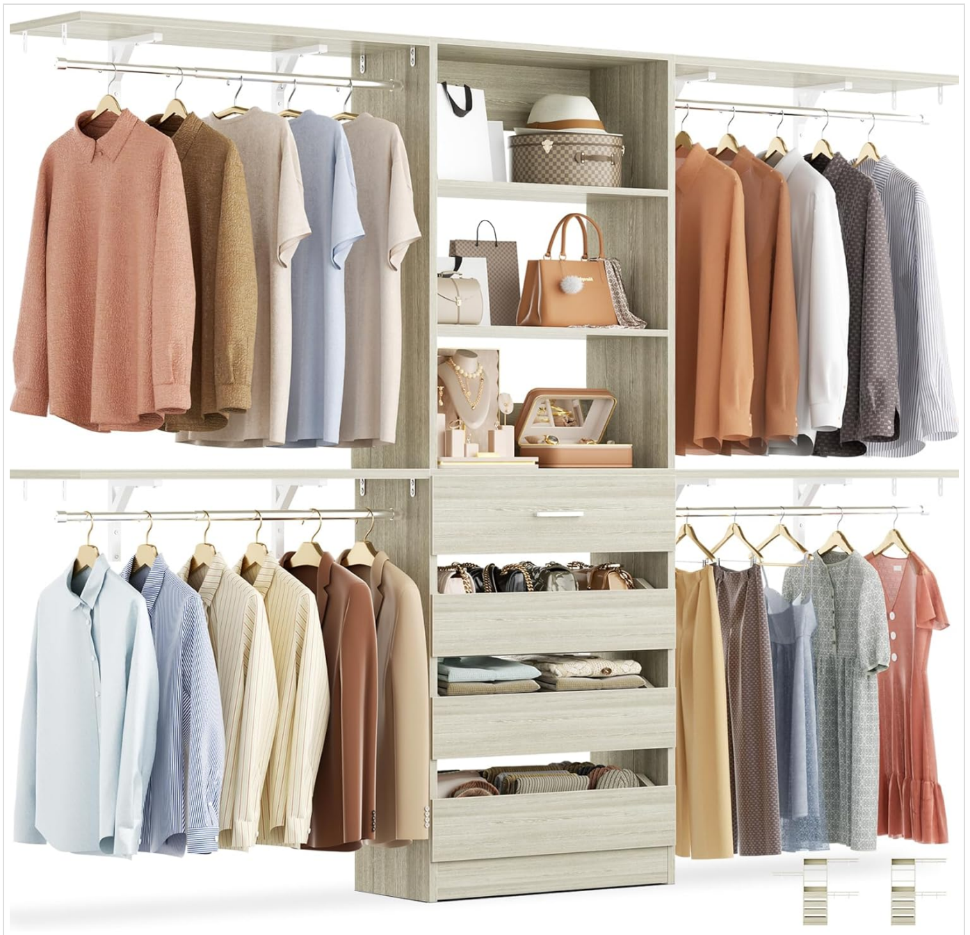
Image: The Aheaplus 8FT Wood Closet Organizer System, showcasing its central tower with shelves and drawers, flanked by hanging rods and upper shelves, all in a White Oak finish.