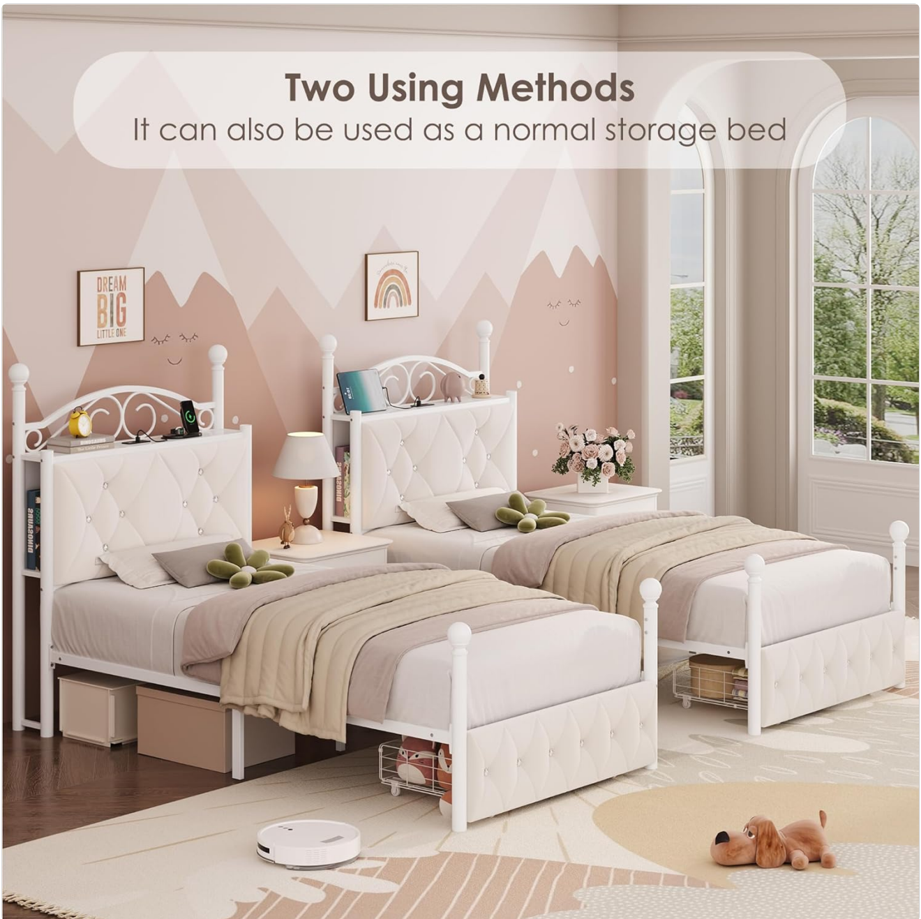
Image 5.2: The bed frame demonstrating its dual functionality, usable as a canopy bed or a standard platform bed.

It can also be used as a normal storage bed