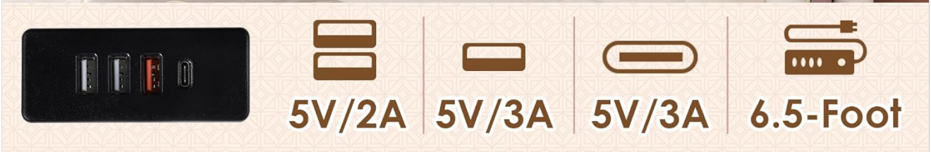
Image 5.1: The headboard's integrated charging station with various ports for electronic devices.