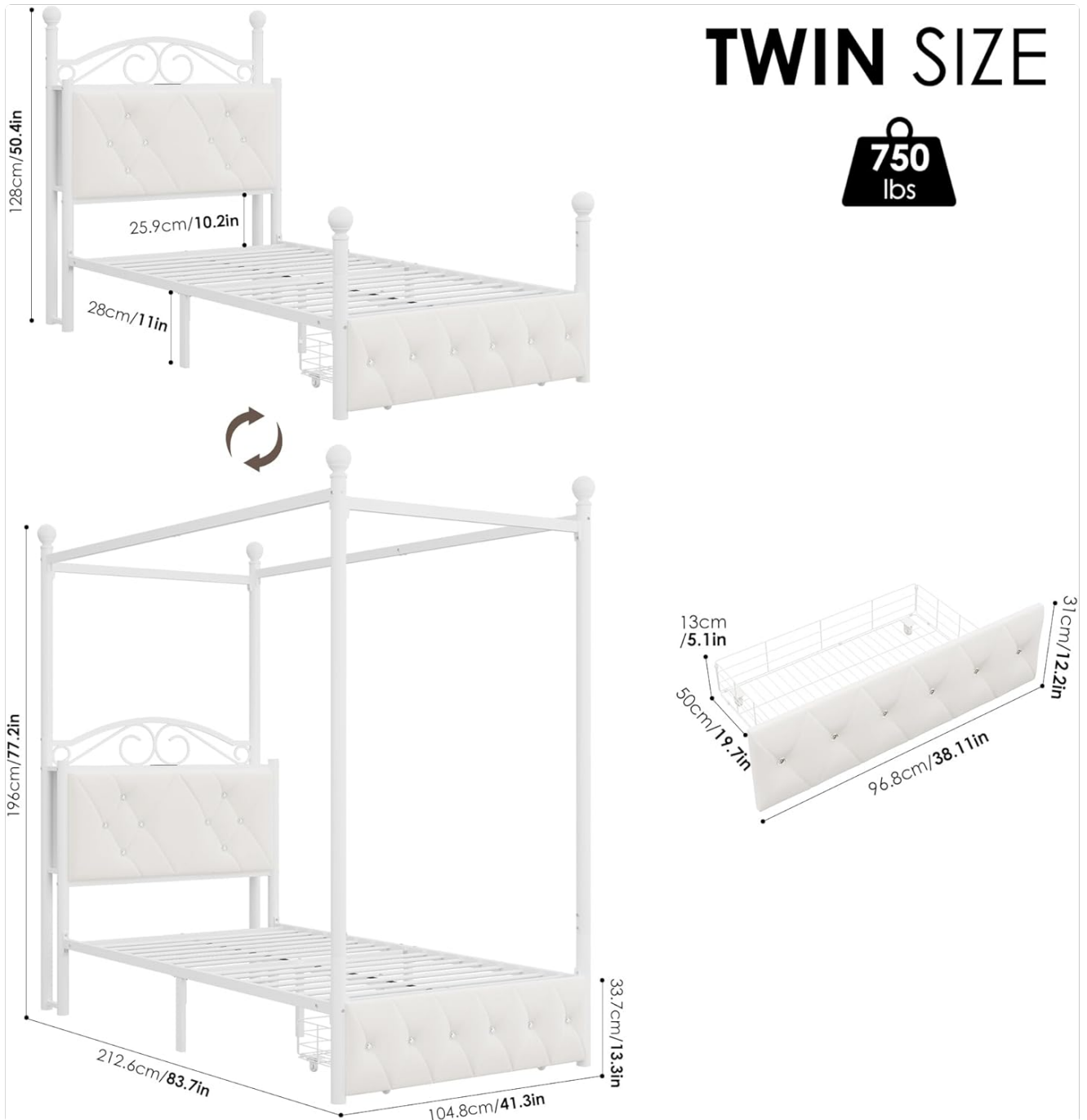
Image 8.1: Dimensional drawing of the Keyluv Twin Bed Frame, indicating overall size and weight capacity.