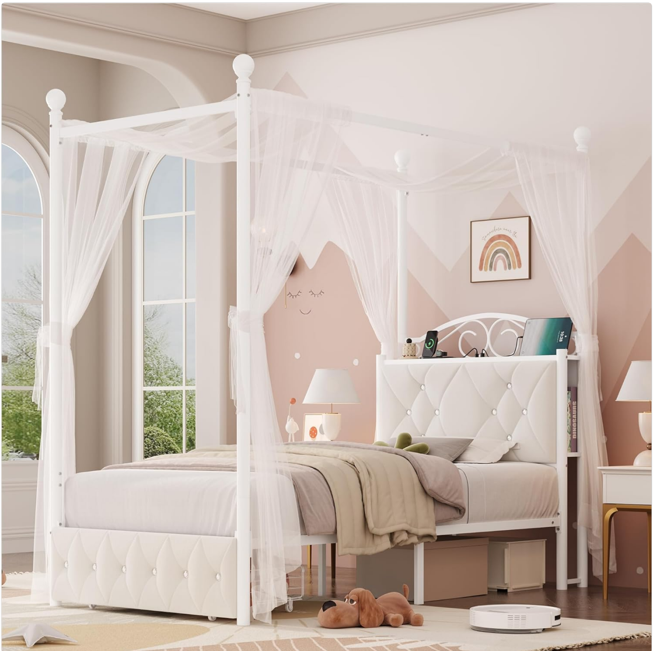
Image 1.1: The Keyluv Twin Upholstered Canopy Bed Frame in a bedroom setting, showcasing its design and canopy posts.