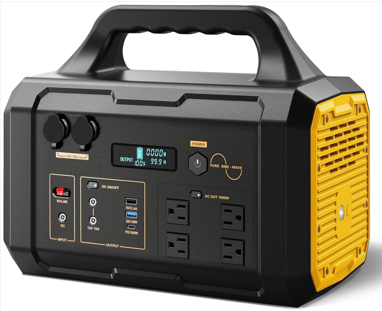
Image 2.1: Front view of the Barphygo G1000 Portable Power Station, showing the handle, display, and various output ports.