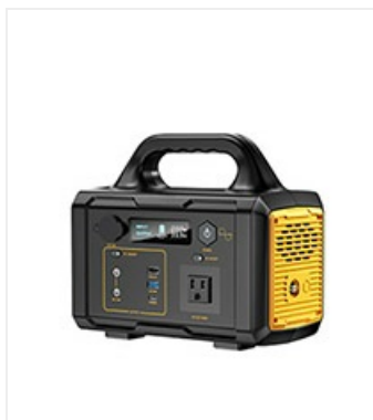
Image 4.4: The LED light function showing its three operational modes.

To activate or cycle through the modes, press the LED light button located on the unit.