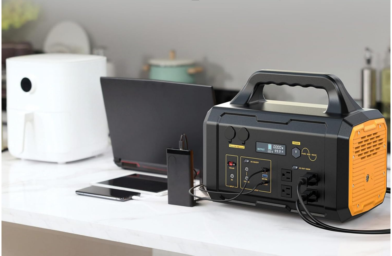
Image 4.2: Overview of output ports and simultaneous device charging capability.