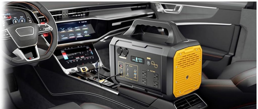
Image 3.1: Illustration of the three available charging methods for the Barphygo G1000.

Car Charger 8-10 Hours (Charger is included)